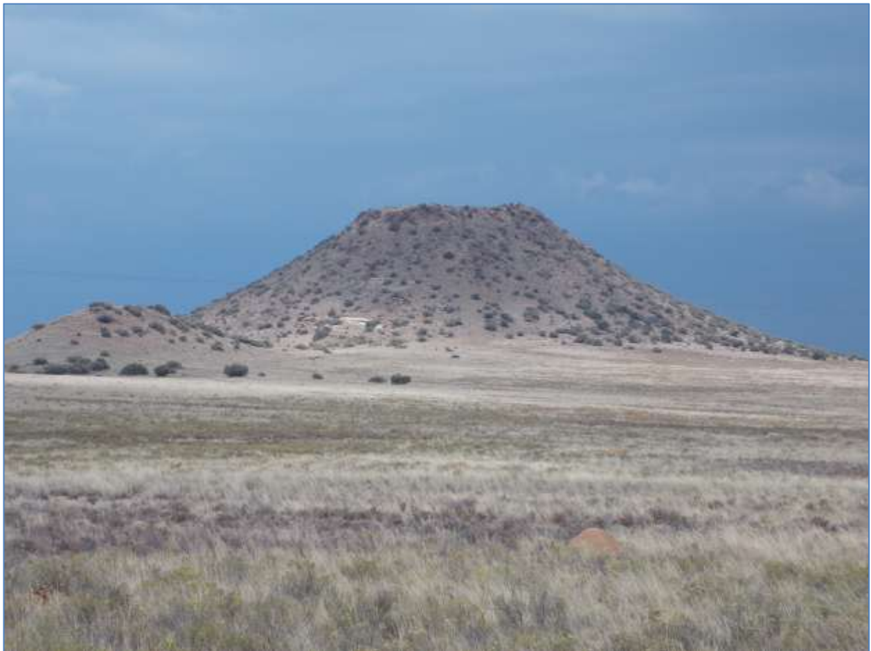
Figure 4. General landscape

Several skirmish sites related to the South African War is also found in the area and it is expected that indications of these, such as spent cartridges, tin cans etc. could be expected in the study area.