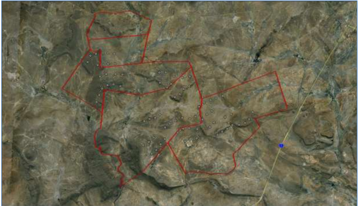
Figure 2. Aerial view of study area with turbine placements