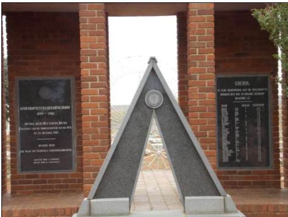
Figure 3. Springfontein Concentration Camp Cemetery

Should the developers decide to utilise any of the existing structures for their operations and this entails alterations to the buildings it is recommended that they subject these to further study before such actions.