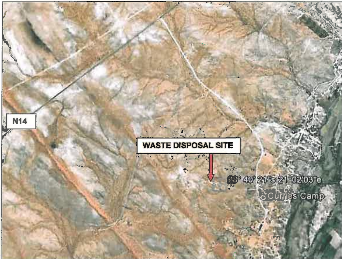
Map 2: Locality of waste disposal site at Curries Camp near Keimoes, Northern Cape (2821).