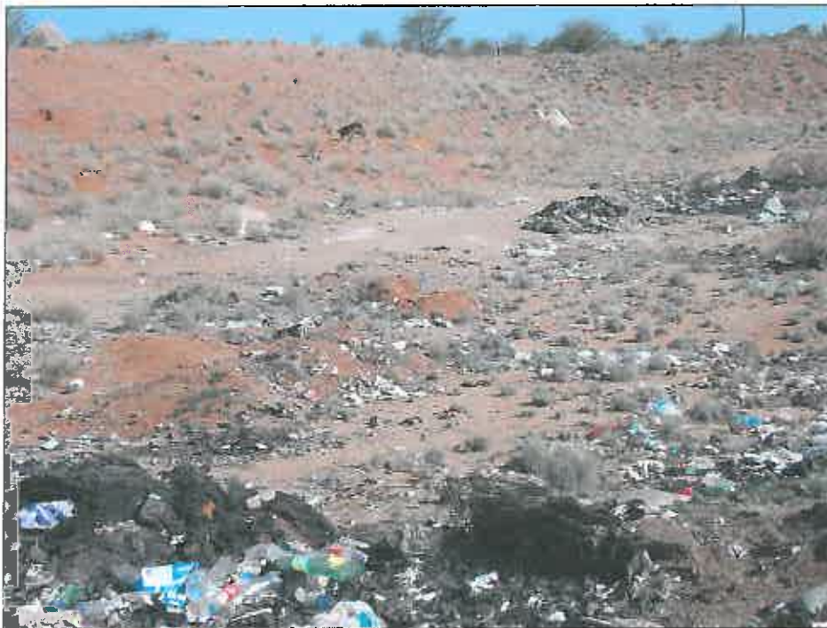
Fig.5 Waste disposal site at Curries Camp, Northern Cape.