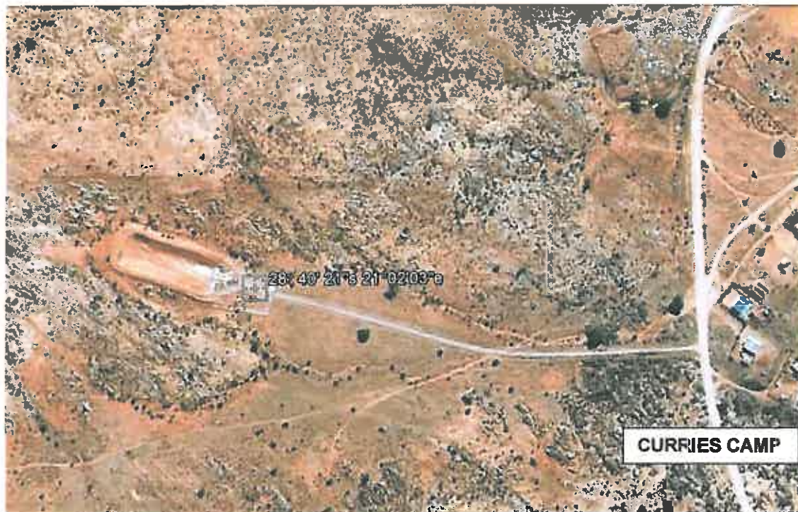
Map 3 Google image of the waste disposal site at Curries Camp near Keimoes.