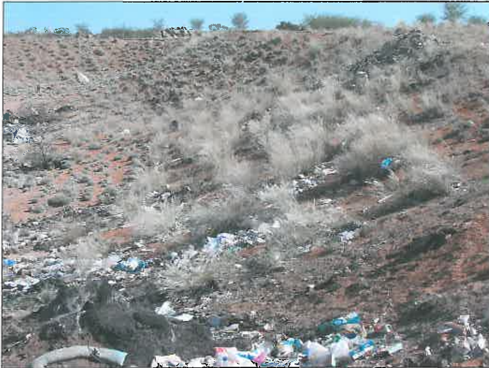
Fig.4 Borrow pit to be developed as waste disposal site at Curries Camp.