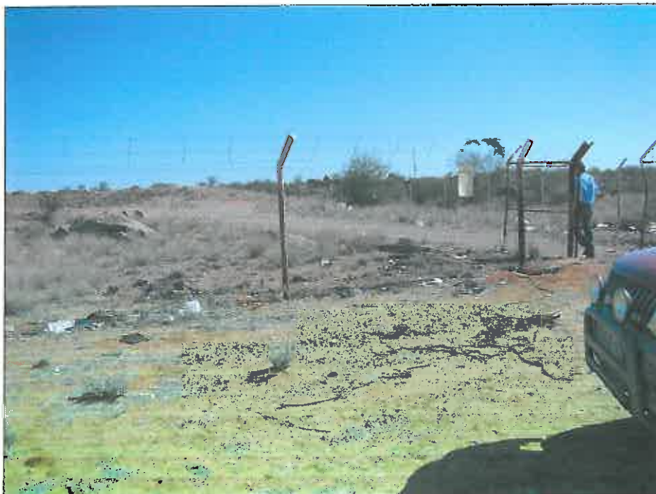
Fig.3 Waste disposal site at Curries Camp near Keimoes, Northern Cape.