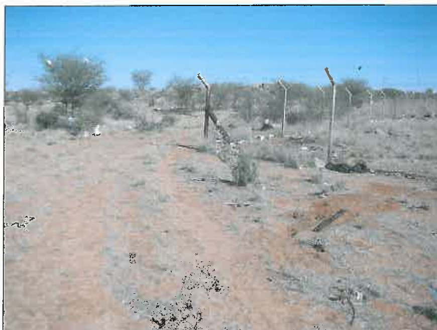
Fig.1 Waste disposal site at Curries Camp near Keimoes, Northern Cape.