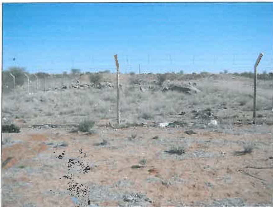
Fig.2 Waste disposal site at Curries Camp near Keimoes.