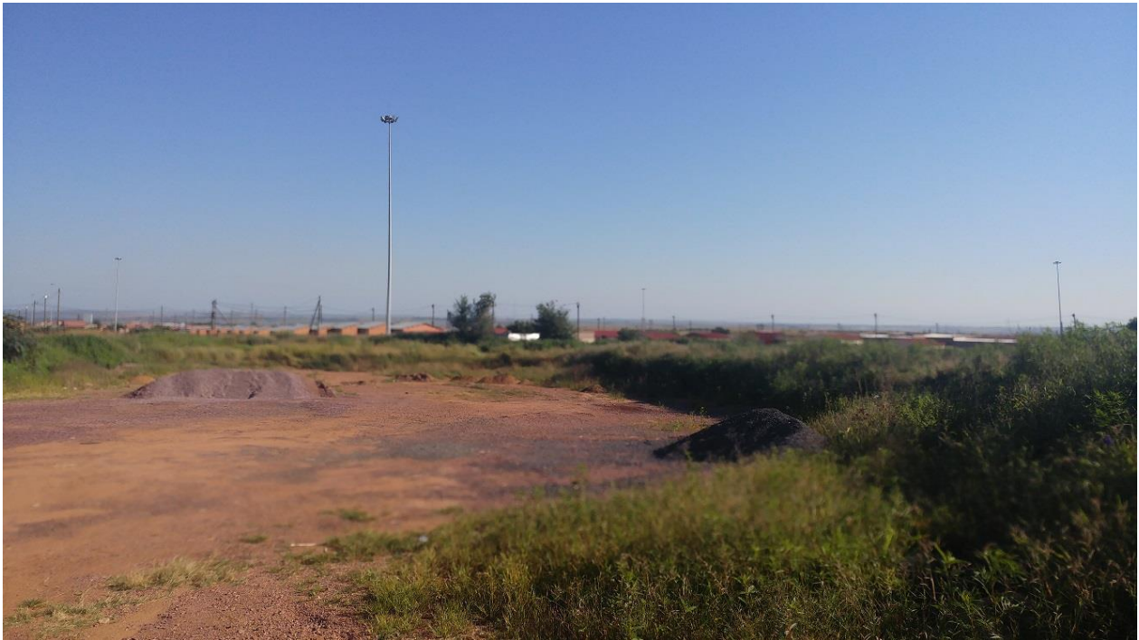
Figure 6: General view of vegetation and borrow pit on site.