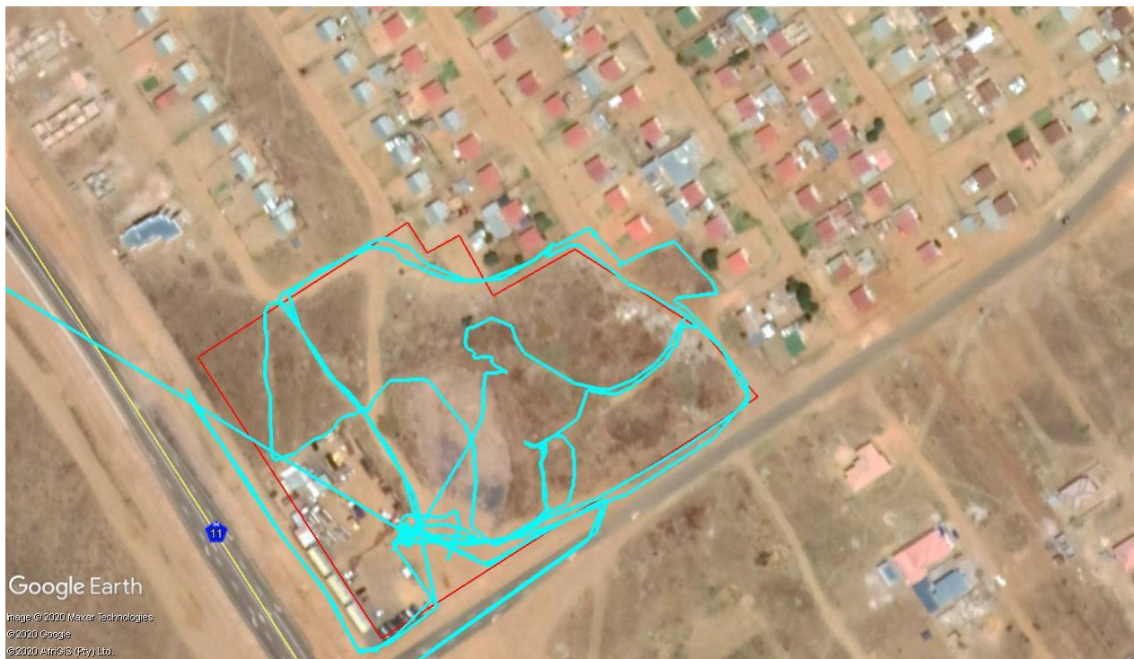
Figure 4: Track route of the survey.

The site was visited on 26 February 2020 and almost the entire area was found to be disturbed (Figure 4-8). The exception is construction camp and pit in the southern corner of the site. The site is populated with tall grass and disturbance is evident in the weeds and other pioneer plant species growing on site. There is illegal dumping on the eastern side.