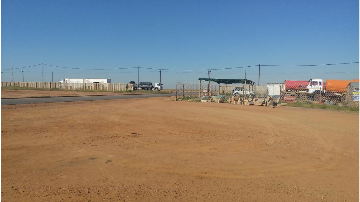
Figure 7: Construction camp in surveyed area