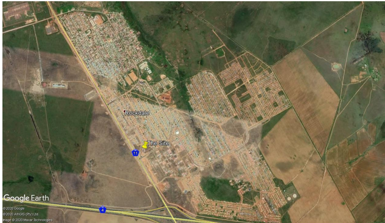
Figure 2: Location of the site within Rockdale.