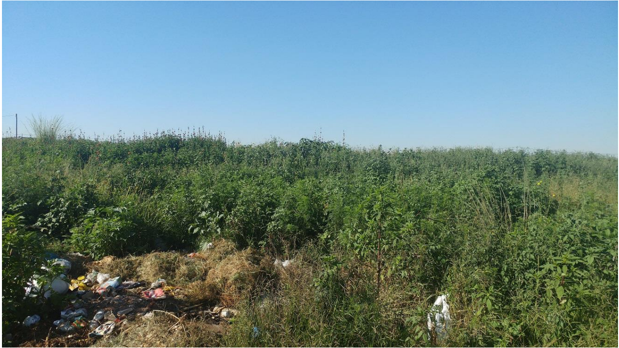
Figure 8: View of illegal dumping and pioneer vegetation in the surveyed area.