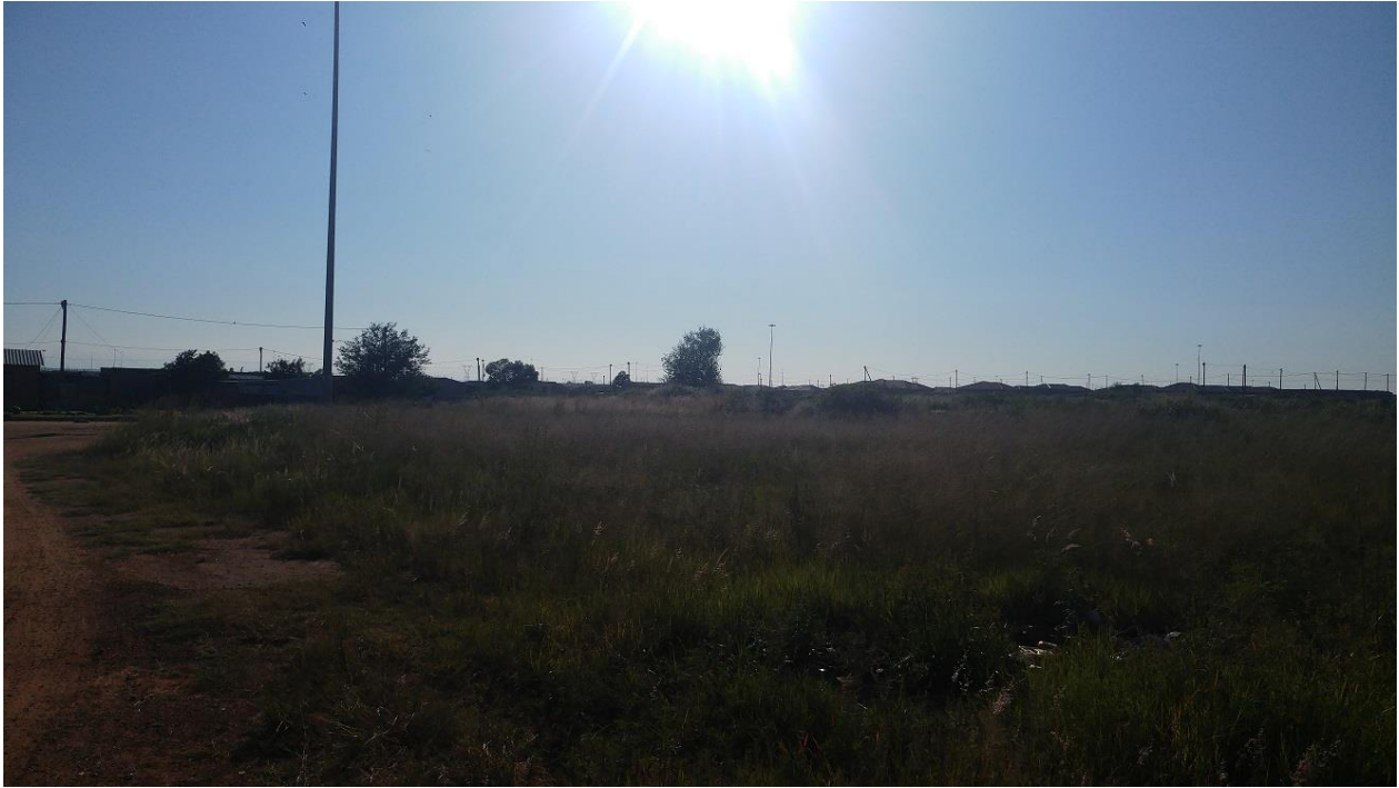
Figure 5: General view of vegetation