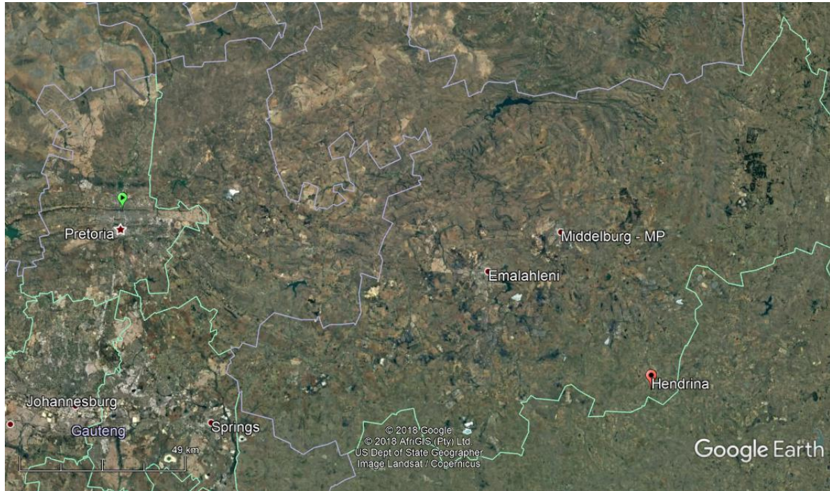
Figure 1: Location of Hendrinain the Mpumalanga Province.