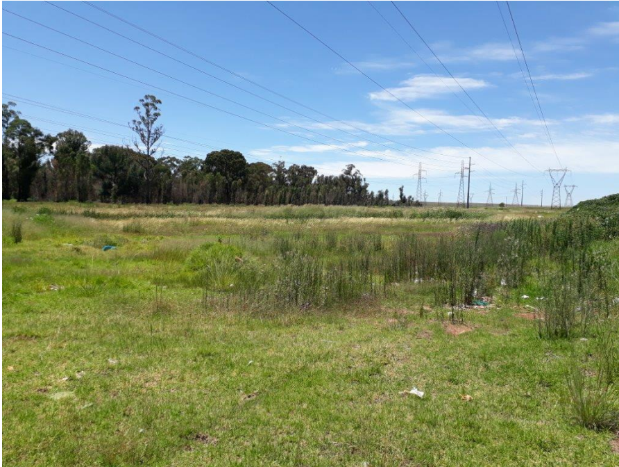
Figure 6: Pioneer plant species and regrowth on site.