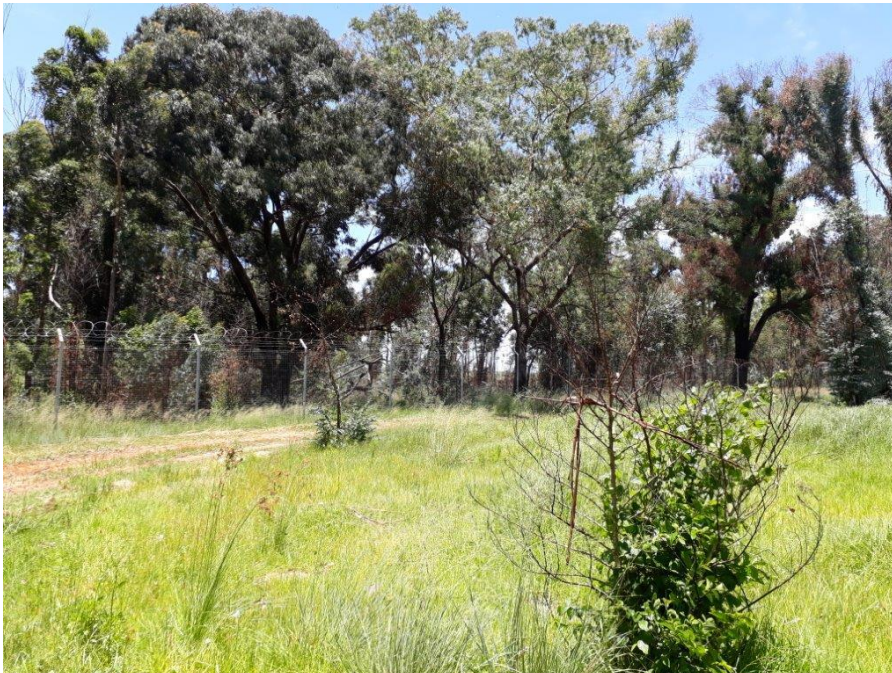
Figure 7: Alien trees on site.