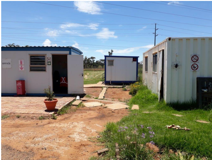
Figure 5: Temporary structures on site.