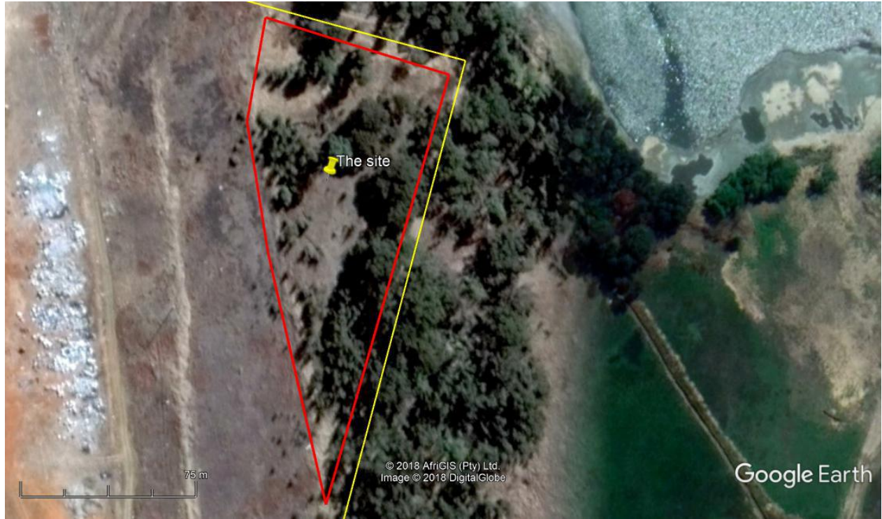
Figure 4: Detailed view of the proposed dam site.