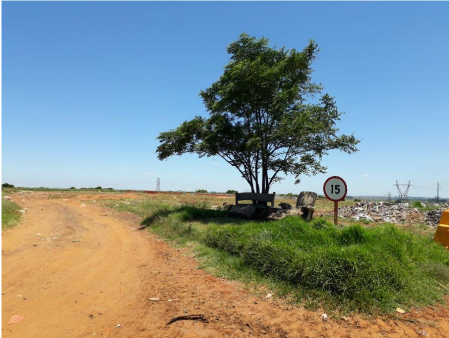
Figure 8: Visible dumping on site.

It is therefore believed that a Heritage Impact Assessment (HIA) is not needed for this project. This letter serves as an exemption request to the relevant heritage authority.