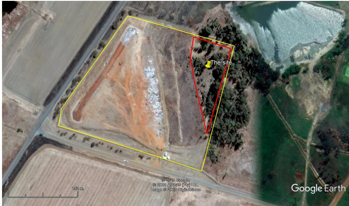
Figure 3: Waste disposal site (yellow) and proposed dam site (red).