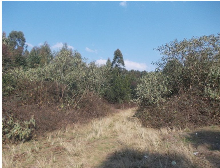
Fig 1. General view of proposed development area

The area can be described as disturbed, the area is under bluegum, which will be felled and formally replanted. The development will cover 18 ha. Natural vegetation in the area consists of predominantly sour grassland of According to Mucina and Rutherford (2006), the area falls into a Ngongoni Veld zone (Mucina & Rutherford 2006). The geology underlying the study area comprises sediments from the Karoo Supergroup including significant Dwyka tillites and intrusive Karoo dolerites. No rocky outcrops were noted on site. General GPS co-ordinate: S30° 22' 49.9" E29° 57' 16.8"