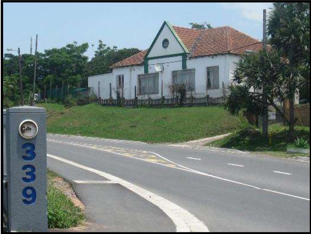
Figure 7. Historical buildings are located to the immediate south of the footprint. However, these are located more than 100m from the proposed development and they are not threatened.