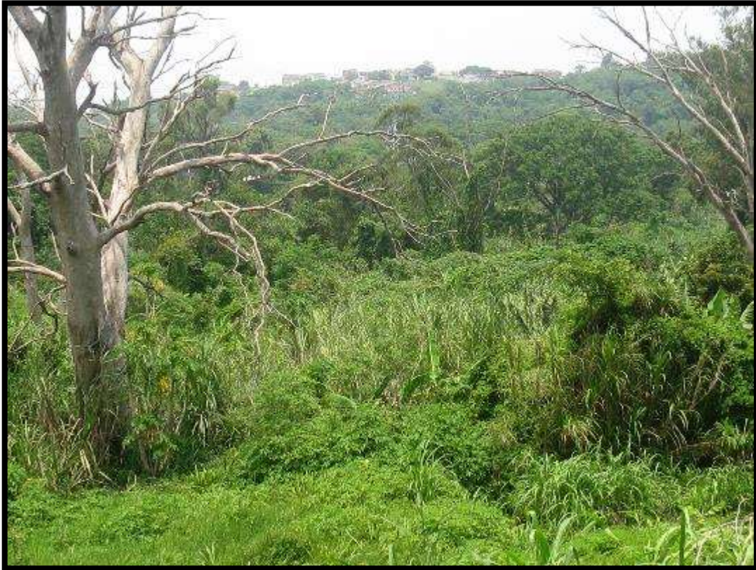
Figure 5. Dense vegetation in Block E compromised heritage site visibility.