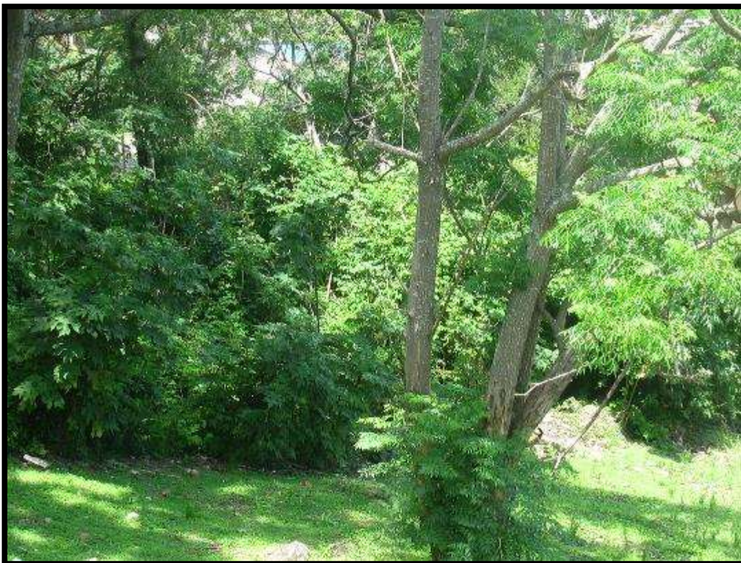
Figure 6. Block F