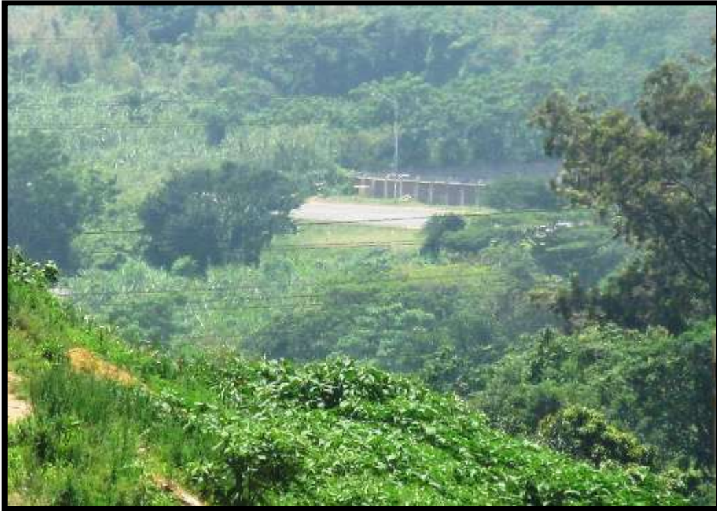
Figure 3. View over Block D.