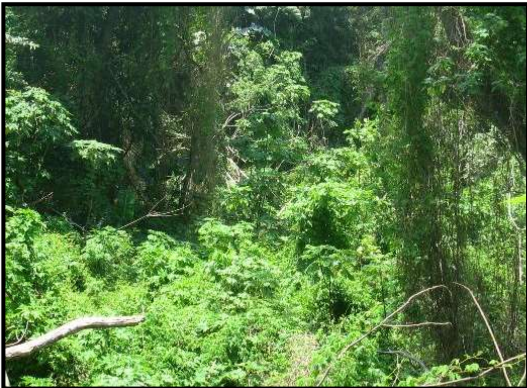
Figure 4. Dense vegetation in Block C compromised heritage site visibility.