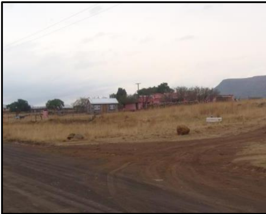
Figure 4. Although Zulu homesteads occur in the greater project area there are no associated graves on the footprint.