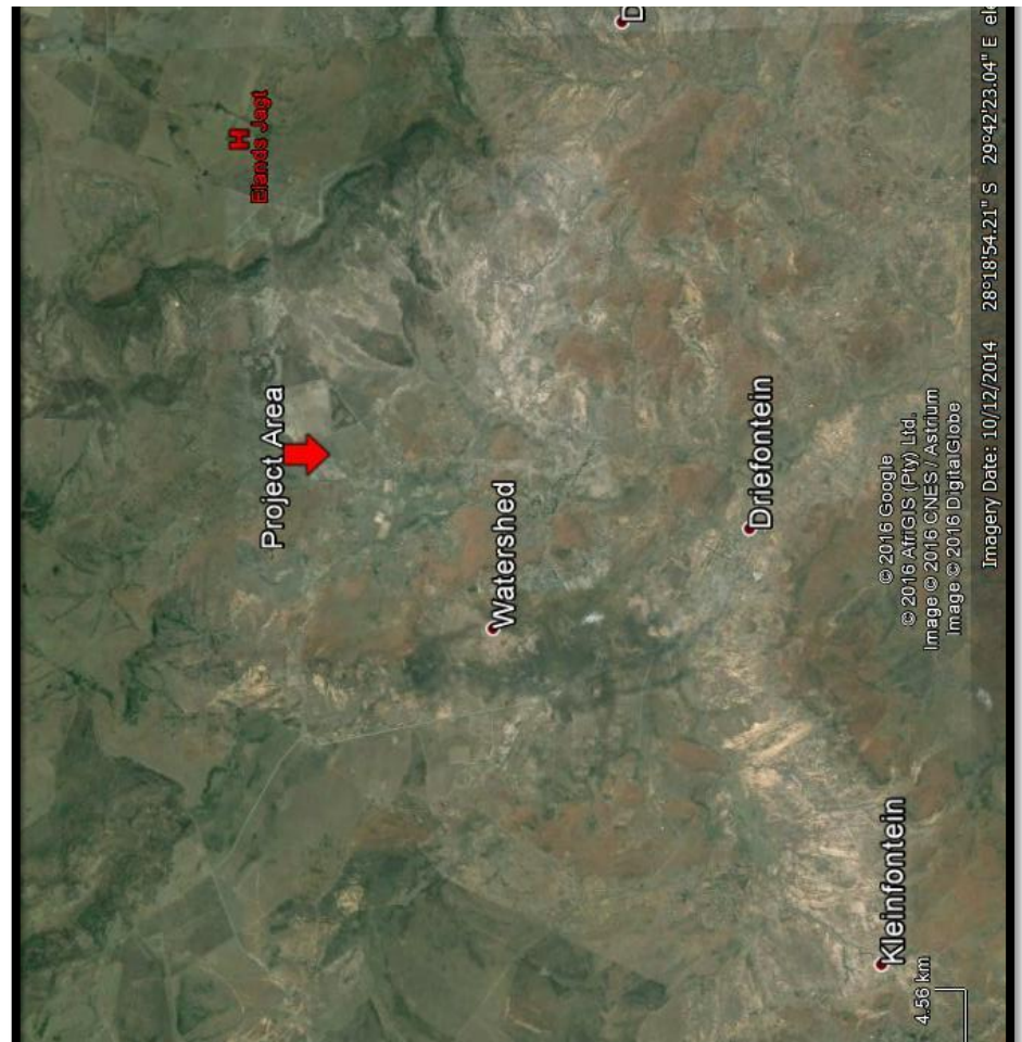
Figure 1. Google aerial photograph showing the location of the project area.