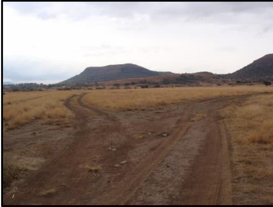
Figure 3. View of Bhatha Road, earmarked for upgrading. No heritage sites occur on the footprint.