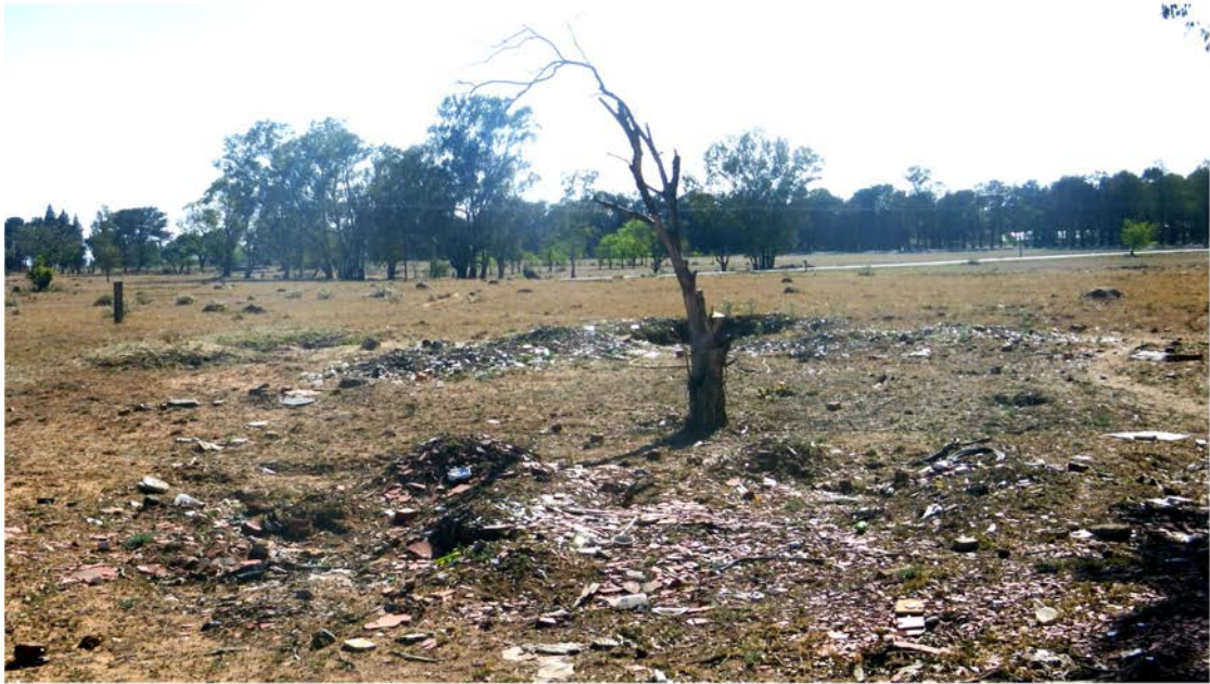
Figure 3. General view of Plot 146, looking east (top) and north (below).