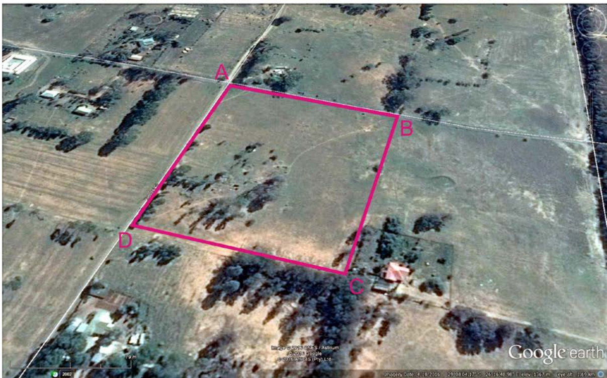
Figure 2. Aerial view of Plot 146.