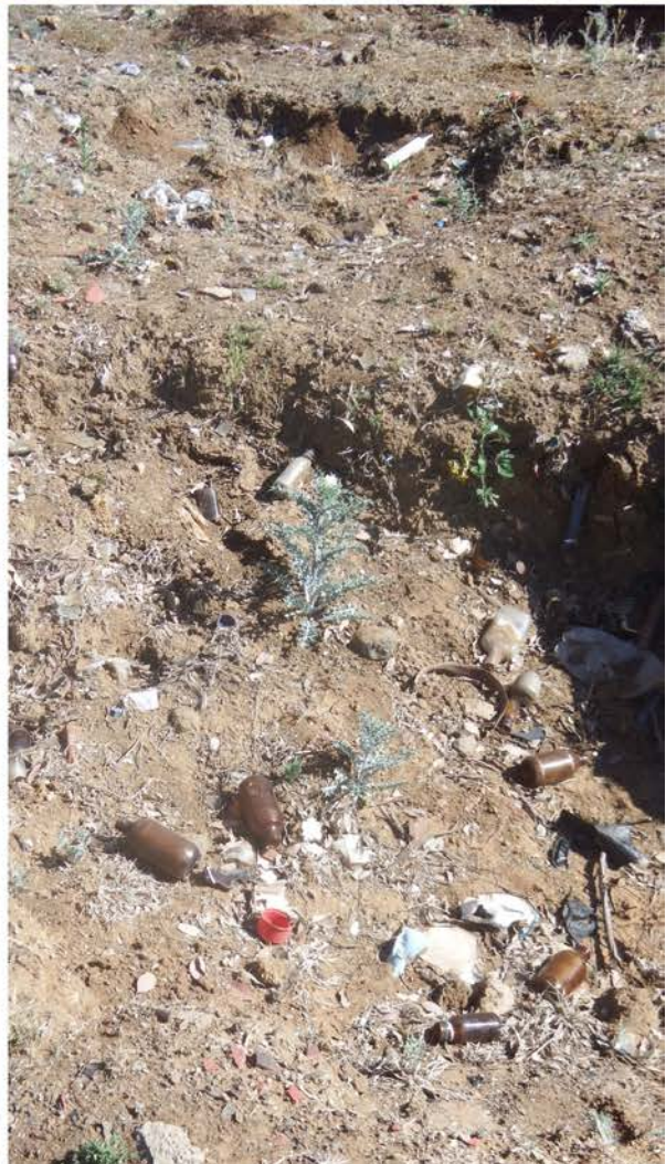
Figure 4. Plot 146, looking southeast and east at the ruins of the original buildings (top & below left) and rubbish dump (below right).