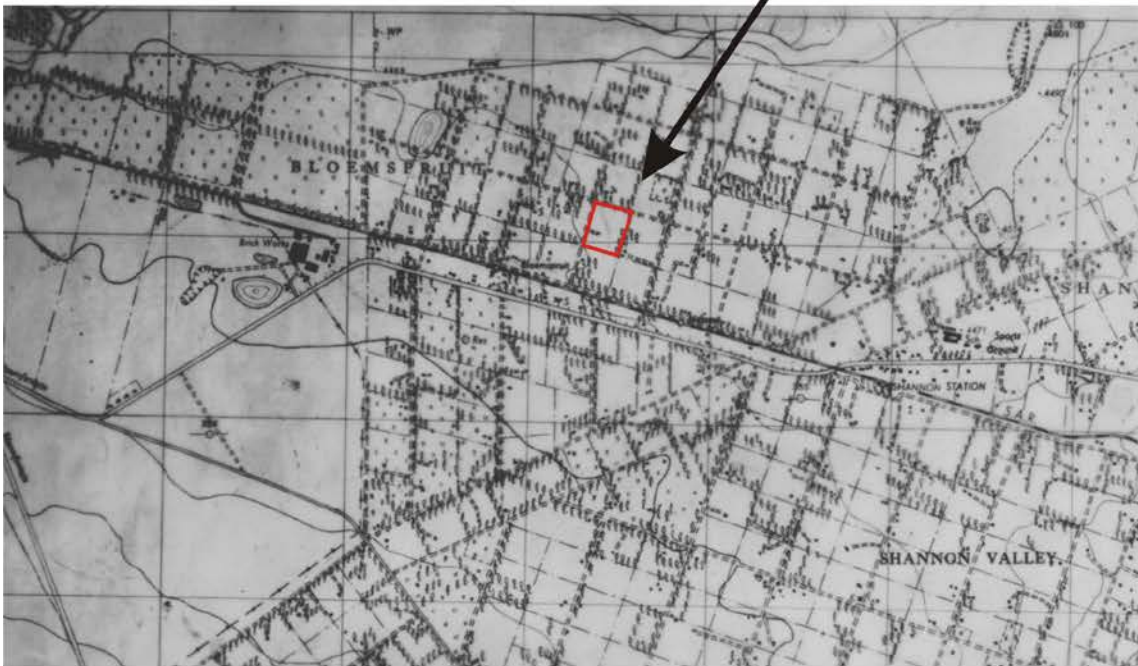
Figure 1. Plot 146, Bloemspruit, Bloemfontein (portion of 1:50 000 scale topographic map 2926 AB Maselspoort, circa 1992 above and portion of 1:18 000 scale topographic map 2926 C3 Maselspoort, circa 1941 below).