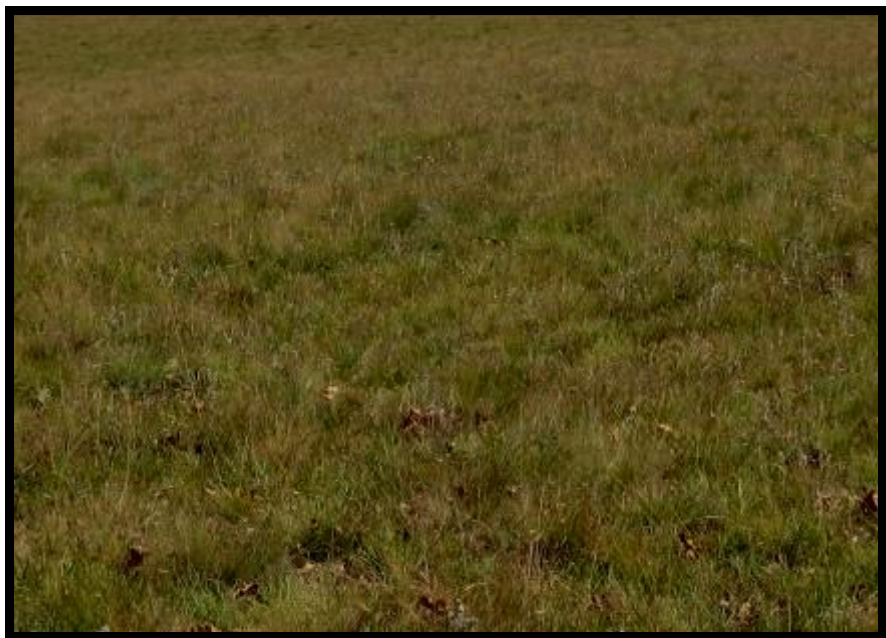
Figure 4. Photograph of the footprint. No heritage sites occur on the plot.