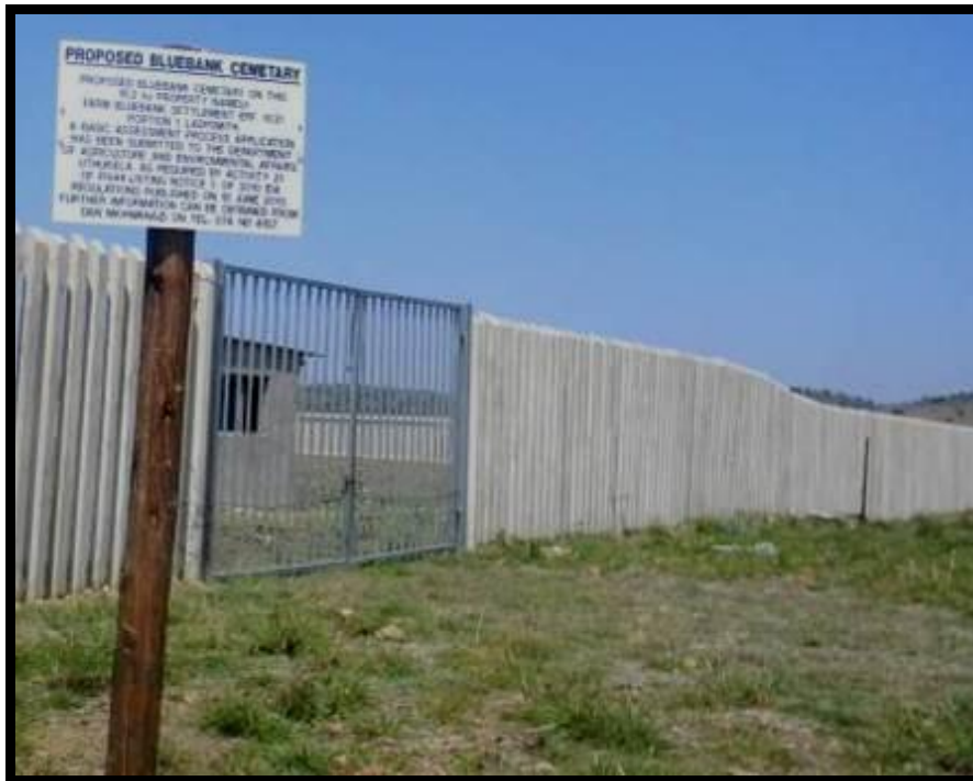
Figure 3. Photograph showing the entrance to the proposed Bluebank Cemetery