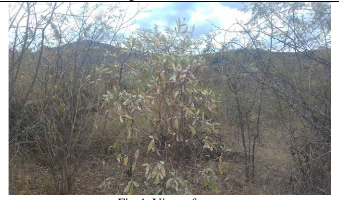
Fig 4. View of area