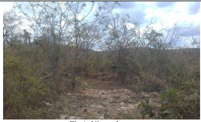
Fig 1. View of area