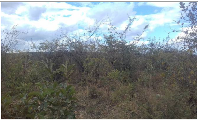
Fig 2. View of area