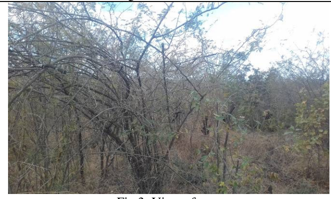
Fig 3: View of area