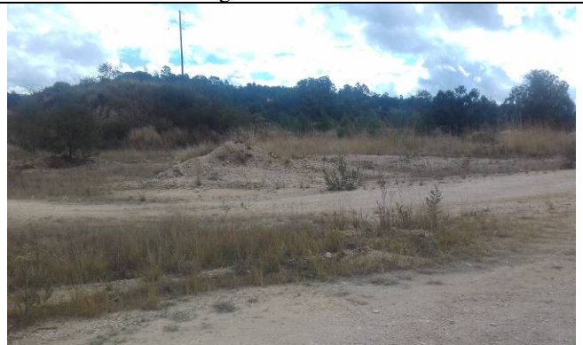
Fig 4. View of area