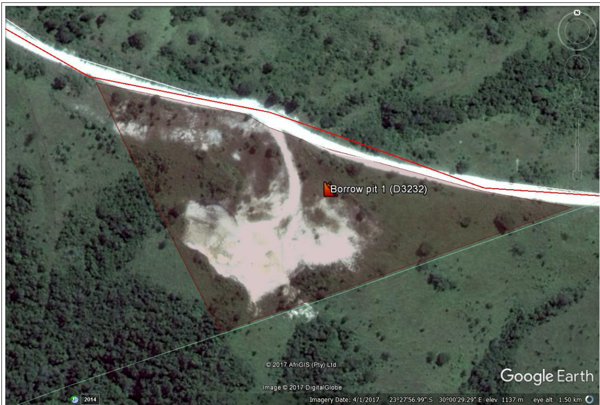
Map 1: Google map close up view