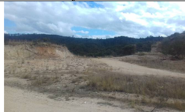
Fig 3: View of area