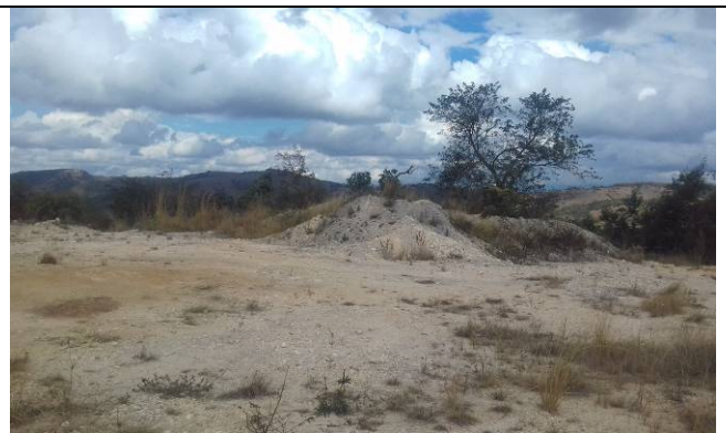
Fig 2. View of area