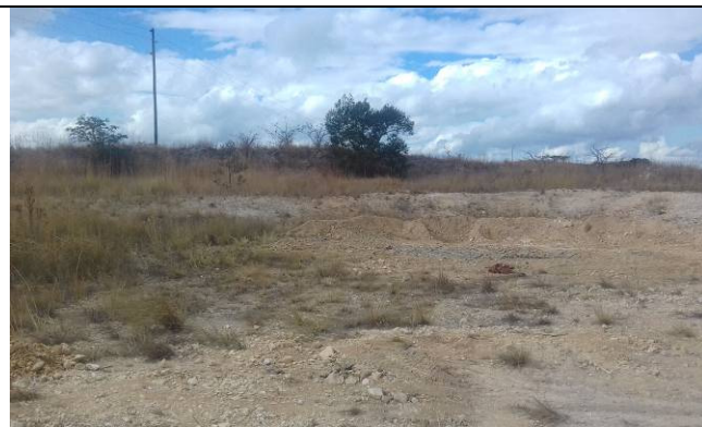
Fig 1. View of area

Proposed development: To extend an existing borrow pit, for road upgrading