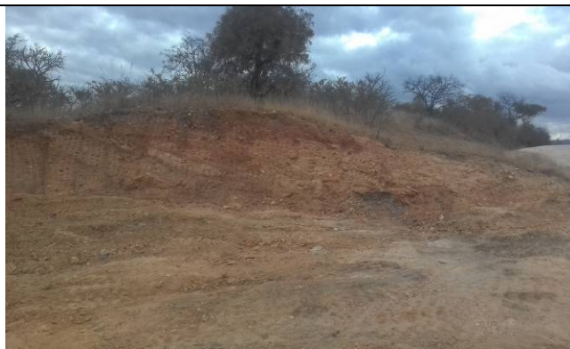
Fig 1. View of area

Proposed development: To extend an existing borrow pit