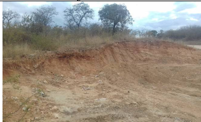
Fig 3: View of area