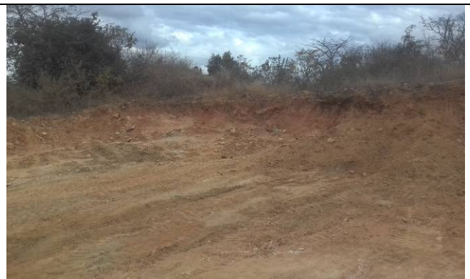
Fig 2. View of area