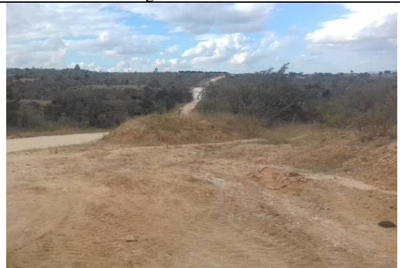
Fig 4. View of area