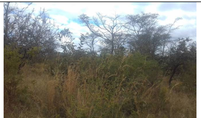
Fig 2. View of area