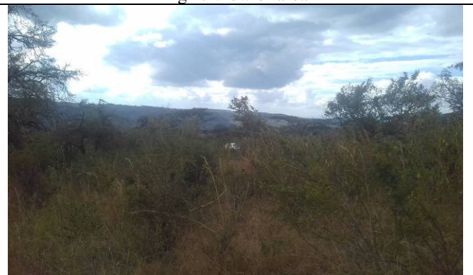
Fig 4. View of area