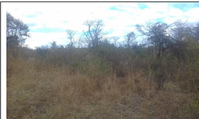
Fig 1. View of area

Proposed development: To develop a new borrow pit for material extraction