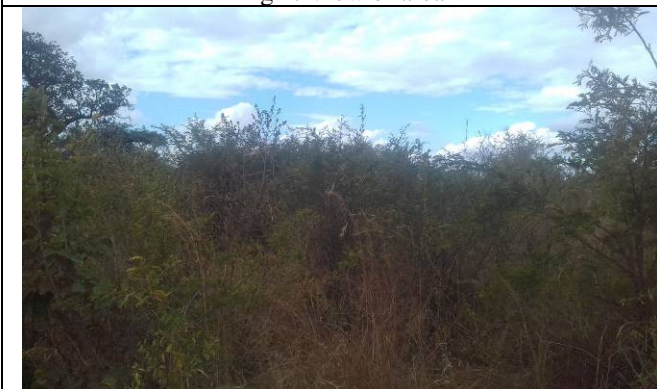
Fig 3: View of area