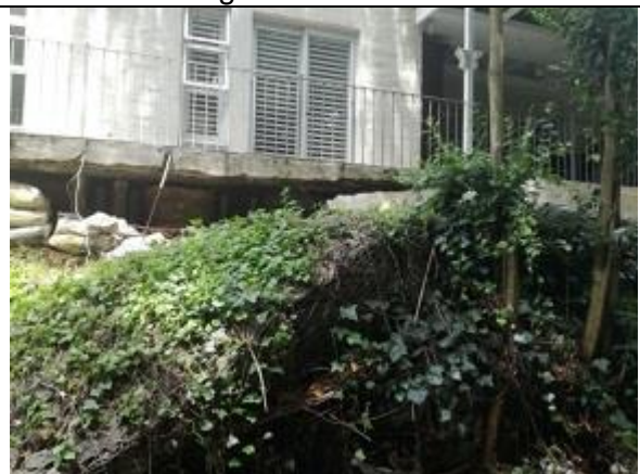
Fig 6: View of area