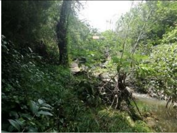
Fig 1: View of area

Proposed development: To upgrade and rehabilitate the gabion used as a storm water drainage system.