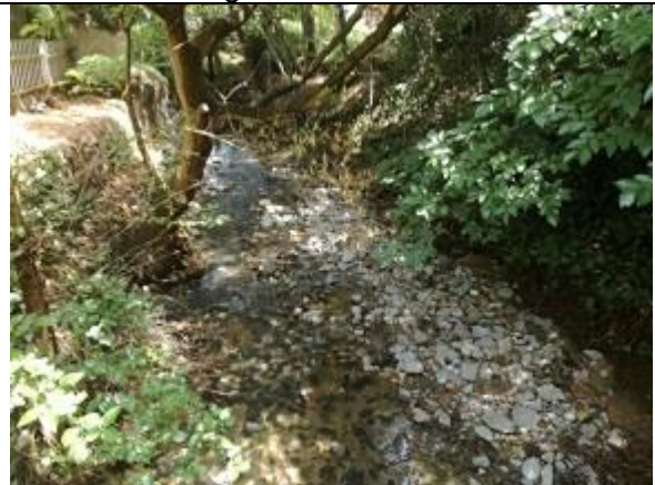
Fig 4: View of area