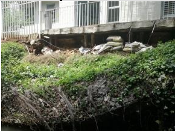
Fig 3: View of area