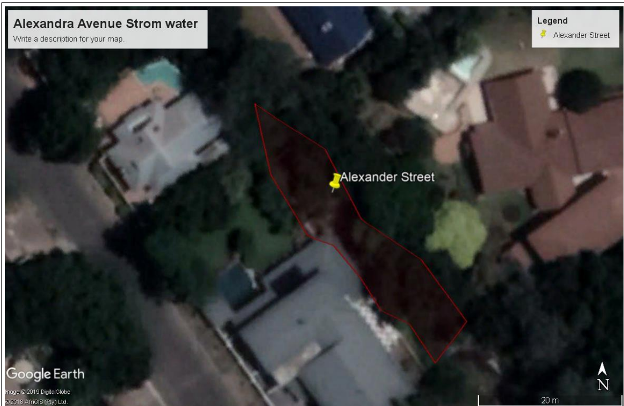
Map 2: Google map close view of proposed area