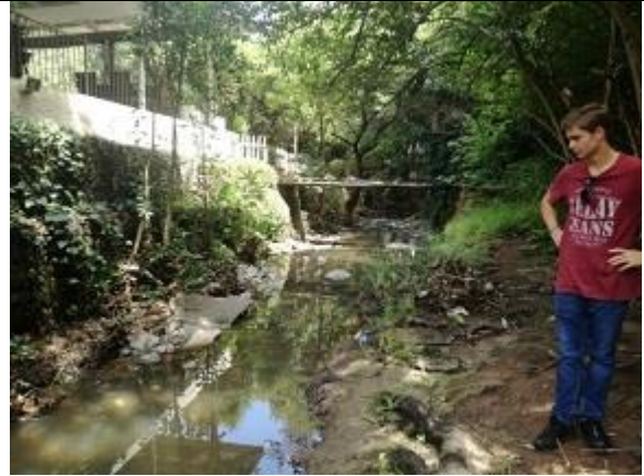
Fig 2: View of area