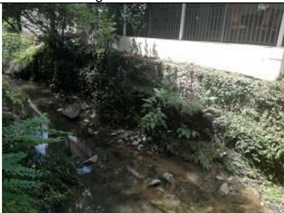
Fig 5: View of area