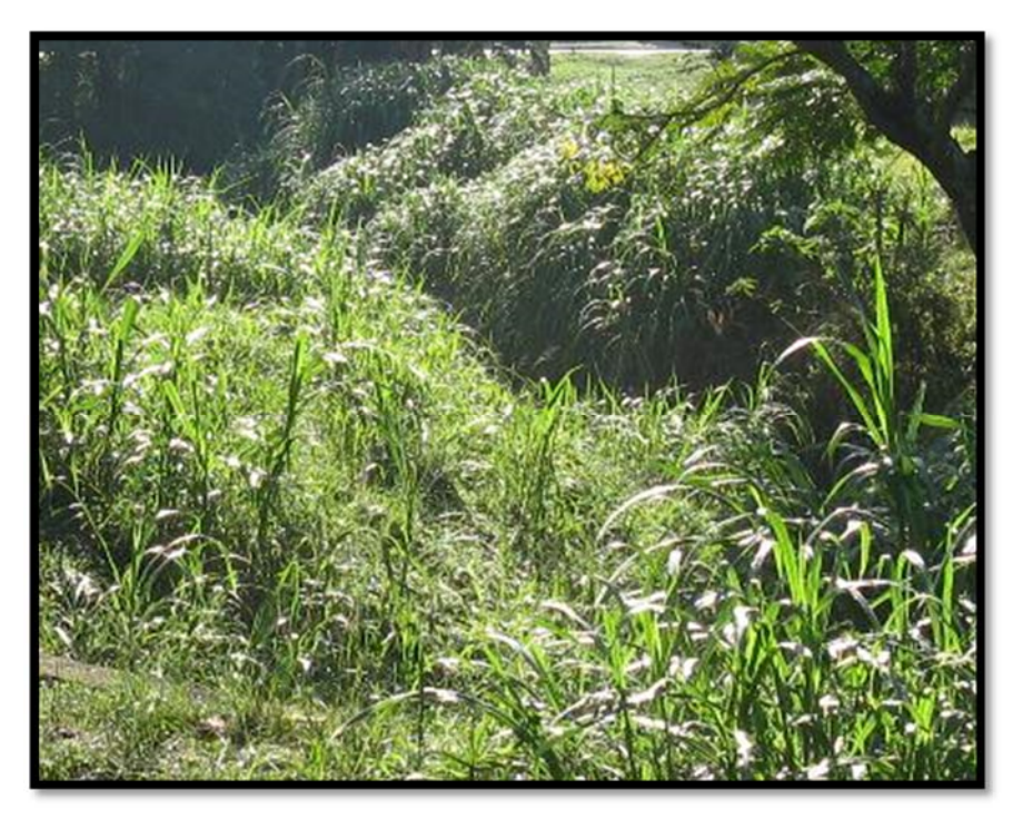
Figure 2. Approximate locality of the proposed Burbreeze Pedestrian Bridge