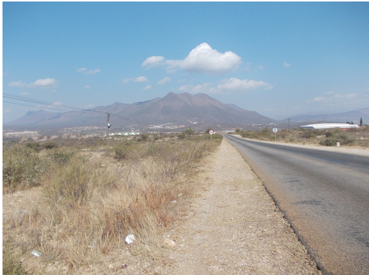
Fig 1. View of development area