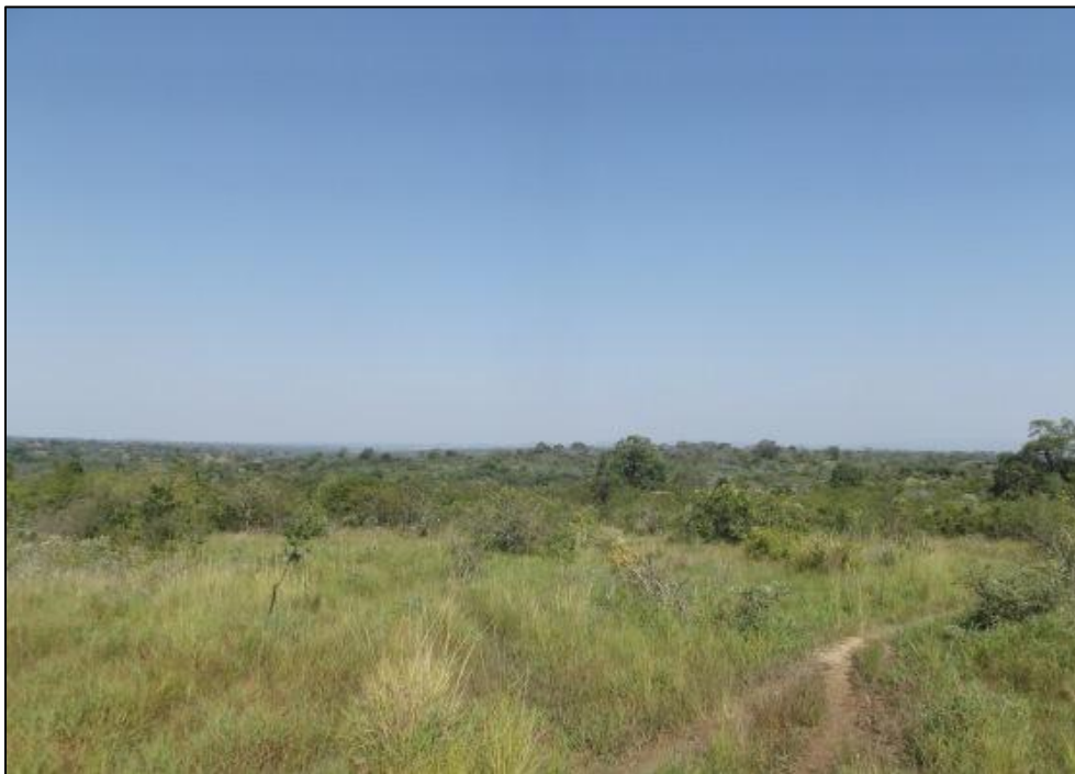
Fig. 2. A general view towards the South East at Burlington.