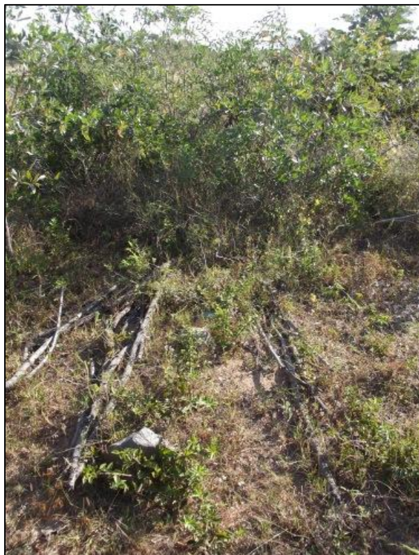
Fig. 4. Site BB 1. Sticks define the grave area and the rock at the bottom of picture is headstone facing west.