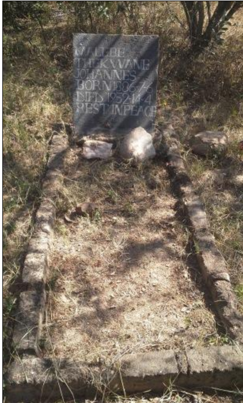
Fig. 8. Site BB 3. The grave of Johannes Malebe Thekwane who died on 14 April 1952.