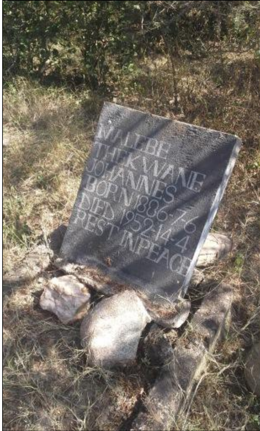
Fig. 7. Site BB 3. This grave is 62 years old and therefore heritage.