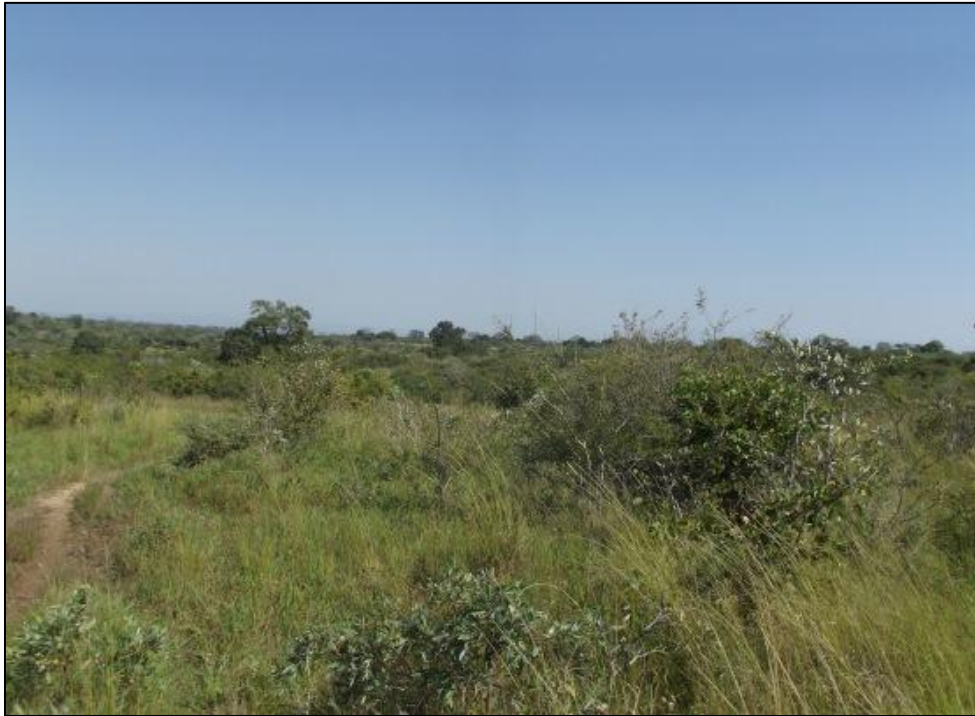
Fig. 1. General view of the surveyed area at Burlington in Southern direction.