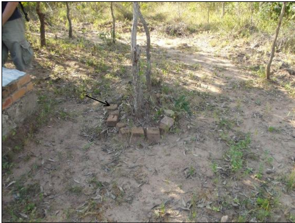
Fig. 6. Site BB 2. This is a old unmarked grave, possibly of a child or infant, the arrow indicate the stones which mark the edges of the grave.