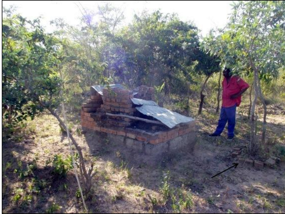
Fig. 5. Site BB 2. The main brick structure is the grave of Mbazima Mtotondza shown by the informant, Mr Anton Ndlovu. The arrow indicates a second unmarked grave.