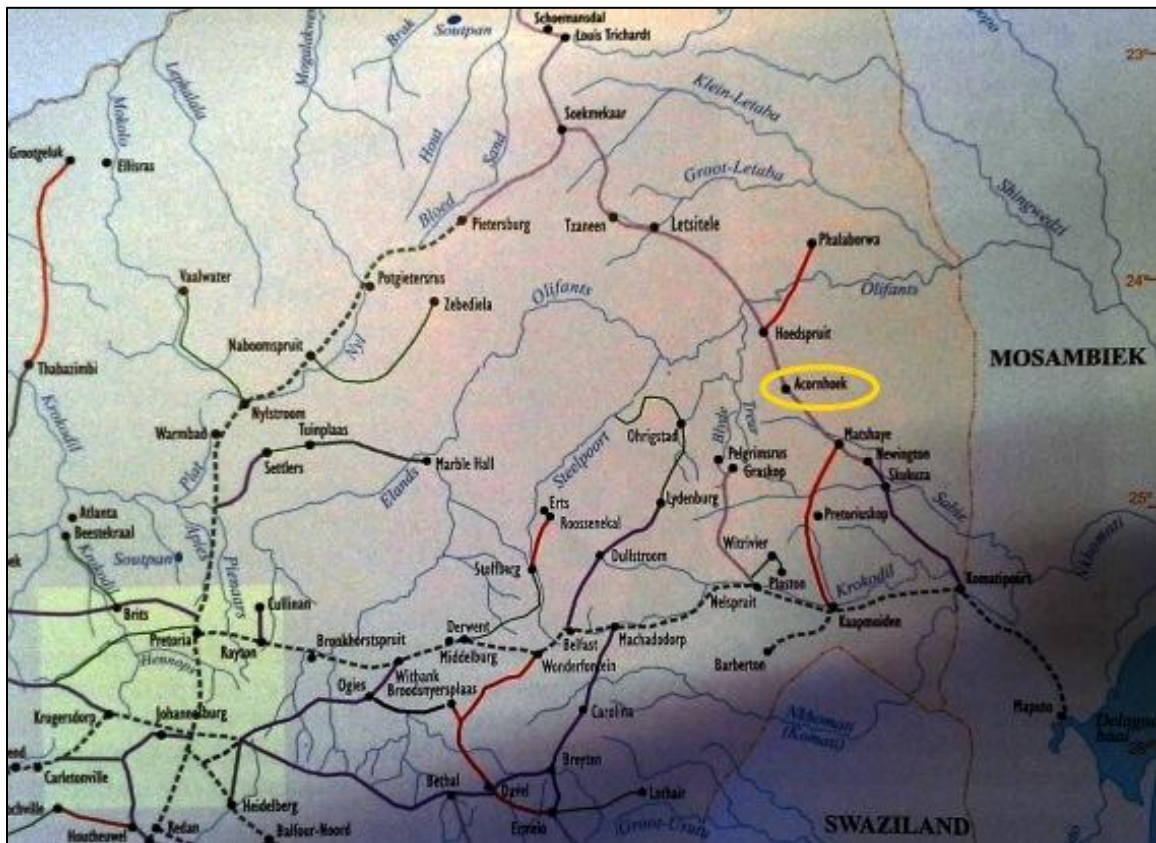
Fig. 4.1. Railway development in the Transvaal between 1889 – 1980 (Bergh, 1999: 79).

Railway expansion continued up until the Anglo-Boer War (1899-1902) and thereafter (Bergh, 1999). After the establishment of the Union of South Africa on 31 May 1910 the Transvaal had the most railway track in terms of distance. Some 2 730km of railway connected the economic centres of this province. Railways made a huge contribution towards economic development especially in the Witwatersrand area where it served as important platform for mining and industrial development (Bergh, 1999).