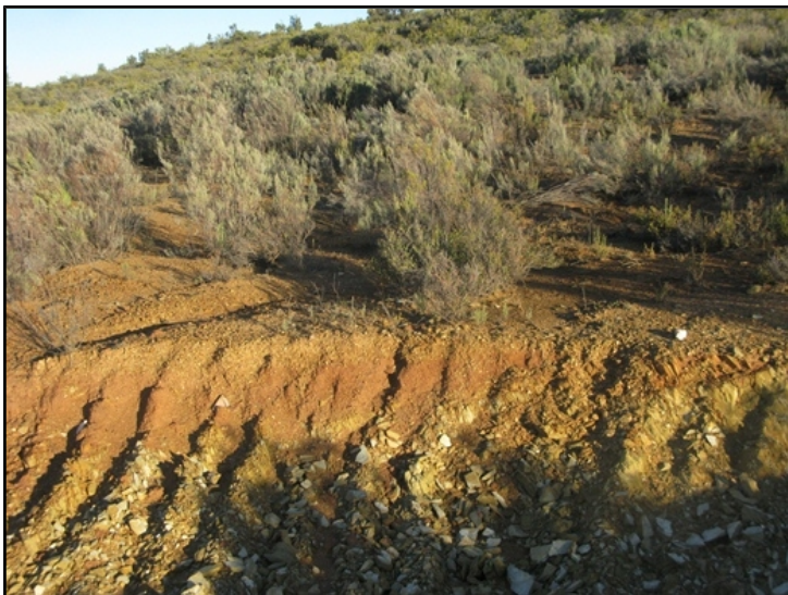
Figure 2: Deposits with fine surface gravels mantling the Bokkeveld Group mudrocks along the southern edge of the pit (Almond 2012: 5)