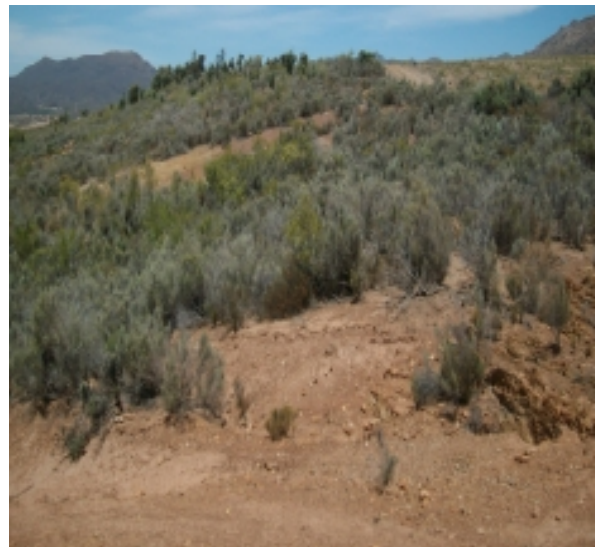
Figure 3: Overview from a south easterly direction (July, 2011)