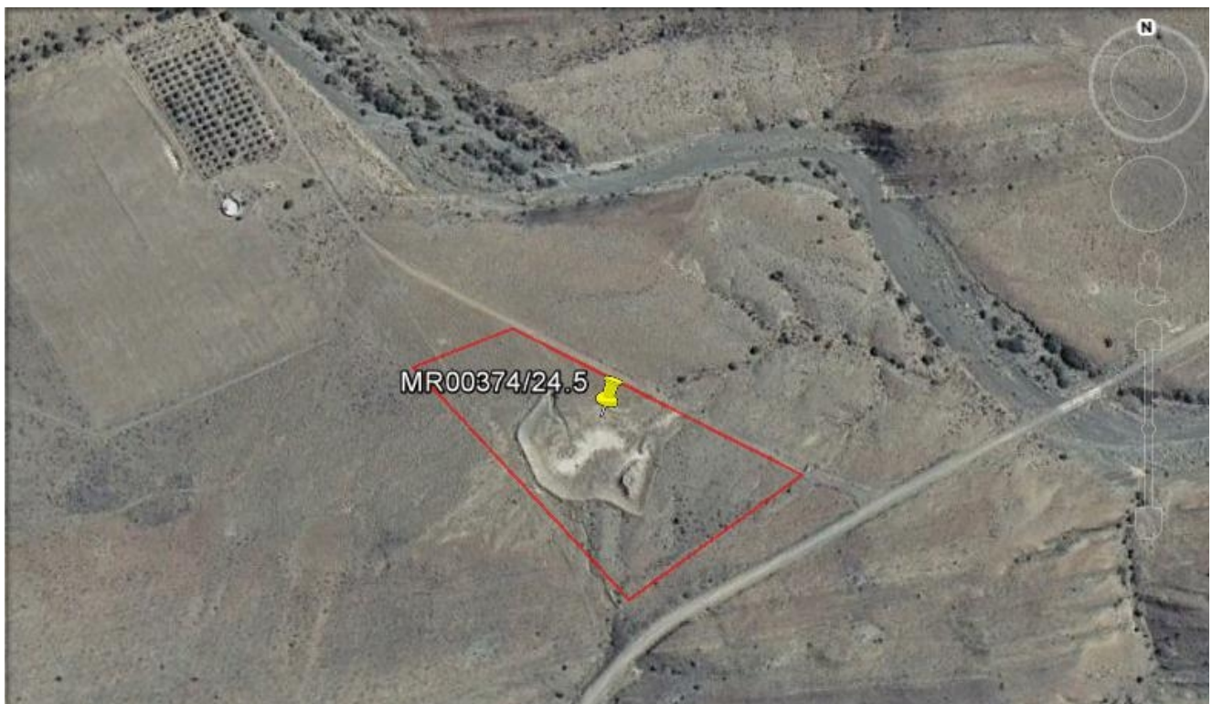
Figure 4: Aerial view of existing borrow pit (Google earth image, June 2012) 3