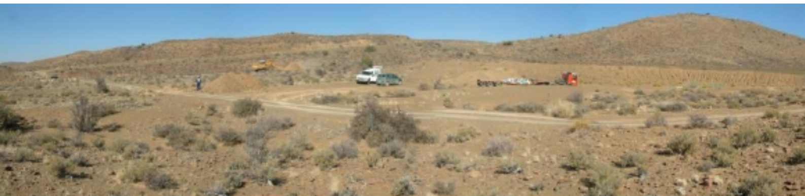
Figure 2: Panorama of entire pit area (2011)