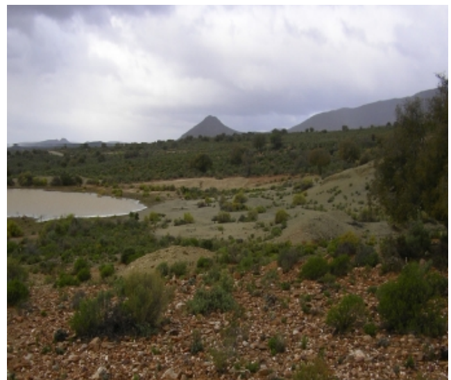
Figure 2: View towards southeast across the existing pit (Almond 2012: 4)