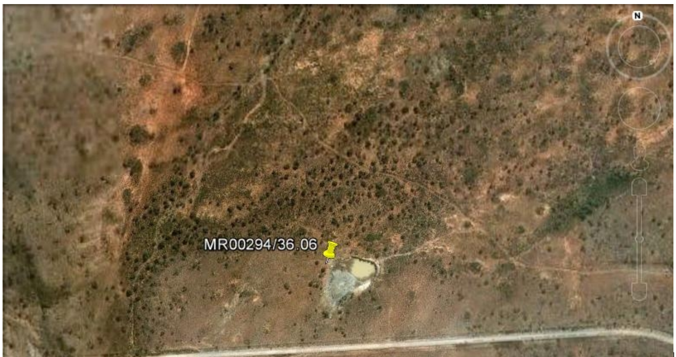
Figure 5: Aerial view of existing borrow pit