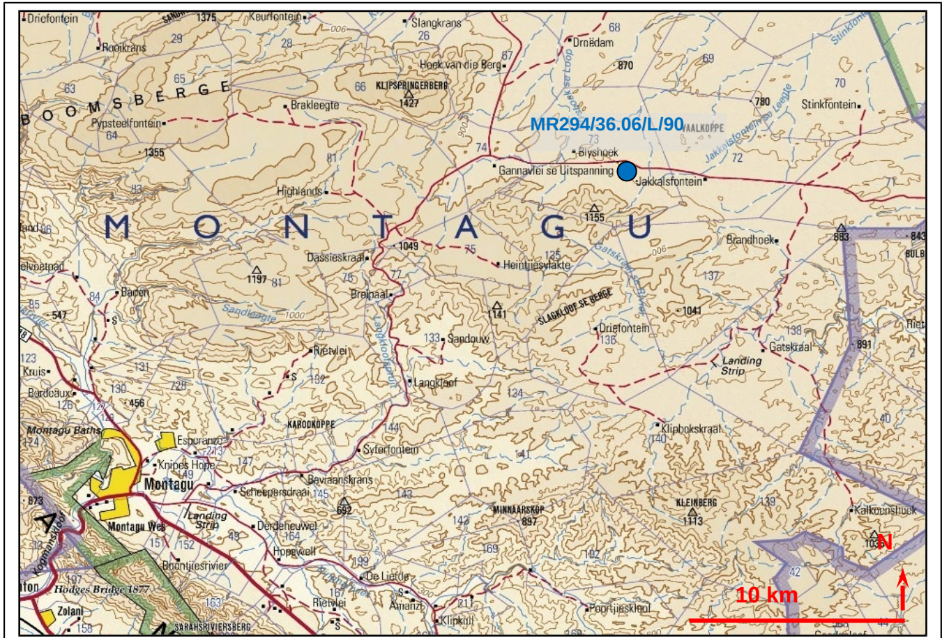
Figure 1: Extract from topographical sheet 3320 Ladismith (extracted Almond 2012: 2)

Proposal is for an extension of an existing borrow pit (proposed new borrow pit adjacent to an existing pit) pit along the unsealed road MR00294 in the Montagu District, Western Cape. Pit MR00294/36.06/L/90. Entrance to the site is via a private gravel road passing through the farm Bylshoek. Indigenous shrubs (fynbos) is found across most of the site. Apart from the dam that is used by the farmer, the land is not utilized for any specific purpose. The shale gravel is suitable for use as wearing course gravel (Aurecon geological strategic gravel pit summary report. ) Farm Bylshoek No. 73 is in private ownership of Blue Chameleon Inv Number 40 (Pty) Ltd. Borrow pit co-ordinates are 33° 39' 09.1" S, 20° 21' 39.7" E