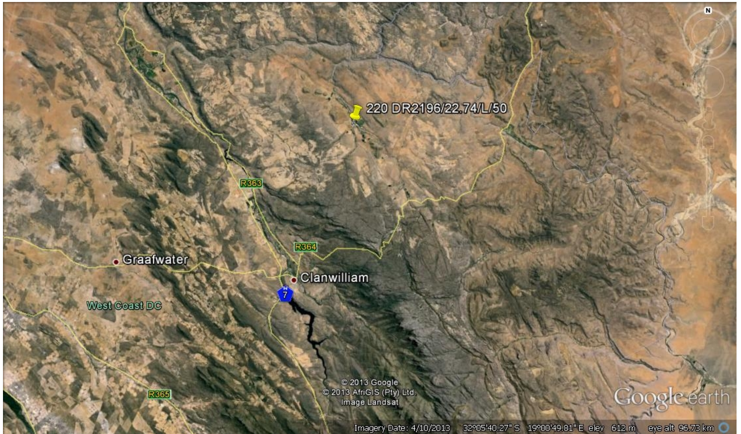
Figure 1: Locality plan (Google earth image, June 2013)

It is proposed to expand an existing borrow pit at DR2196/22.74/L/50 accessed from the R364 north east of Clanwilliam in the West Coast District Municipality, Western Cape. The proposed extension lies within the context of agricultural land 400m west of the Brandewyn River and approximately 10 km south of the Doring River. Numerous alien Proposis sp trees are located within the existing borrow pit and the area surrounding the existing borrow pit is vegetated by fynbos. The site lies on the Portion 1 of farm No 643, in private ownership of Mr Tertius van Wyk and borrow pit coordinates are 31° 58' 01.12" S 18° 59' 07.67"E