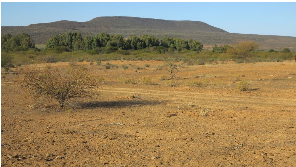
Figure 2: View across the proposed extension towards the east (Tusenius 2013: 7)