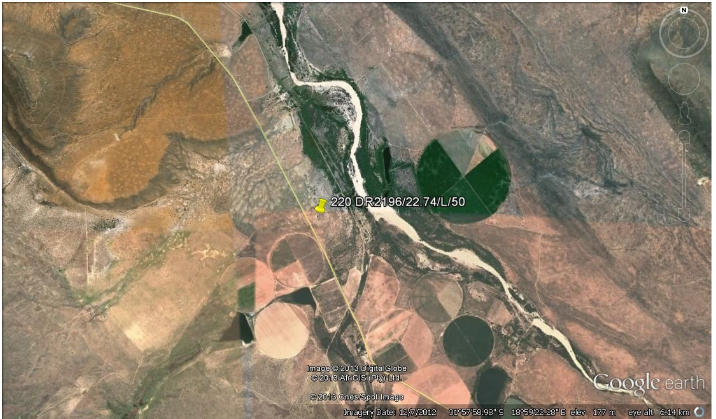
Figure 3: Aerial view of existing borrow pit location (Google earth image, June 2013)