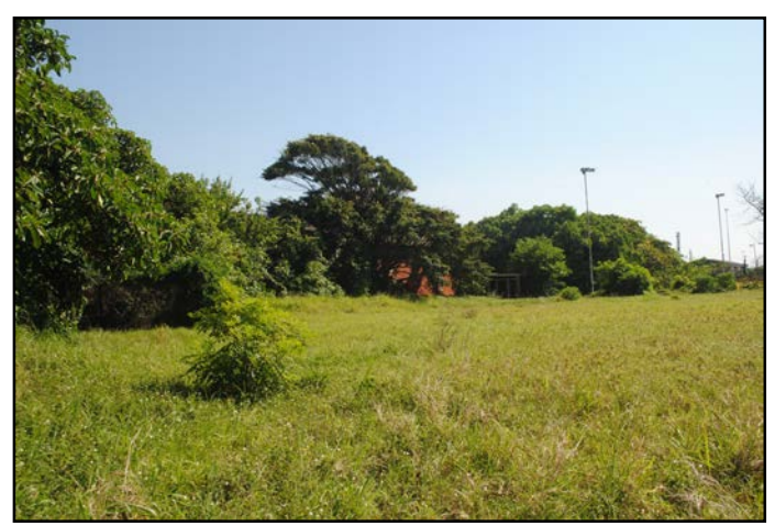
Figure 2: General area where oral tradition states there may be a grave. This field is in the vicinity of Building 13

As the issue of human remains is sensitive and subject to the legislation cited above, it is imperative that contractors be made aware of this. If human remains are uncovered, the site will have to be assessed, the relevant authorities notified and the correct processes followed in order to relocate the grave.