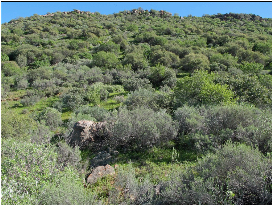
Figure 4: View of the affected area at the base of the steep south-east facing slope. The rocky outcrops at the crest of the ridge lie outside the area. Patches of dense shrubs and grass are visible, as well as the large sandstone boulder examined for rock art.