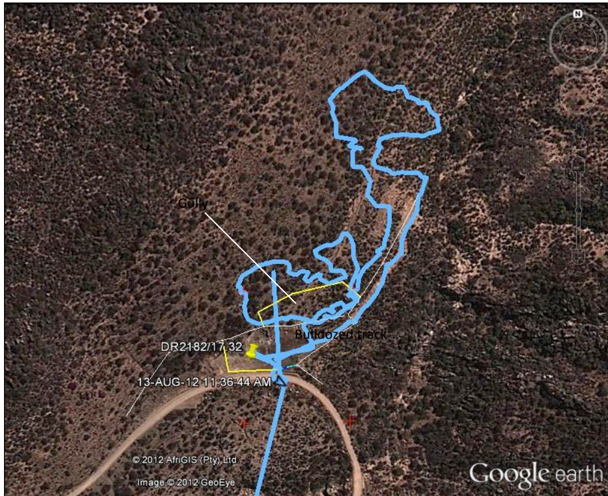
Figure 2: Google earth image showing the proposed extension of the existing borrow pit 106 and the tracks recorded during the field survey. The yellow lines mark most of the outer boundaries of the proposed extension according to the site plans. Please note that the straight blue lines do not indicate survey tracks and that the vegetation on the ground in winter is thicker than it appears in this image.

amongst the general scatter of isolated shrubs (Figures 3, 4, 6). The recent rains resulted in a luxuriant growth of grass, weeds and bulbs in some parts of the proposed extension which also affected archaeological visibility.