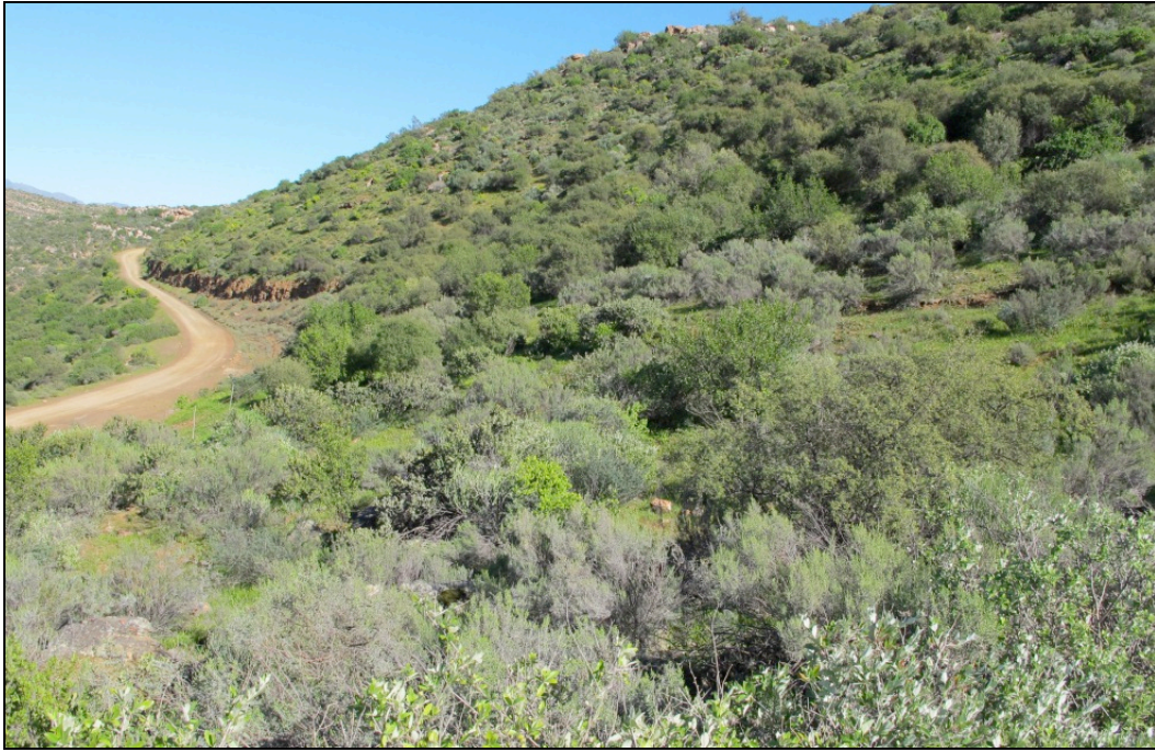
Figure 3: View towards the west of the existing roadside-cutting borrow pit and the proposed extension in the foreground. The photo was taken from the bulldozed track which forms the south-eastern boundary of the affected area.