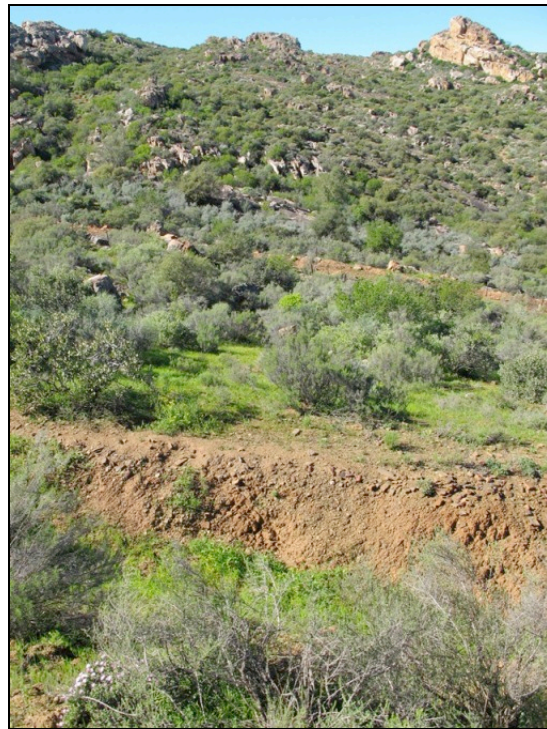
Figures 5 and 6: View of rocky outcrop, probably with rock art, towards the south-east of the affected area; closer view of the proposed extension area lying between the gully in the foreground and the bulldozed track in the middle ground of the photo.

Results of the survey: No archaeological remains were observed within the affected area. One large sandstone boulder with potential surfaces for rock paintings was examined (Figure 4) but none was noted. One likely-looking piece of quartzite found outside the polygon was naturally fractured - there were no artefactual flake scars.