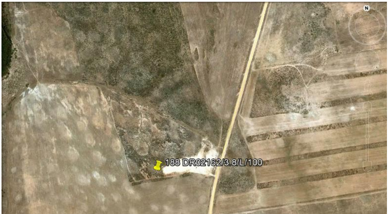
Figure 4: Aerial view of existing borrow pit and expropriation area (Google earth image, October 2012)