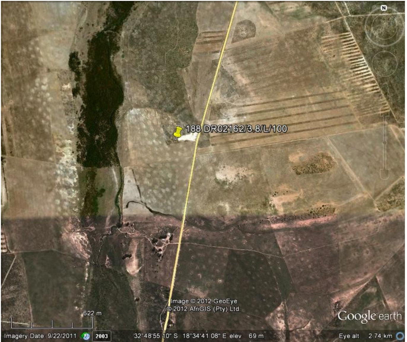
Figure 3: Aerial view of existing borrow pit location (Google earth image, October 2012)