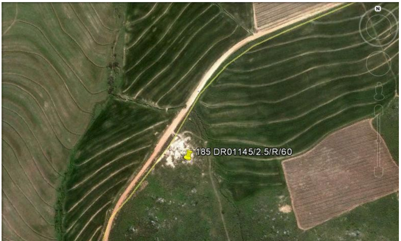
Figure 4: Aerial view of existing borrow pit (October 2012)