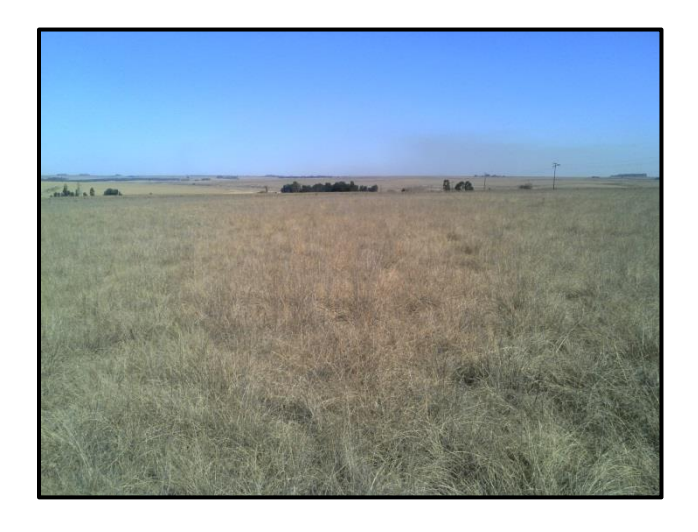
Figure 6. Southern Section of study area.