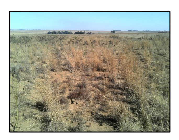
Figure 7. Eastern section of study area.