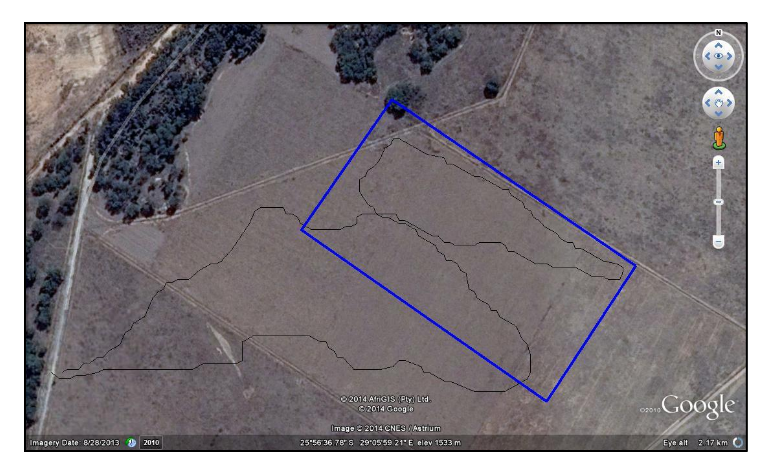
Figure 3: Google Image of the study area (in blue) with track logs of the area covered in black

It is important to note that the entire farm was not surveyed but only the footprint of the proposed mining permit area as indicated in Figure 1. The study area is extensively disturbed and has been used for agricultural purposes in the past. During the survey no sites of heritage significance were identified inside the mining footprint.