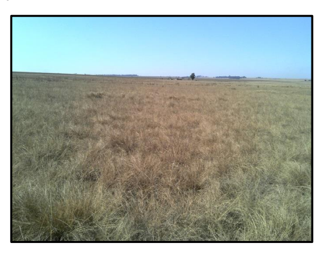
Figure 5. Central section of study area.