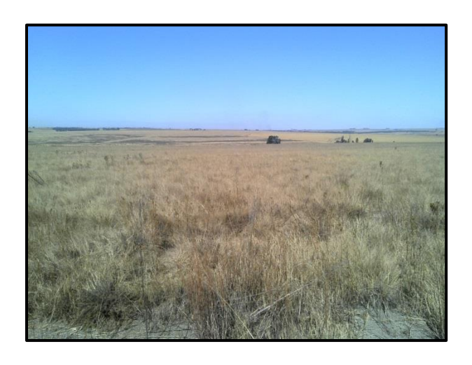
Figure 4. Northern portion of study area.