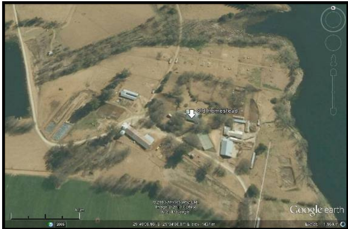
Figure 2. Google aerial photograph showing the location of the old homestead on the Farm Clovelly.