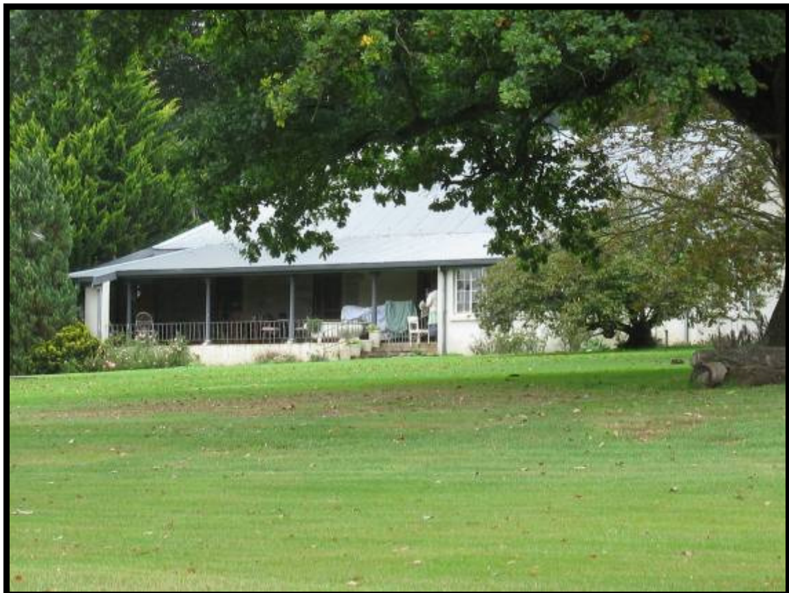
Figure 3. Old residential house on the Farm Clovelly.