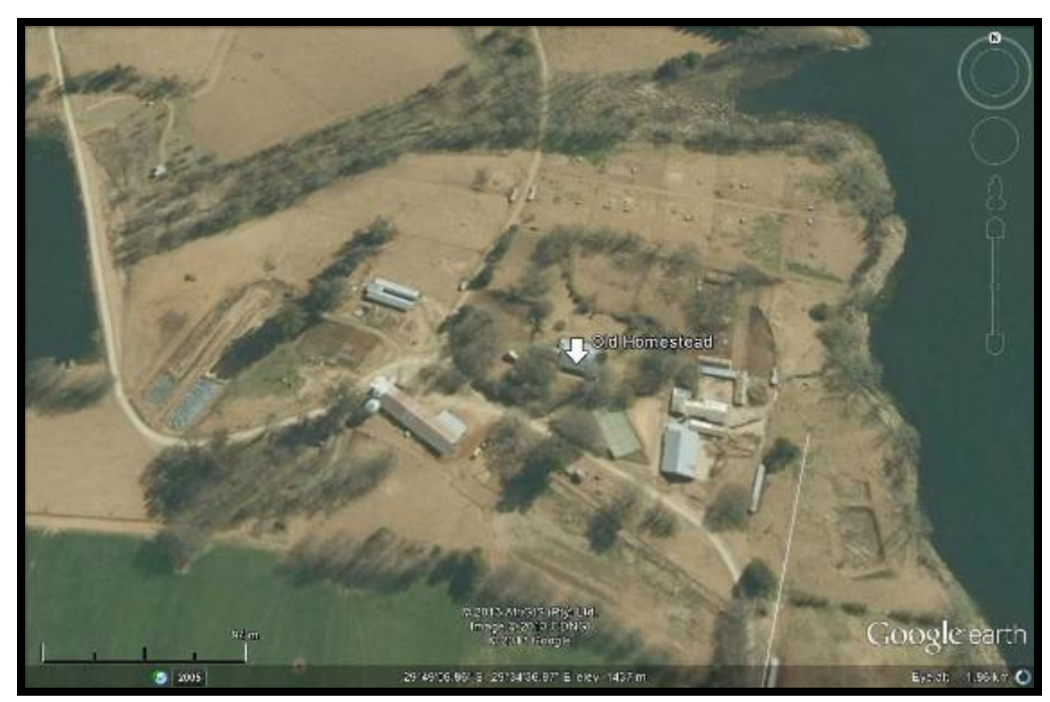
Figure 2. Google aerial photograph showing the location of the old homestead on the Farm Clovelly.