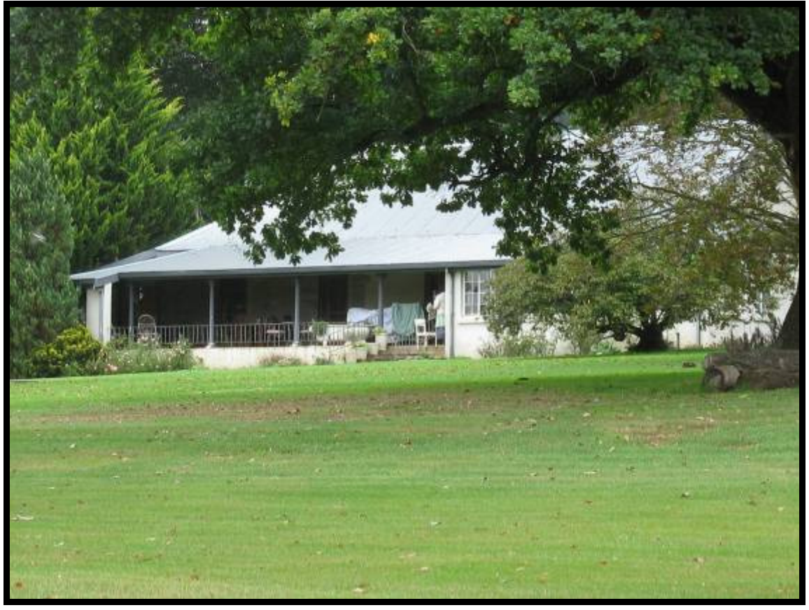
Figure 3. Old residential house on the Farm Clovelly.