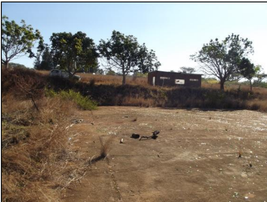
Fig. 6. Site CW 2. View to the north of the netball courts.