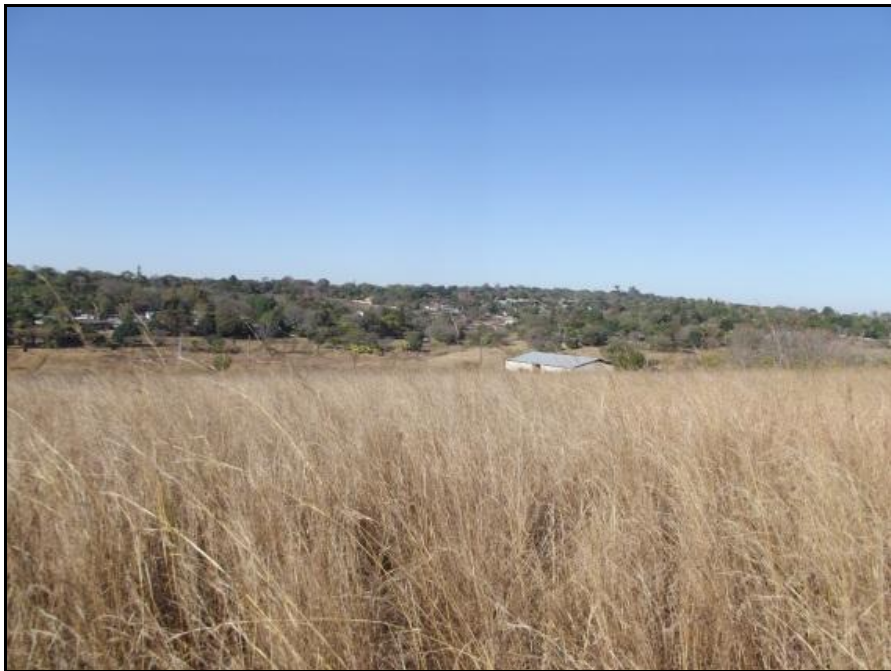
Fig. 2. General view of study area, taken in Southern direction.