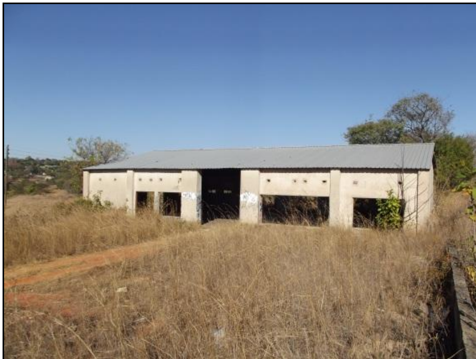
Fig. 4. Site CW 1. A storage facility which has fallen into disuse.