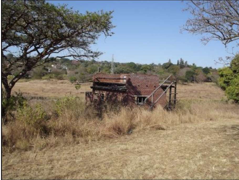
Fig. 9. Site CW 4. A structure which may serve or have served as a bird hide.