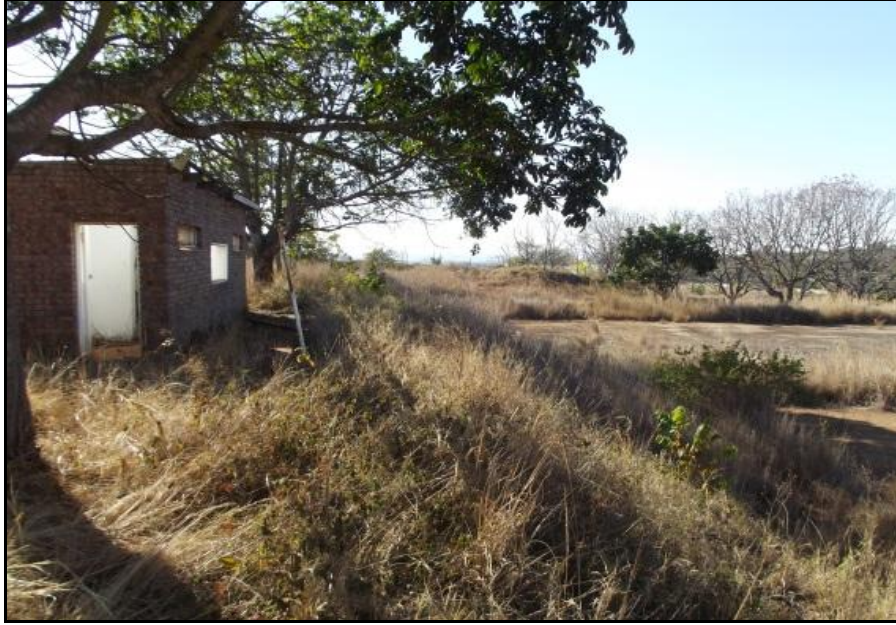
Fig. 5. Site CW 2. A netball court and stands with refreshments building visible on the left.