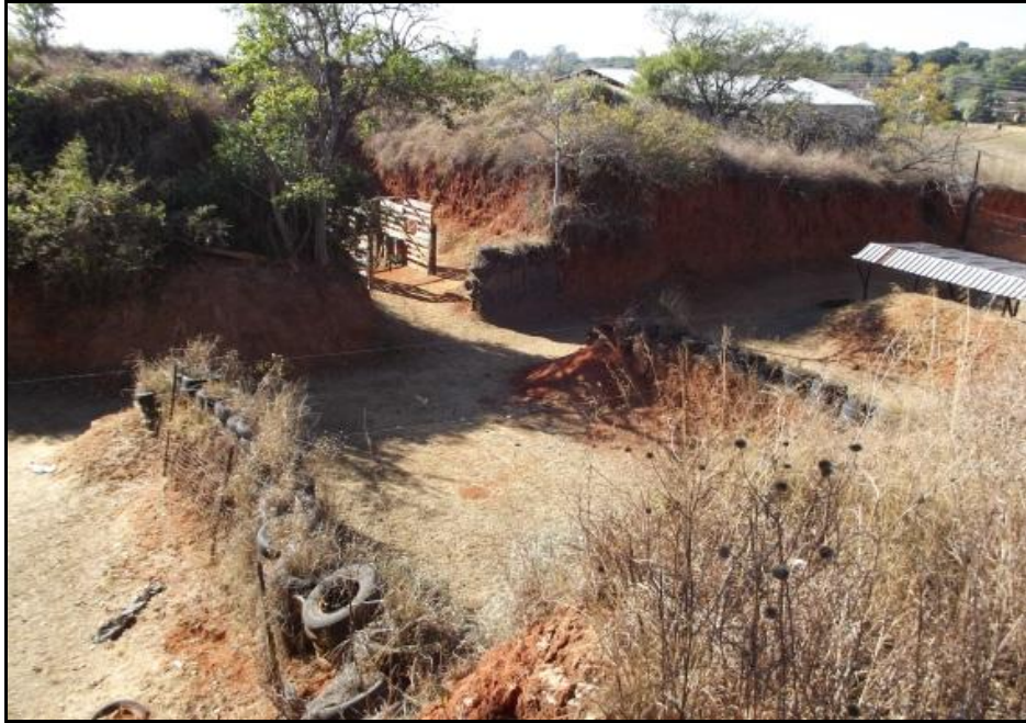
Fig. 7. Site CW 3. A pistol shooting range currently still in use.