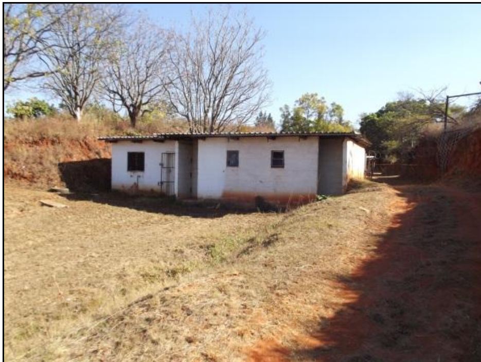
Fig. 8. Site CW 3. Shooting Range Club house, photo taken in Northern direction.