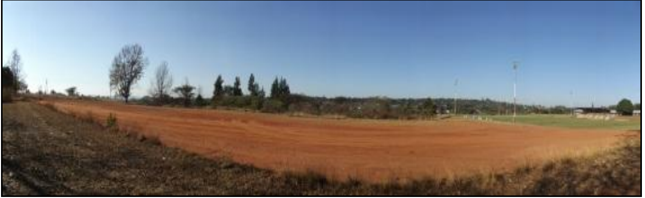
Fig. 1. General view of study area.