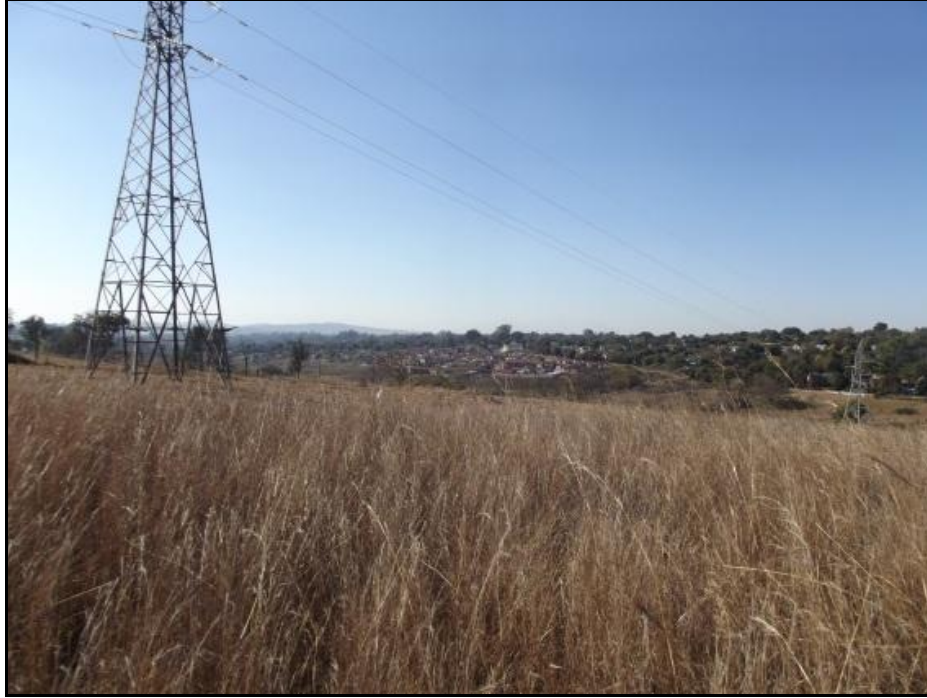
Fig. 3. General view of study area, photo taken in South-eastern direction.