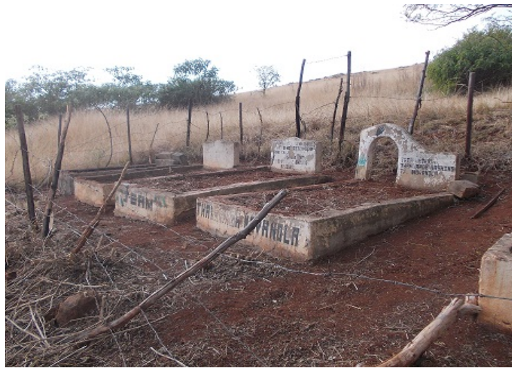
Fig 2. View of family cemetery.

GPS co-ordinate: S30° 20' 11.8" E29° 58' 36.1" Fig 3.