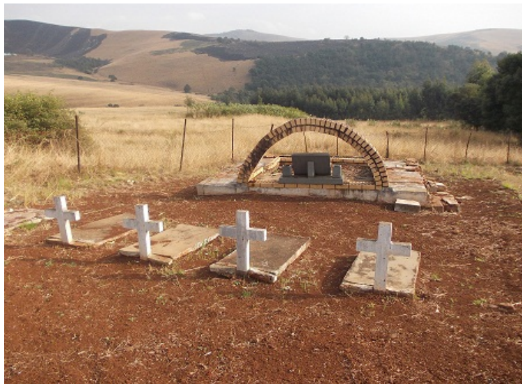
Fig 3. View of second family cemetery