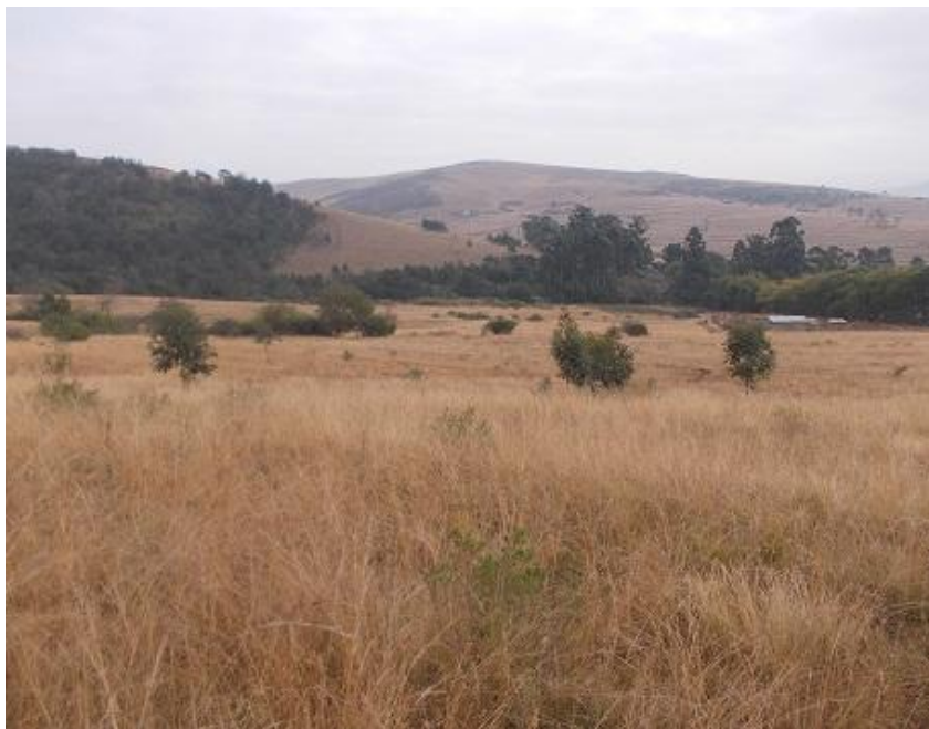
Fig 1. General view of proposed development area

General GPS co-ordinate: S30° 20' 29.1" E29° 58' 10.5"