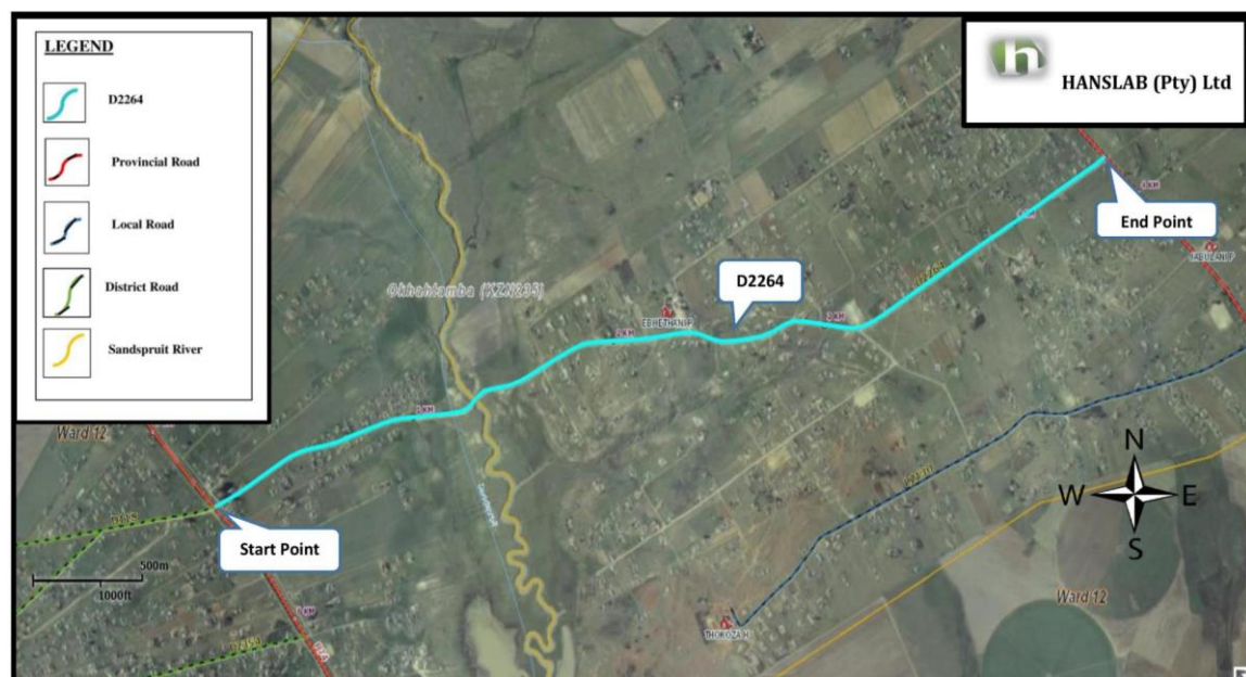
Figure 2. Map showing the locality of the proposed D2264 Road Upgrade near Bergville, KwaZulu-Natal (Source: Hanslab (PTY) Ltd).