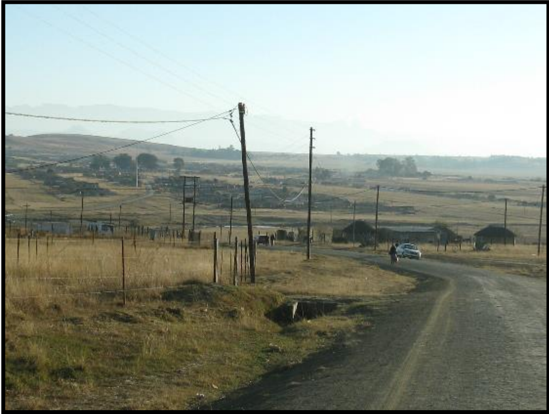
Figure 5. The D2264 facing east. The Maloti Drakensberg World Heritage Site is visible in the distance.

Figure 2. Google aerial photograph showing the distribution of the known heritage sites in the greater Bergville area. None occur near the footprint.