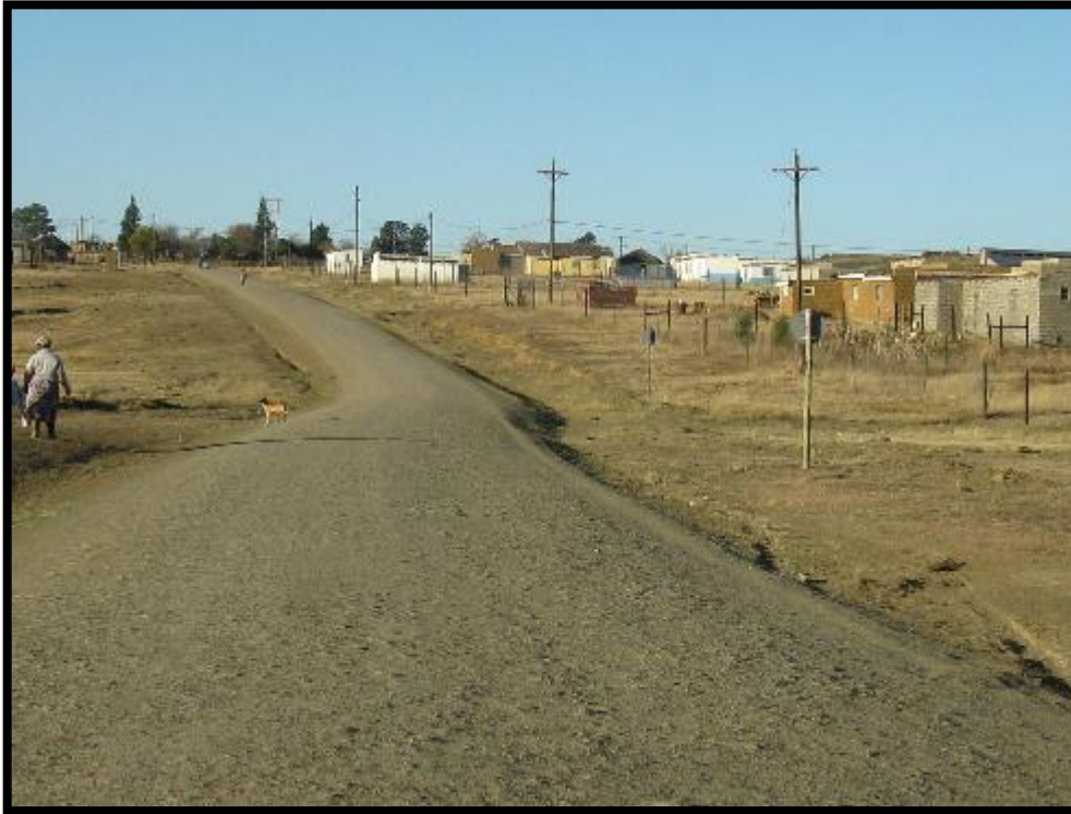
Figure 3. The D2264 is presently a gravel road that serves the local community. No graves were noticed within 60m on either side of this road.