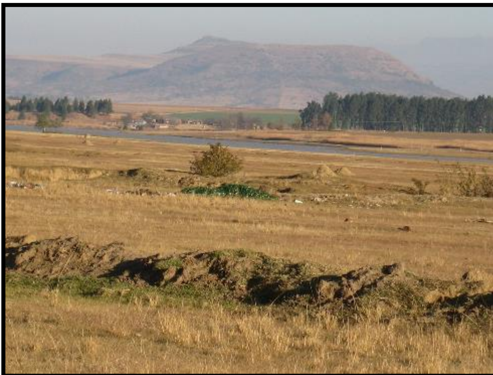
Figure 4. Although there is evidence for soil erosion and disturbance in the project area no heritage sites have been affected.