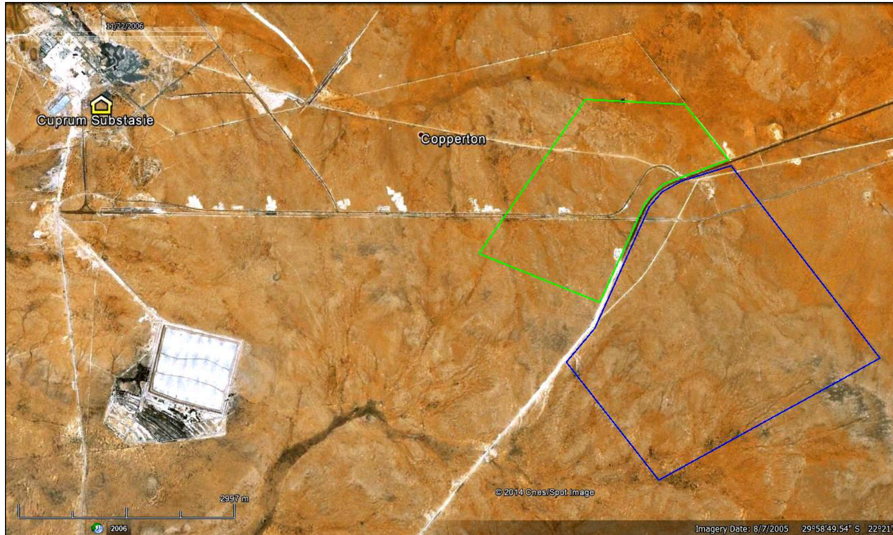
Figure 2: Google earth© satellite image showing the location of the study areas for the RE Capital 13 (green polygon) and RE Capital 14 (blue polygon) PV solar facilities on the Remainder of Farm 147, Humansrus near Copperton, Siyathemba Municipality, Northern Cape. The existing Cuprum Substation is indicated; the existing Kronos Substation is located just to the south of the southern edge of the image