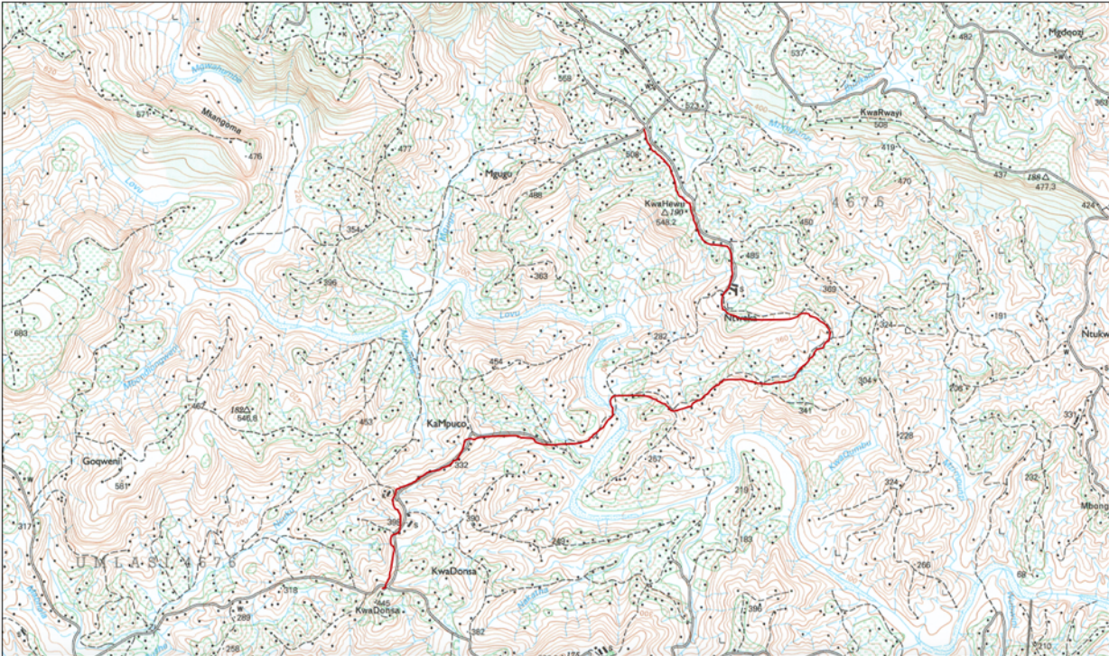
Figure 5: Topographical Map 3030 BA 1993