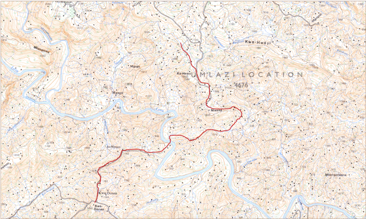
Figure 7. Topographical Map 3030 BA 1968