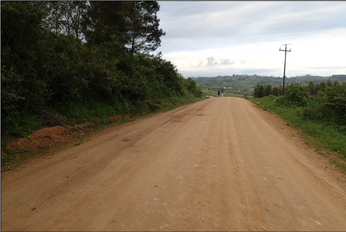
Figure 4. D985