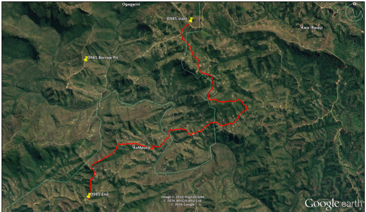
Figure 2. Google Earth Image of D985