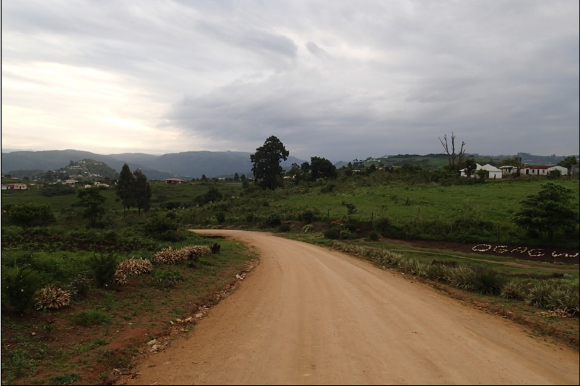
Figure 3. D985