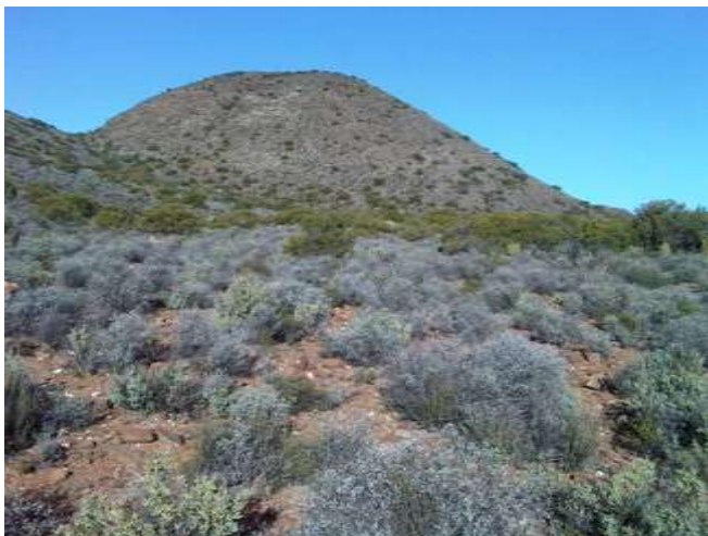
Looking southeast from the edge of the existing pit at the fynbos vegetation (April 2011). The expanded pit will lie in the foreground of the photo.