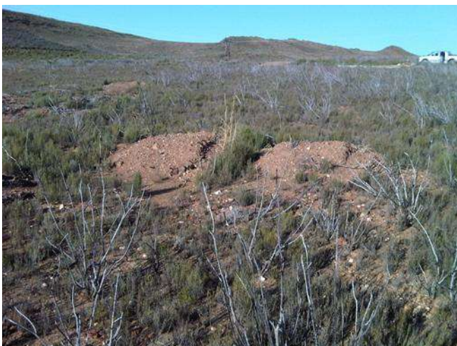
Looking east across the proposed site towards DR01721 is in the background (April 2011).