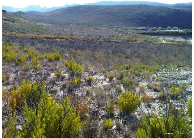
Looking west across the site of the proposed borrow pit located to the south and east of the existing farm dam (April 2011).