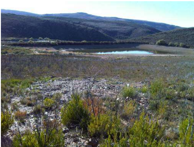
Looking northwest across the site of the proposed BP, located between road DR01721 and existing dam (April 2011).