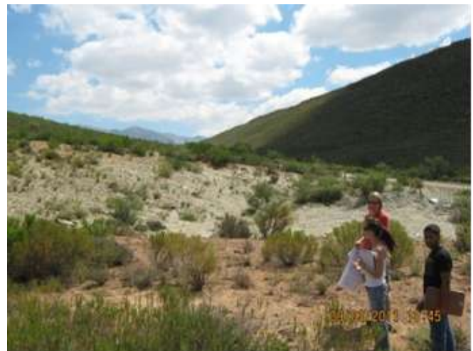
Looking west from existing borrow pit berm with DR01721 in the background (March 2011).