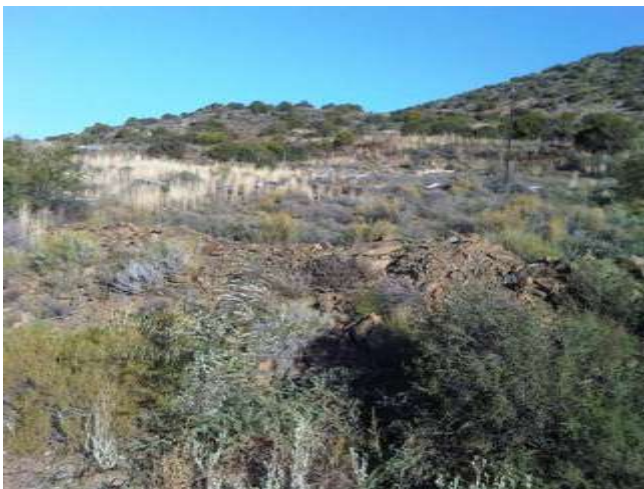
Looking east from the edge of road DR01721 towards the site of the proposed pit (April 2011).