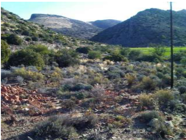
Looking southwest across site with building rubble in the foreground (April 2011).