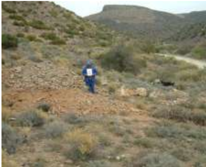
DR 01721/0.9 View stockpile of pit 4 stockpile