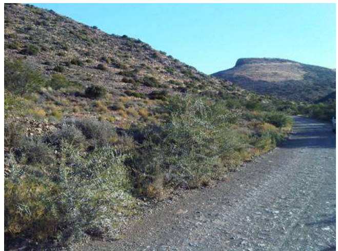
Looking south across the site of the proposed borrow pit. Road DR01721 is on the right (April 2011).