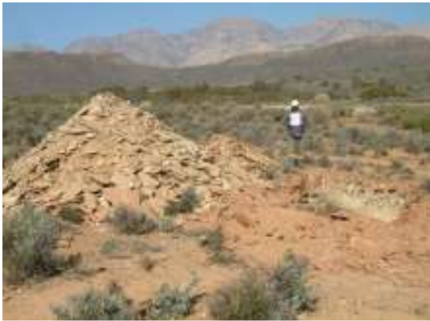
DR 01721/03.7View of TP6 stockpile and up-slope extension terrain