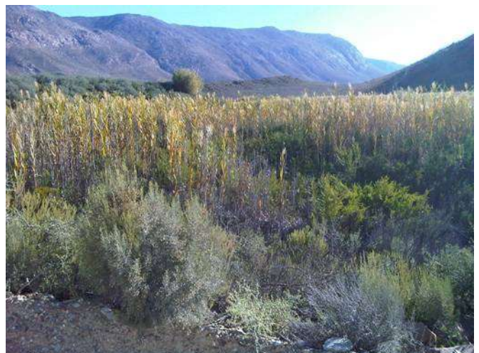
Looking north across the site of the proposed borrow pit at vegetation in the existing dam (April 2011).