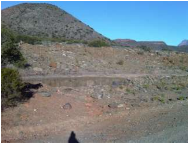
Looking east at the existing borrow pit from the edge of DR01721 (April 2011).