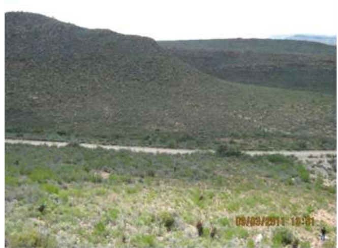
Looking north, onto adjacent DR01721 (March 2011).