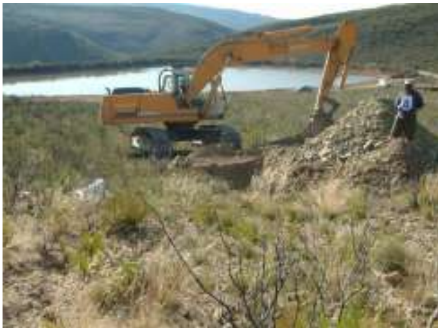
DR 01721/08.4 View from TP1 across old pit towards up-slope extension terrain