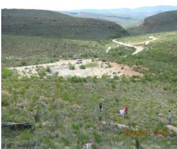
Looking north-east from hillock towards existing borrow pit and DR01721 (March 2011).