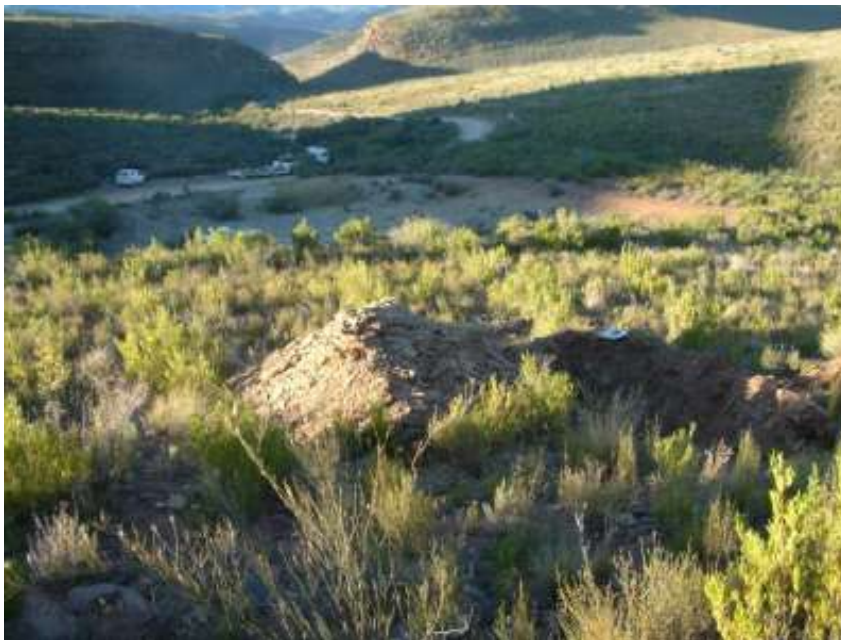
DR 01721/016.5 Pit 4 - typical stockpile and surroundings and view towards existing pit