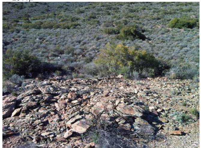
Looking east-northeast at a test pit and the area into which the pit will expand (April 2011).