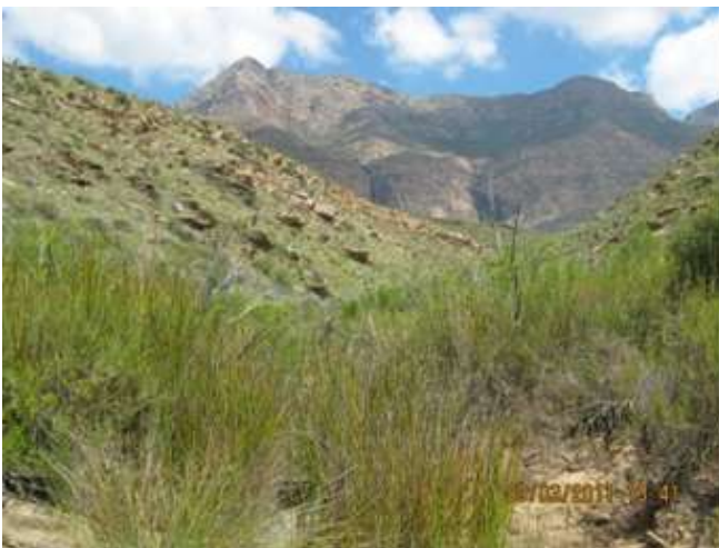
Looking south up the nearby ephemeral watercourse, east of the existing borrow pit (March 2011).