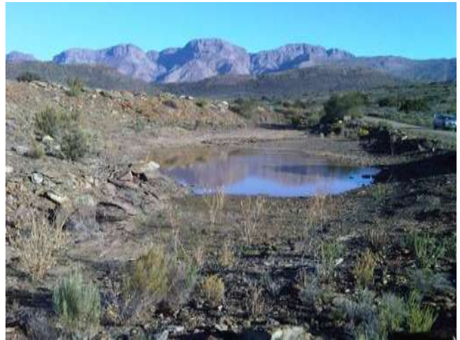
Looking south from the northern edge of the existing pit towards DR01721 and the Swartberg Mountains (April 2011).