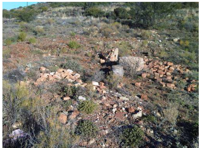
Rubble (April 2011).