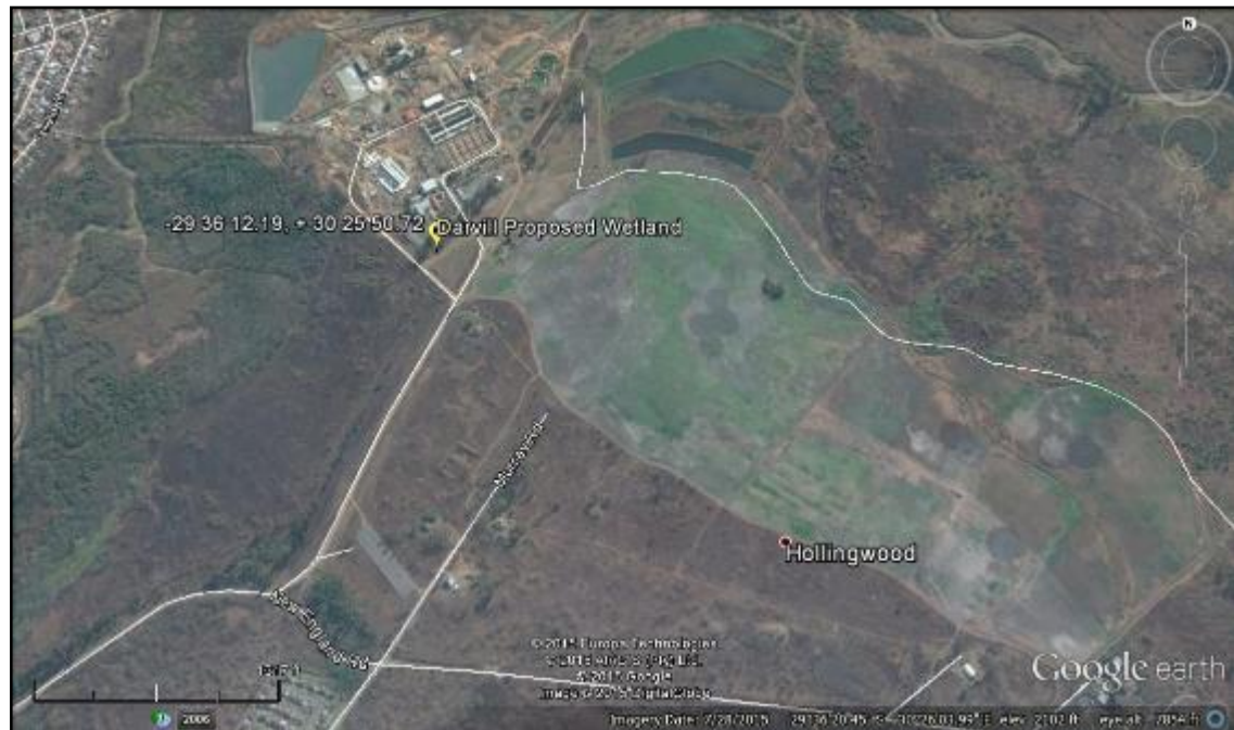
Figure 1. Location of Darvill Water Treatment Works.

The GPS coordinates for the site is given as: 29° 36' 12.19" S, 30° 25' 50.72" E. The environs surrounding the Wastewater Treatment Works include disturbed grasslands and thornveld dominated by Acacia sieberana and other exotic trees and shrubs (Fig 5).