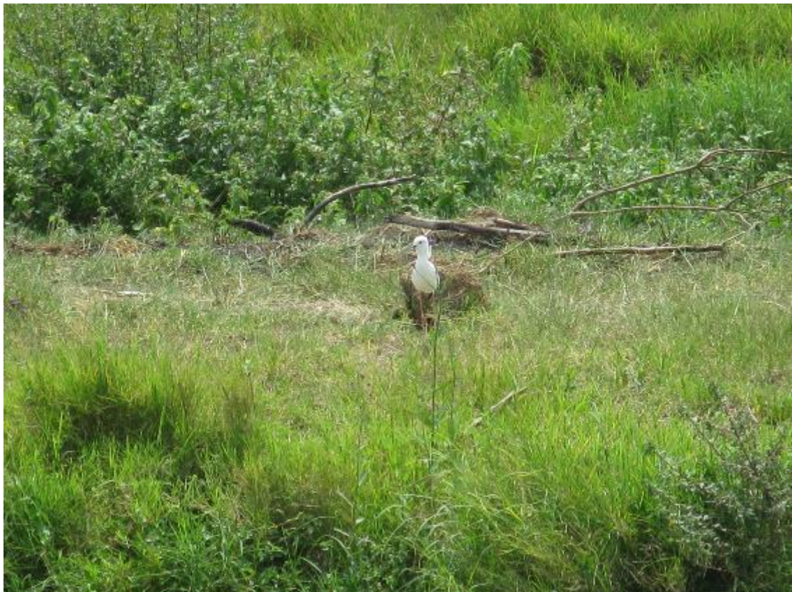
Figure 4. The potential for development into a wetland is apparent.