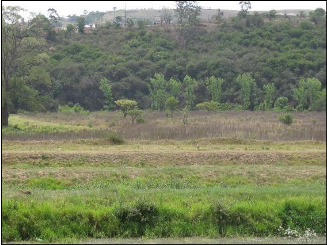
Figure 3. Surrounding Area.