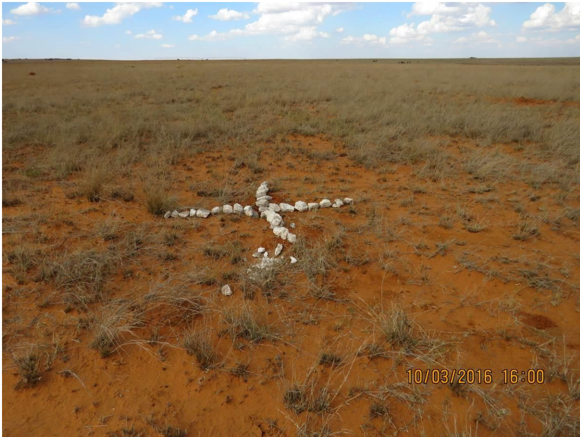
Figure 4. Drill site.

The site was found to be mantled by a layer of red Hutton sand, reportedly some 20 m deep. It is, as indicated, in previously ploughed land, sparsely covered by grass.