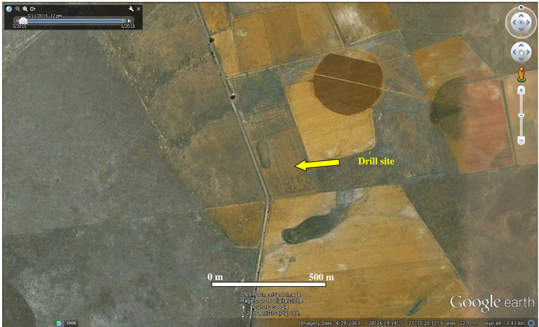
Figure 3. Google Earth image showing position proposed drilling site in middle of ploughed farmland.