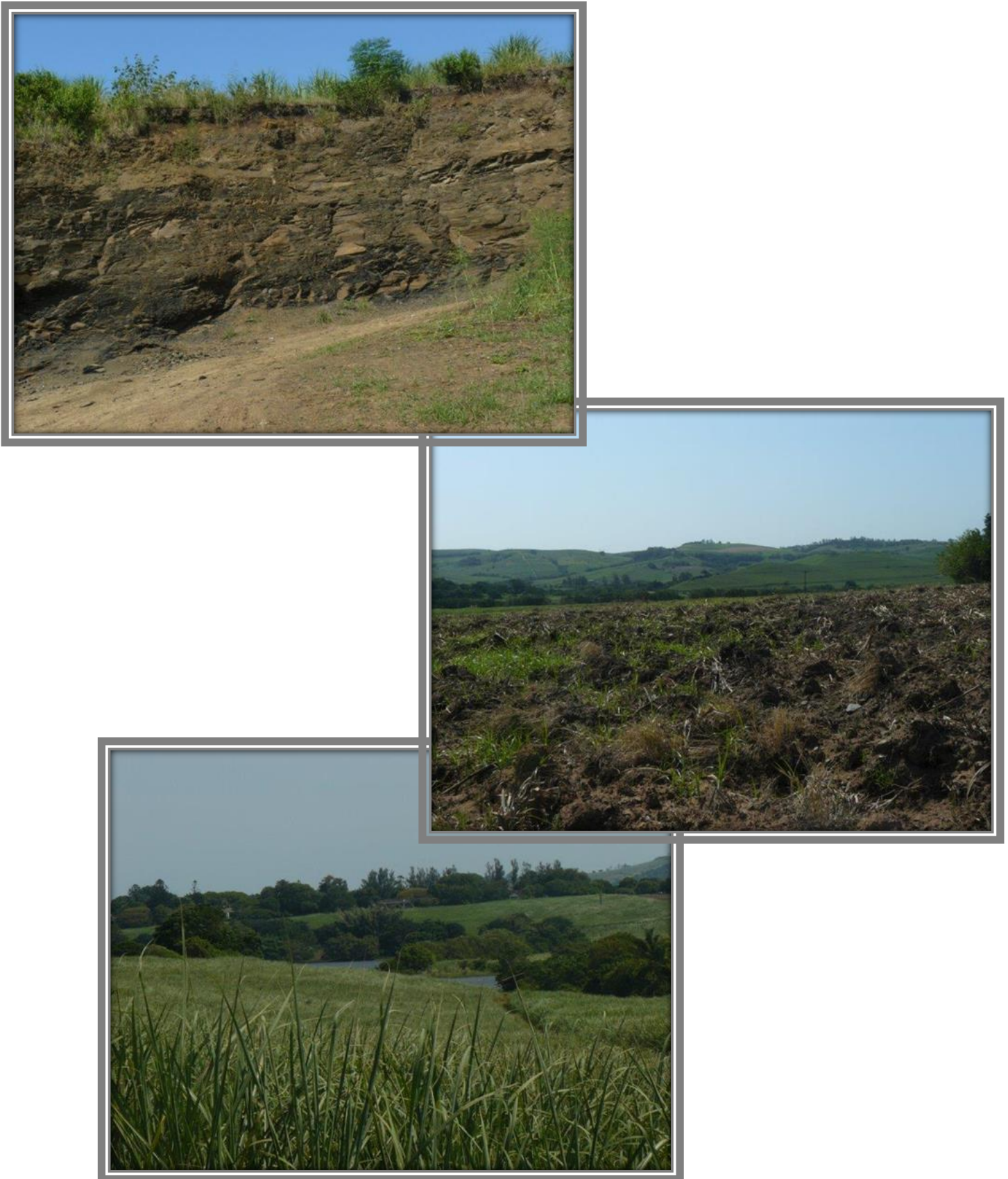
FIGURES 4-8 VARIOUS VIEWS OF THE PROPOSED DEVELOPMENT SITE.