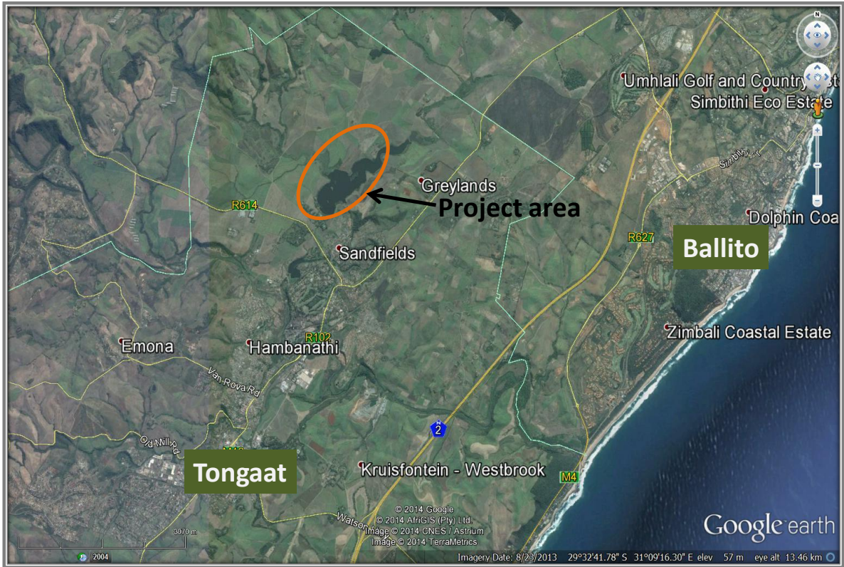
FIGURE 2 LOCATION OF PROPOSED DEVELOPMENT SITE IN REGIONAL CONTEXT.