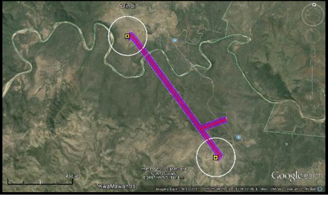
Figure 2. Google aerial photograph indicating the extent of the footprint. The proposed powerline trajectory crosses the White Mfolozi River..