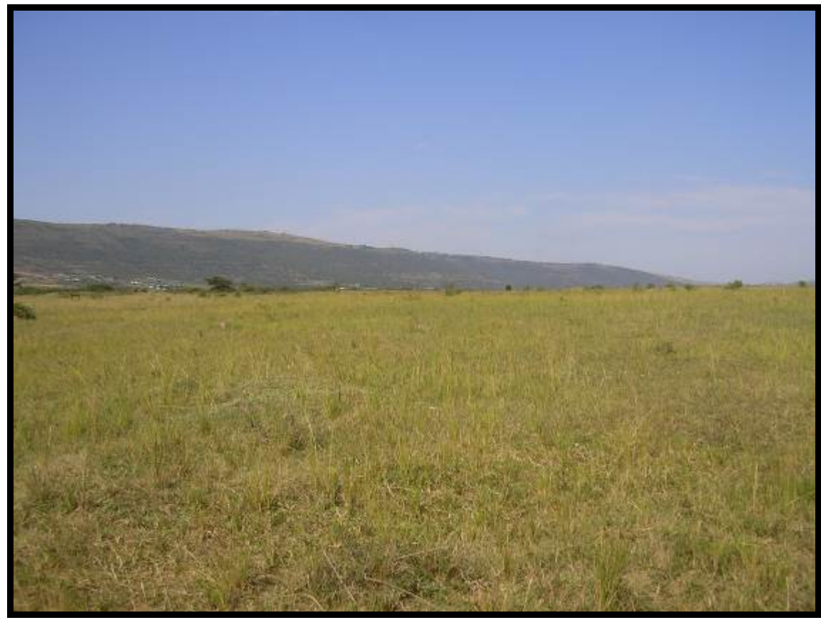
Figure 4. View of the study area: no heritage sites were located on the footprint.