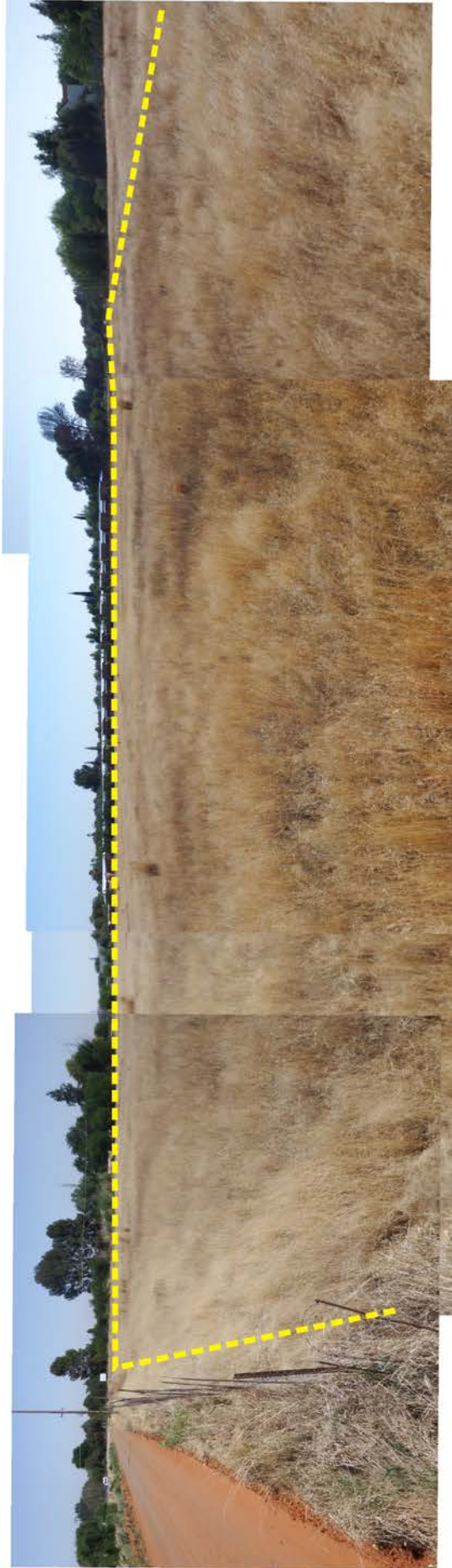
Figure 4. General view of the site, looking west-northwest.