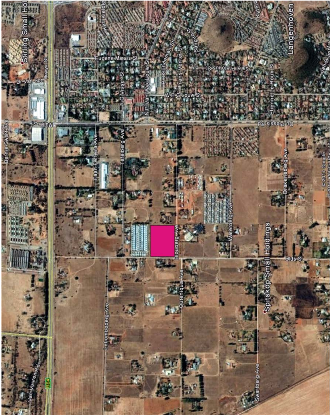
Figure 1. Position of Plot 31, Spitskop Smallholdings.