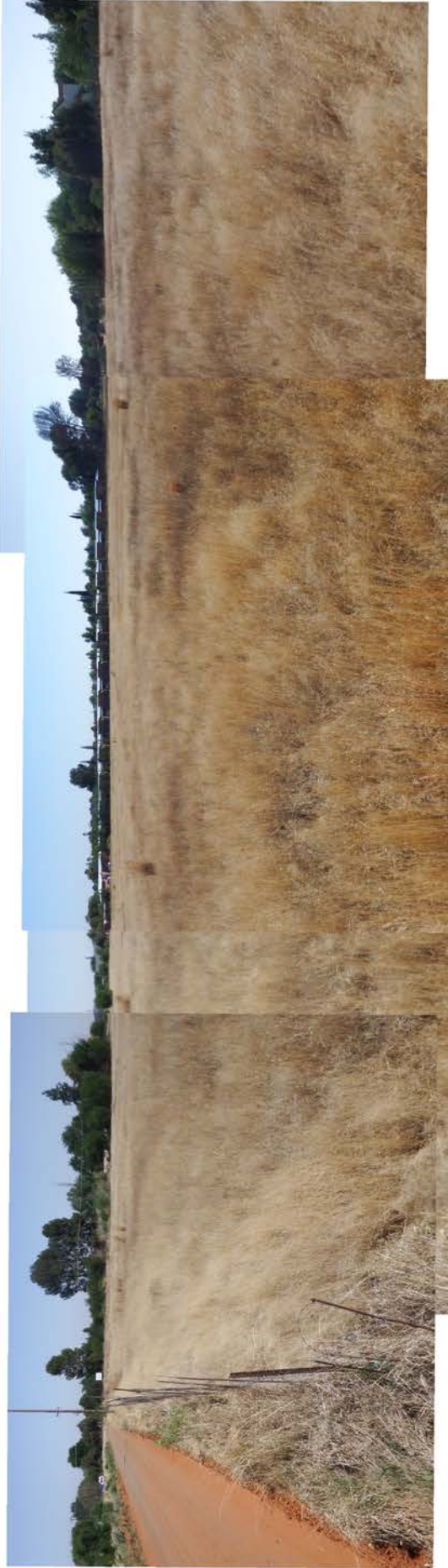
Figure 3. General view of the site, looking west-northwest.