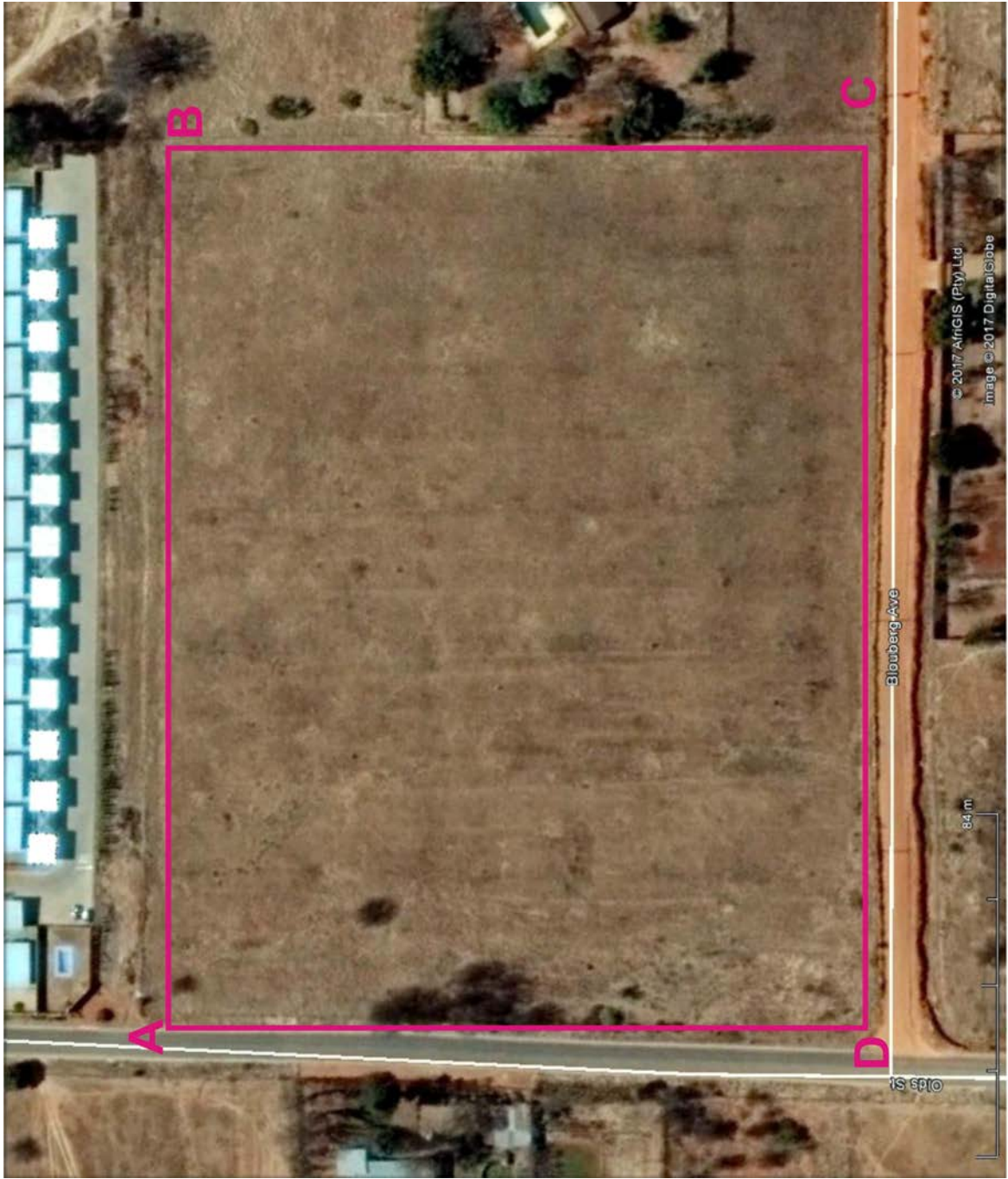
Figure 2. Aerial view of the terrain.