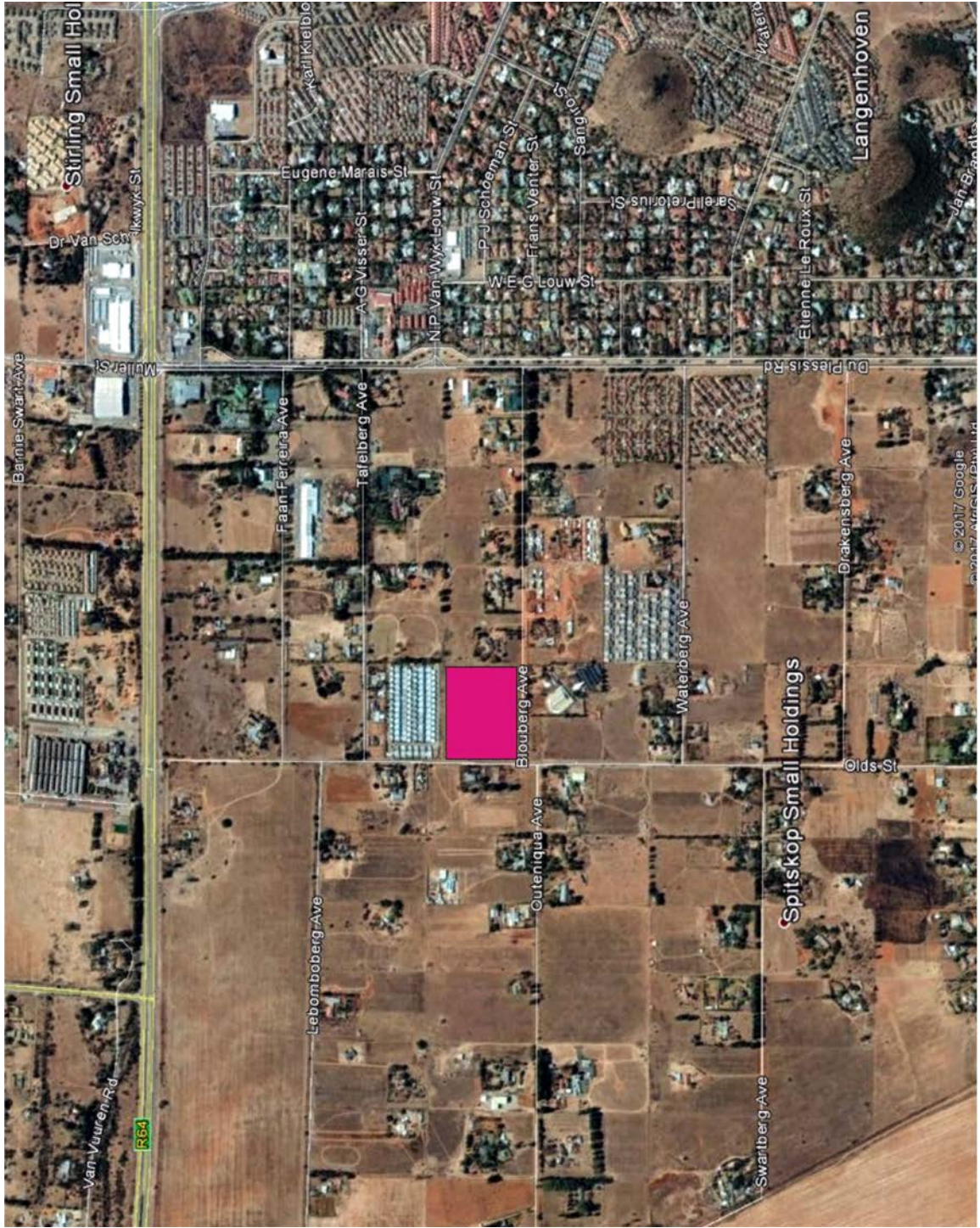
Figure 1. Position of Plot 31, Spitskop Smallholdings.