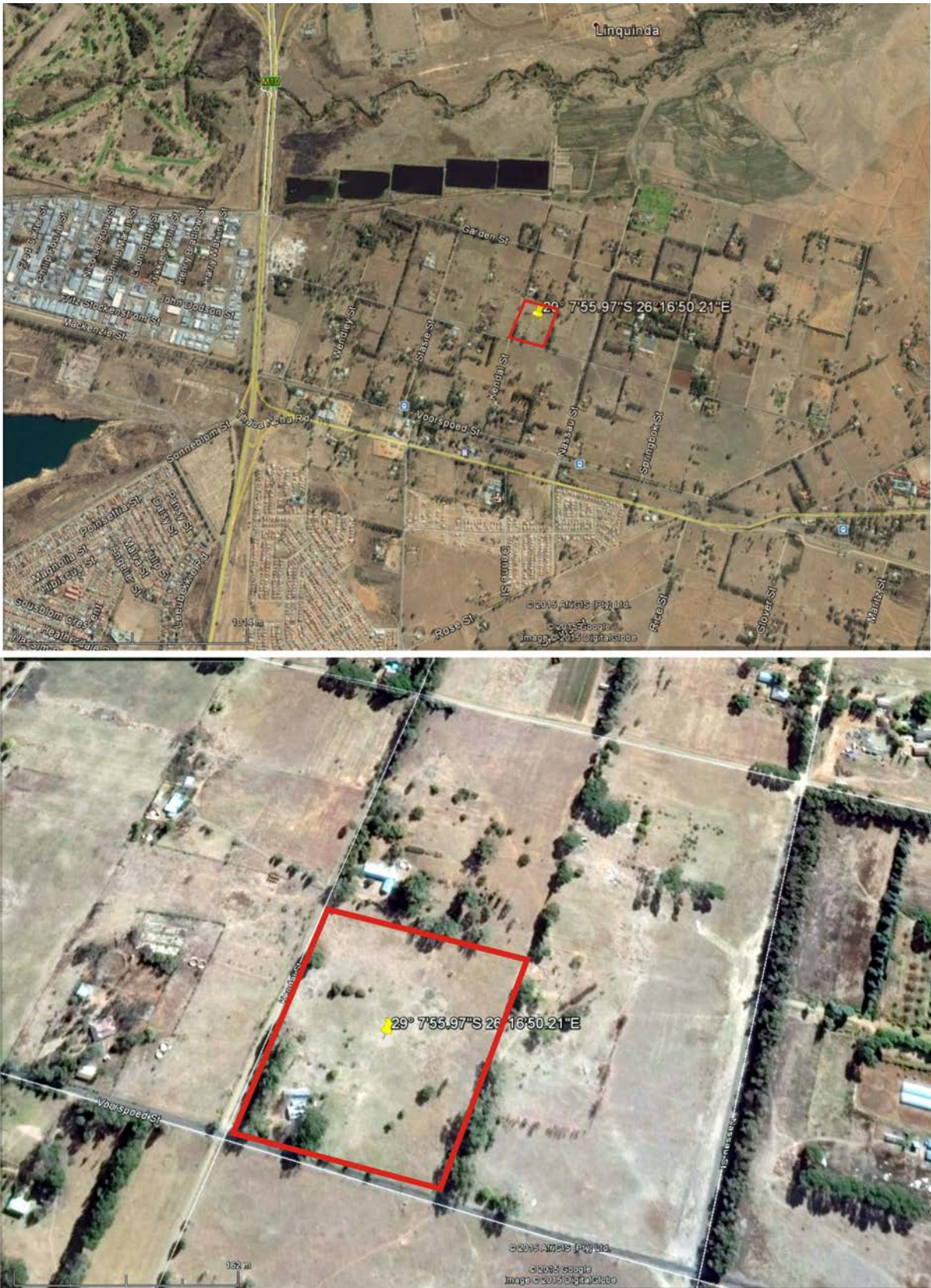
Figure 2. Aerial view of the study area.