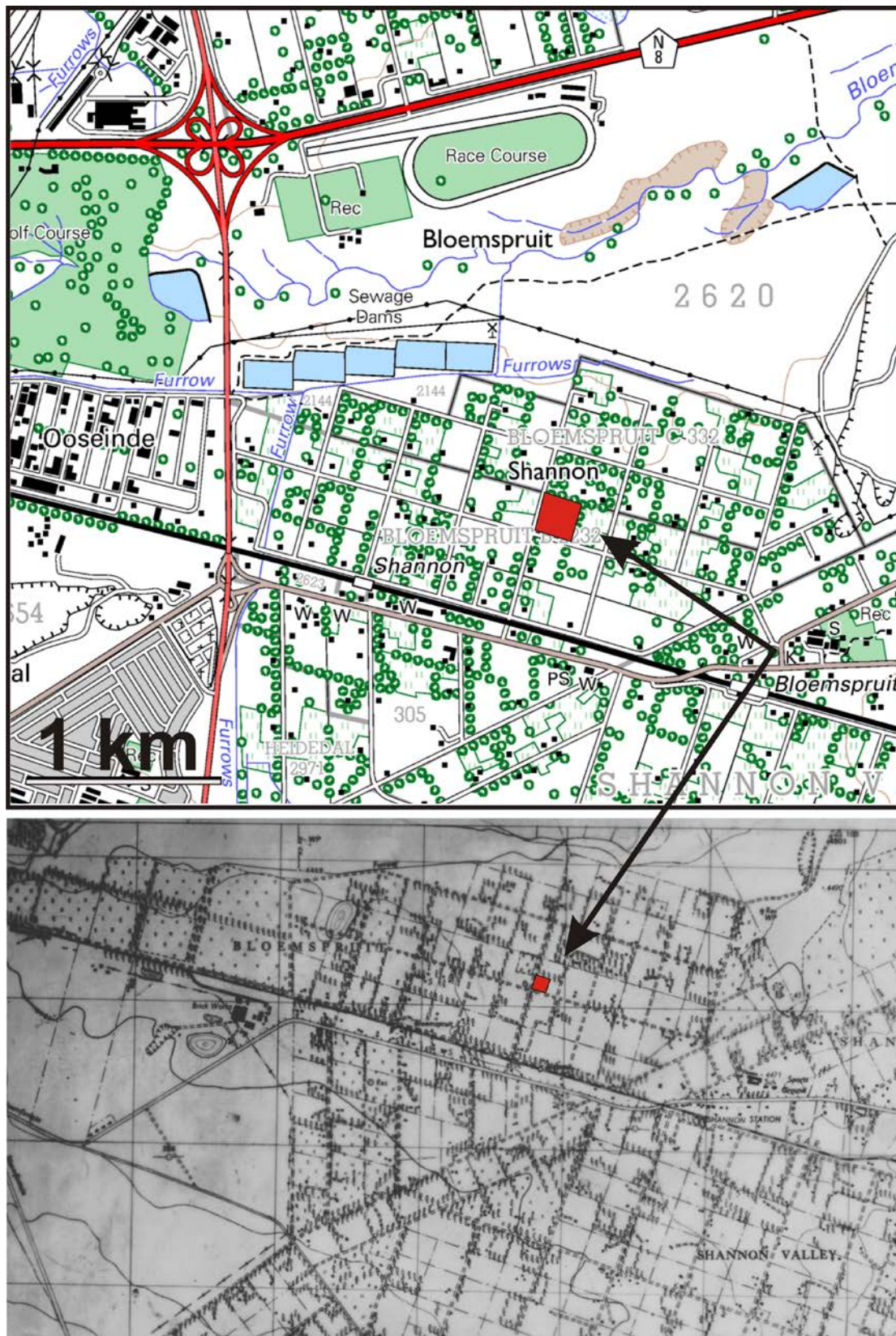
Figure 1. Plot 147, Bloemspruit, Bloemfontein (portion of 1:50 000 scale topographic map 2926 AB Maselspoort, circa 1992 above and portion of 1:18 000 scale topographic map 2926 C3 Maselspoort, circa 1941 below).