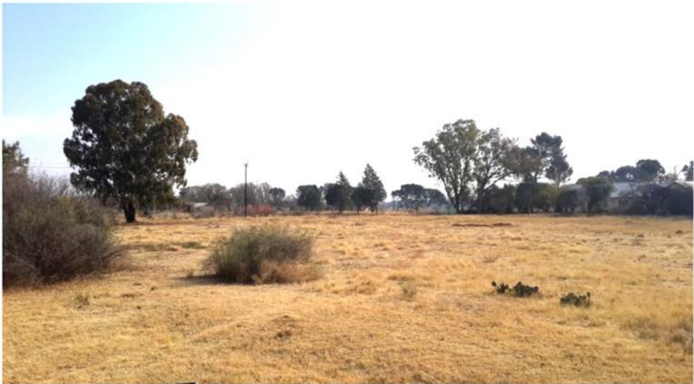
Figure 3. General view of Plot 147, looking north (top), south-west (middle) and north-east (bottom).