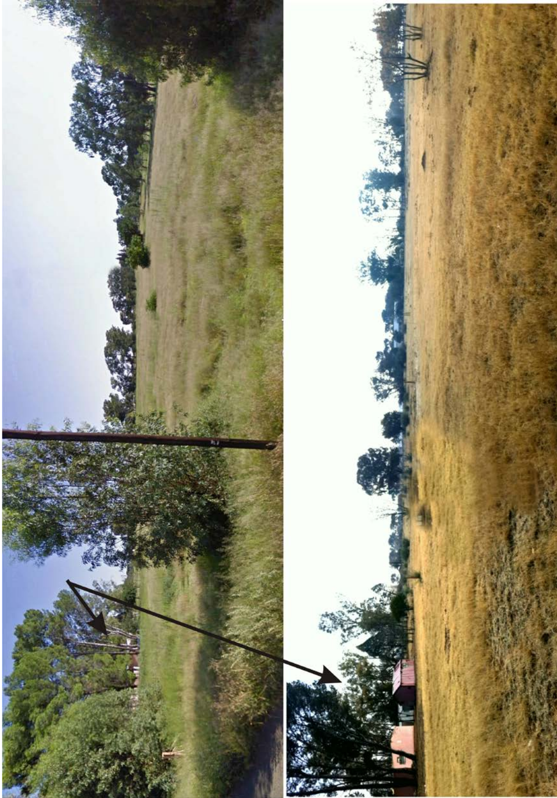
Figure 3. Plot 147, looking north (top) and north-west (bottom) with dilapidated house and sheds located to the left behind the eucalyptus trees.