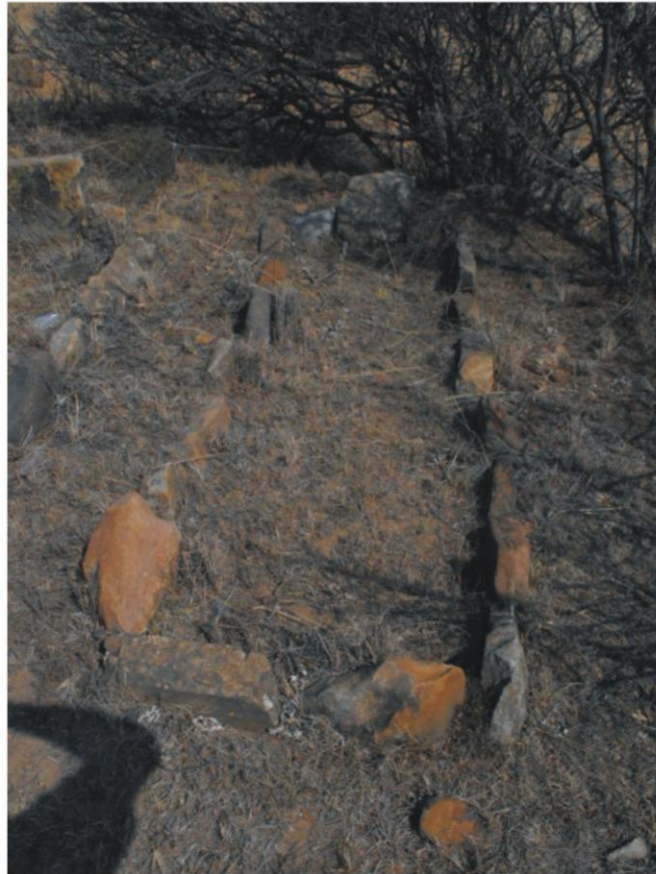
Figure 4. Small graveyard located near the entrance to the proposed new WWTW site.