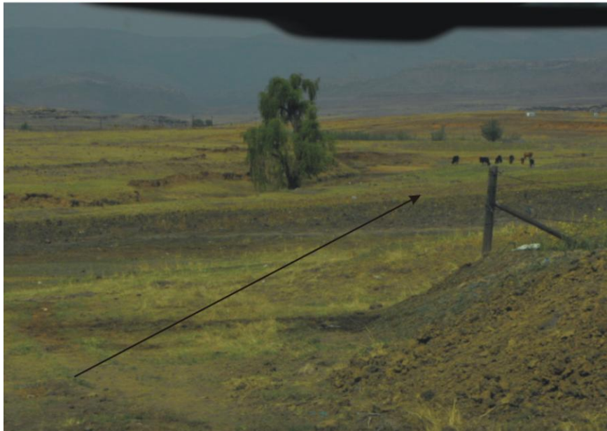
Figure 5. Phase 1 pipeline route