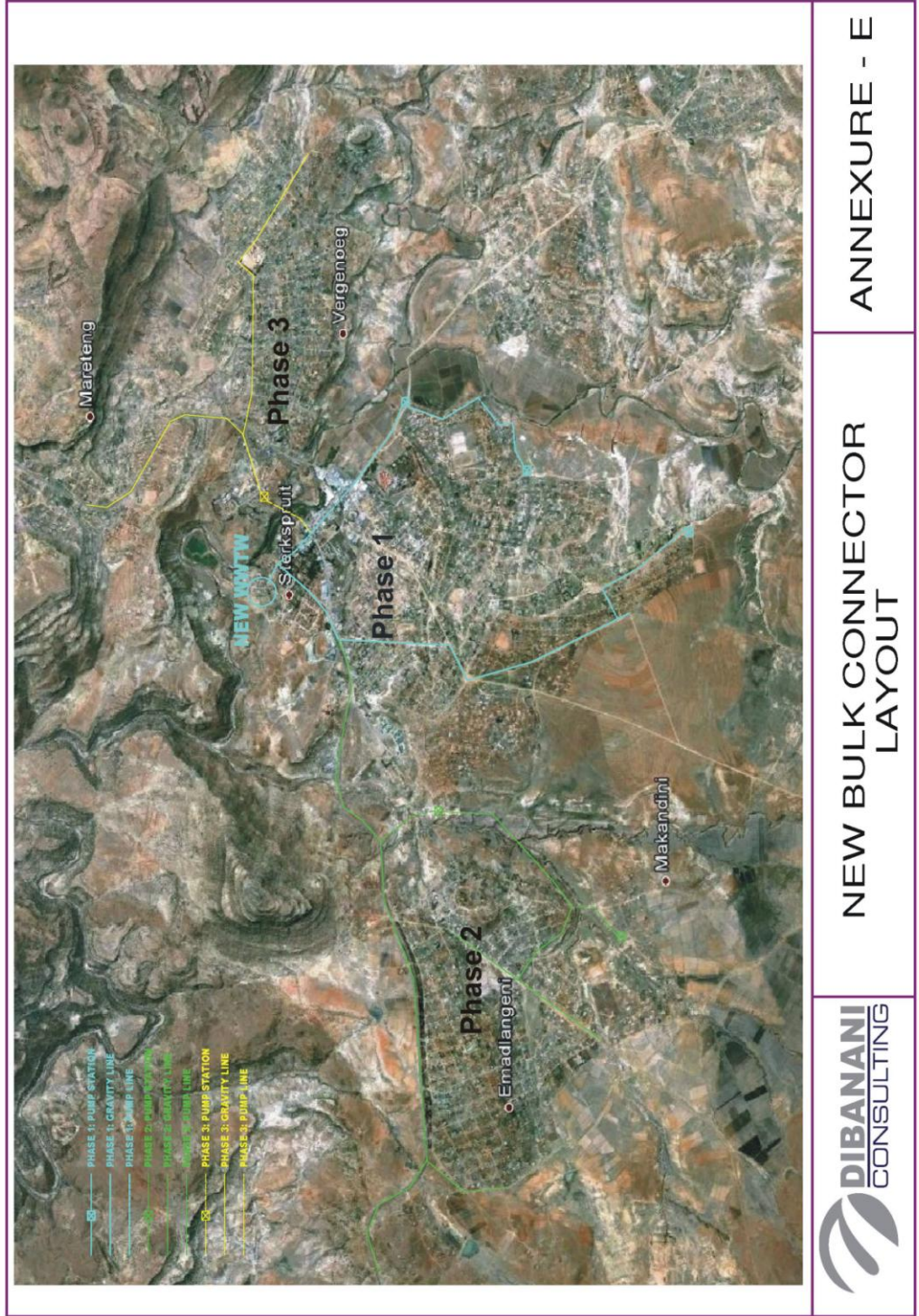
Figure 2. Layout of the proposed development.