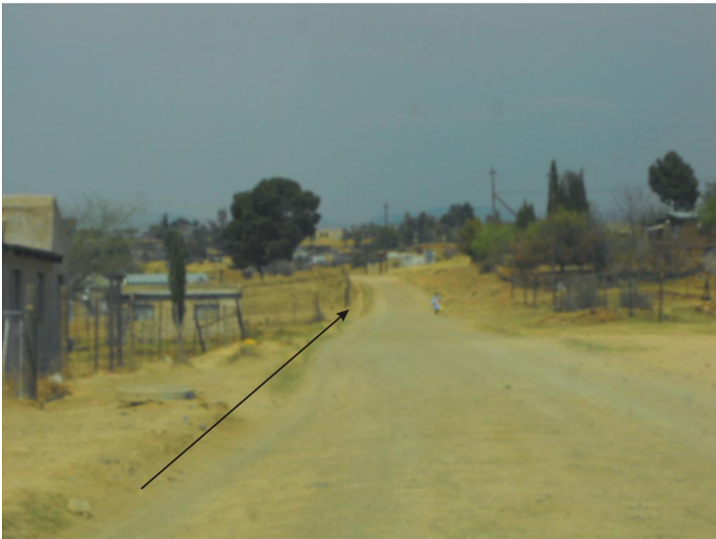
Figure 6. Phase 2 pipe line route.