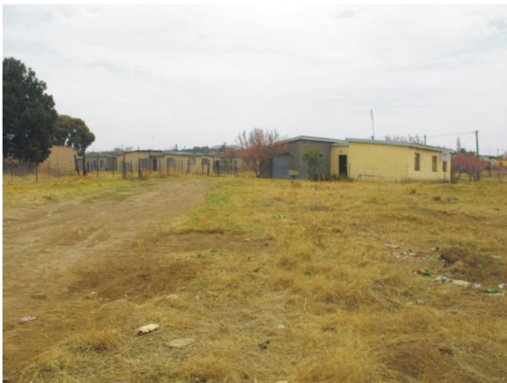
Figure 8. Phase 3 pipe line route.