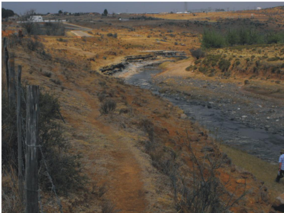
Figure 3. The WWTW site looking north (above) and overbank (alluvial) deposits of the Kromspruit at the WWTW site, looking southwest (below).