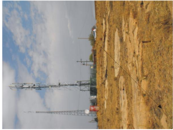
Figure 7. Phase 2 pipe line route.