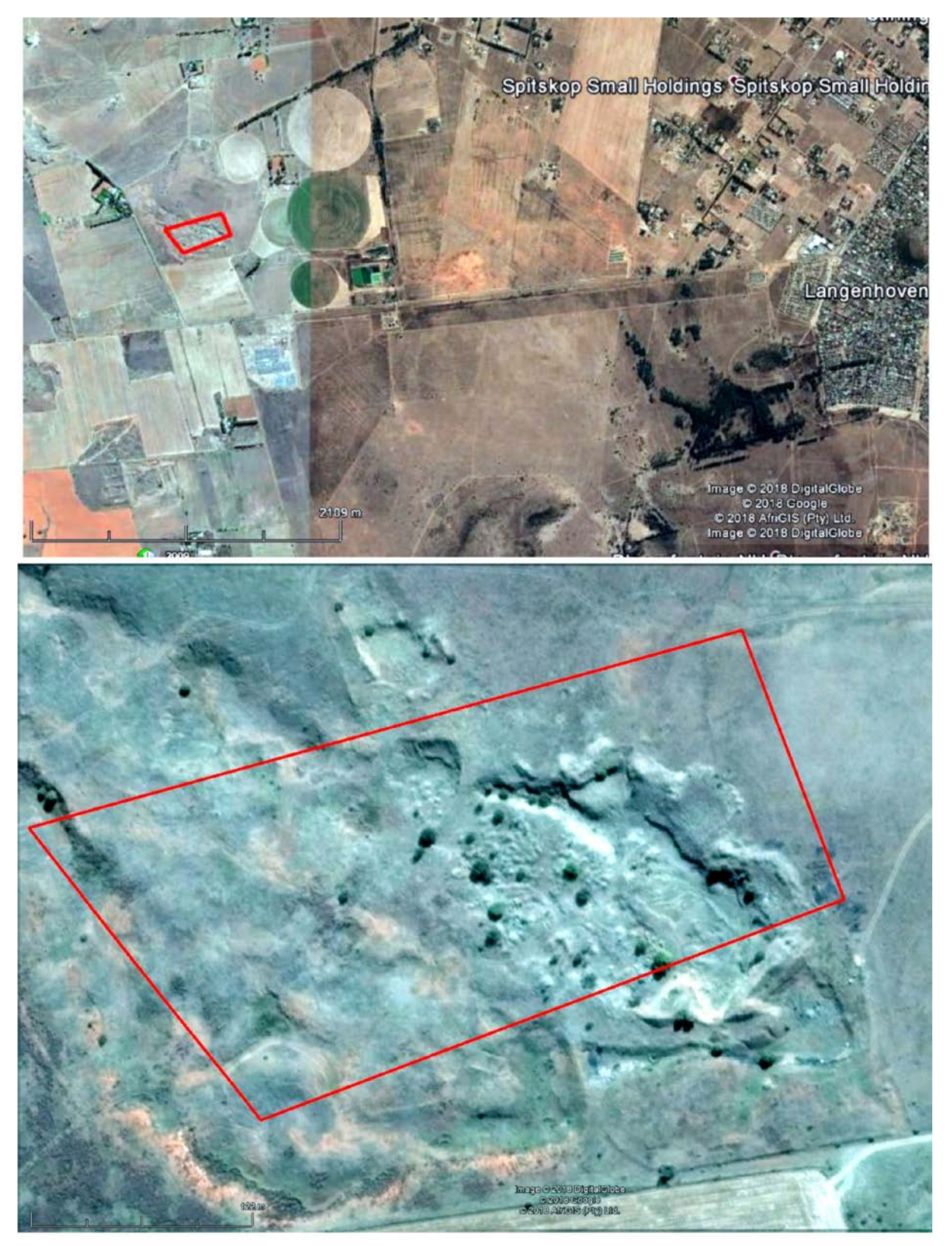
Figure 1. Aerial view of the proposed development footprint.