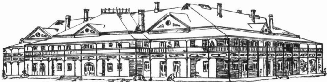
McGREGOR MUSEUM, KIMBERLEY