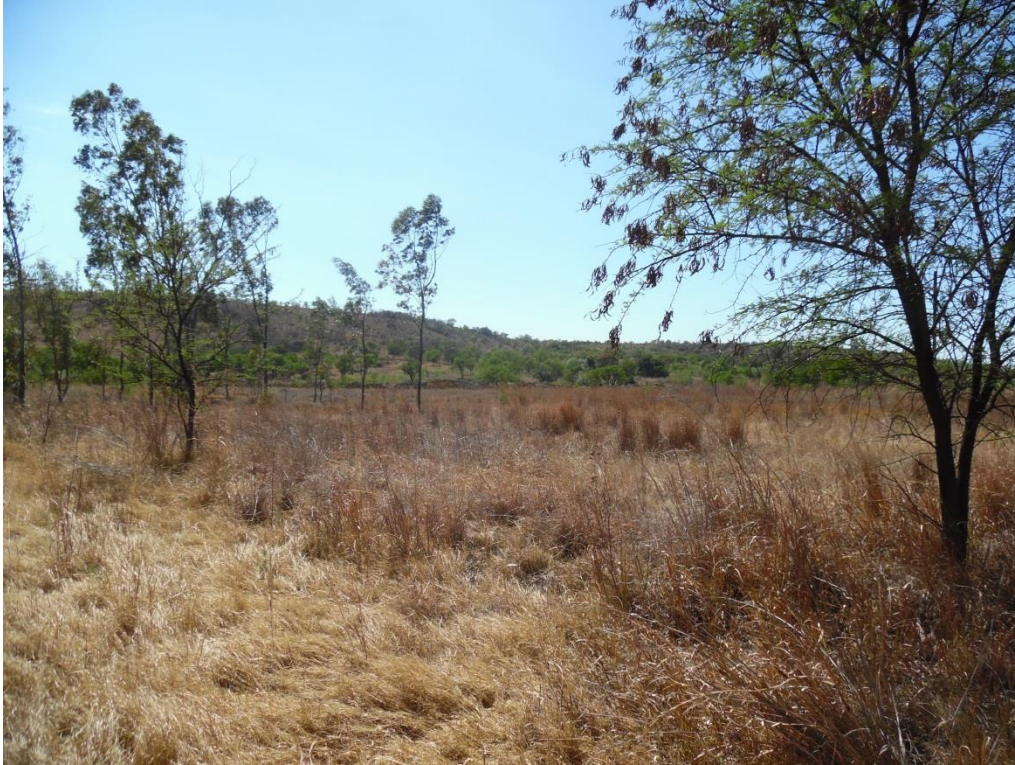
Figure 4: Site earmarked for development. Photograph taken towards the north.