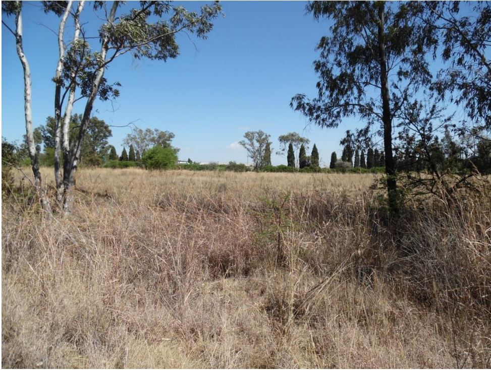
Figure 2: Site earmarked for development. Photograph taken towards the west.