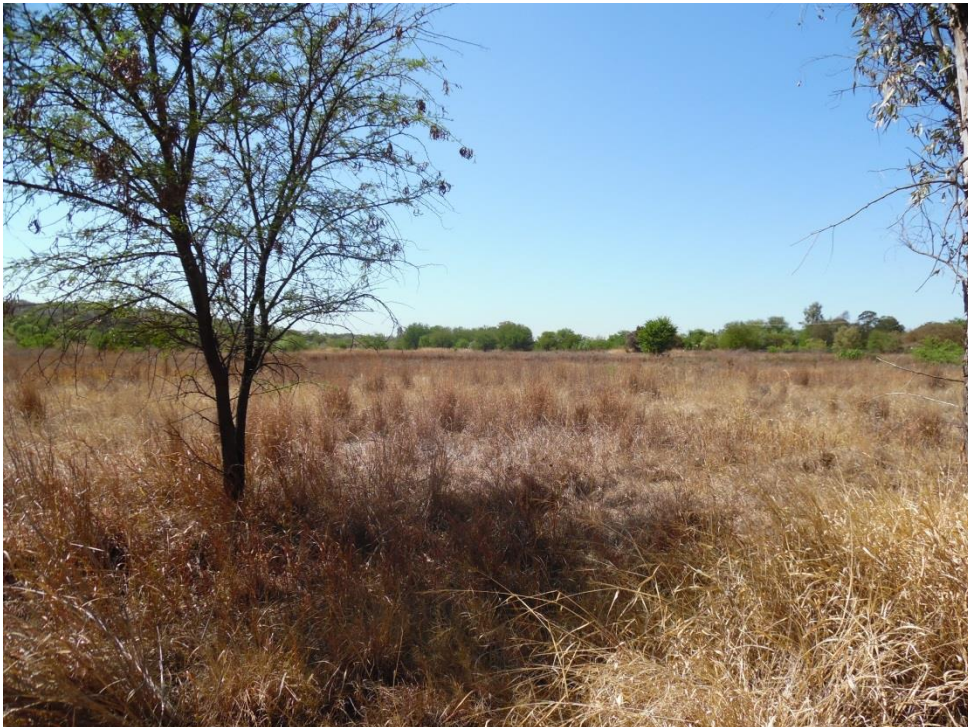
Figure 3: Site earmarked for development. Photograph taken towards the east.