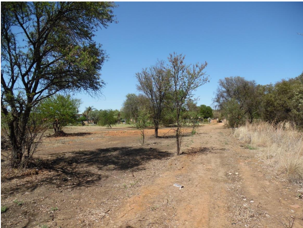
Figure 5: Site earmarked for development. Photograph taken towards the south.