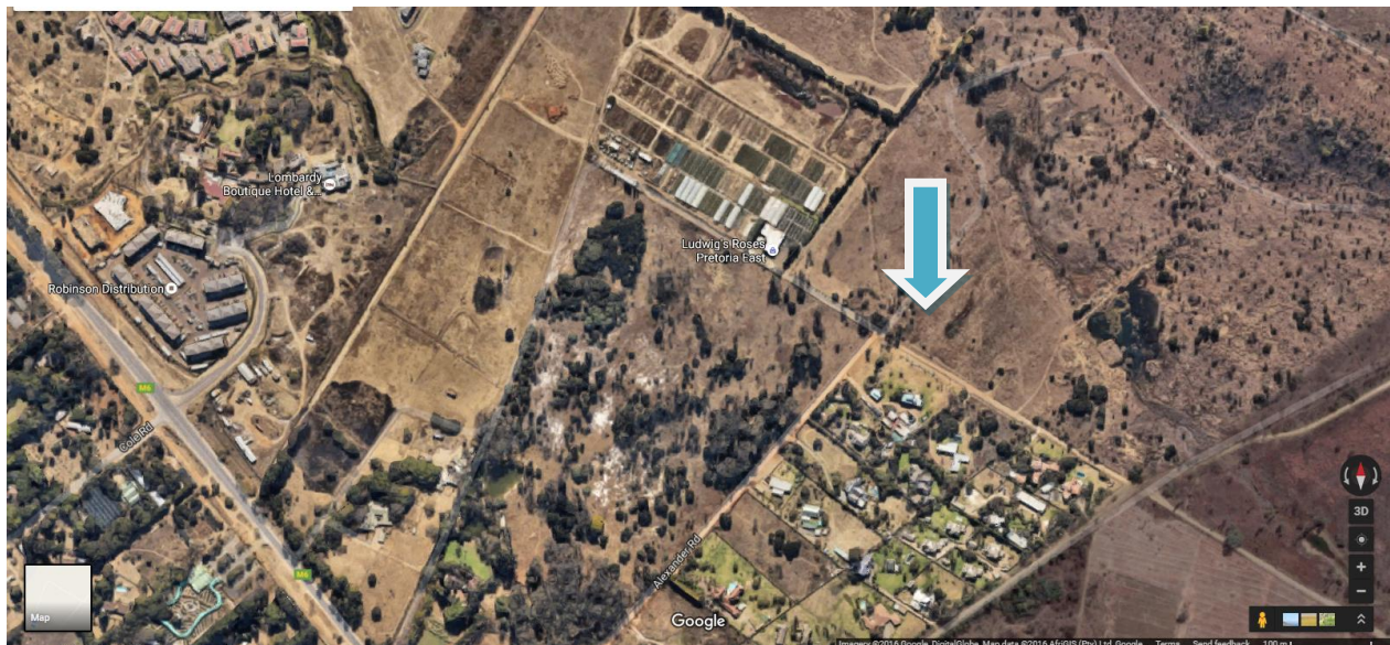
Figure 1: Site location

The site is situated east of the M10 (Solomon Mahlangu Drive), Lynnwood Road Extension (Graham Road) on a part of the Shere Agricultural Holdings.