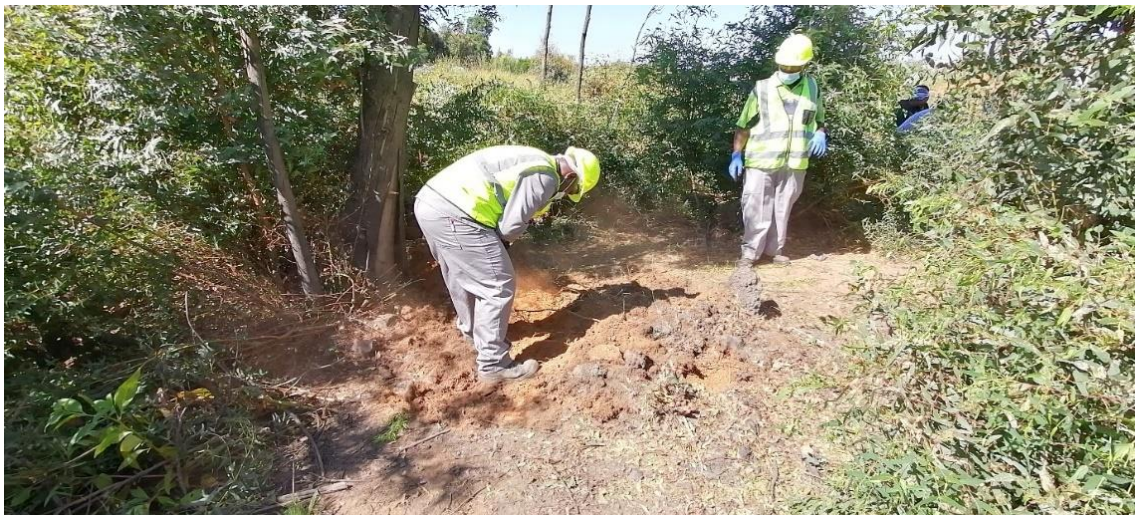
Figure 2-3: Manual Exhumation of Grave Pit