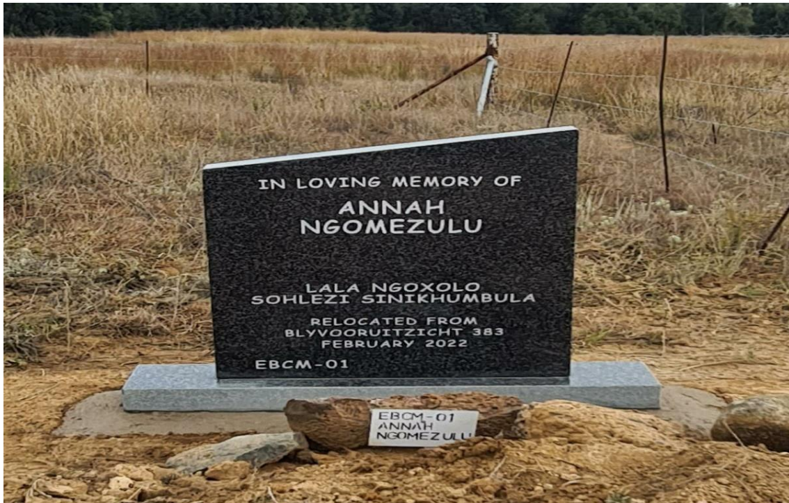
Figure 2-6: New Headstone erected at Phumulani Cemetery