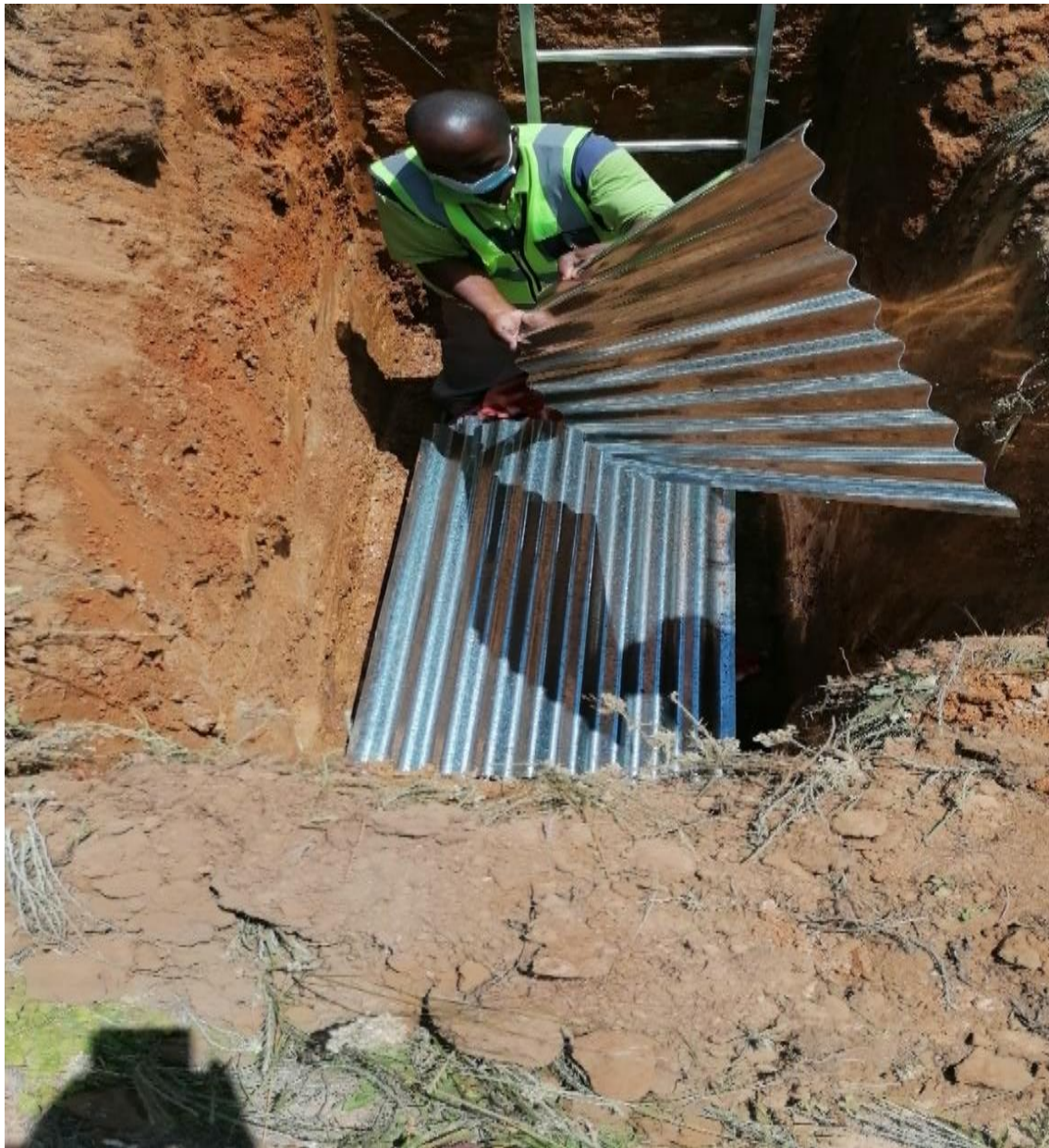
Figure 2-5: Replacing Corrugated Iron at New Grave Site