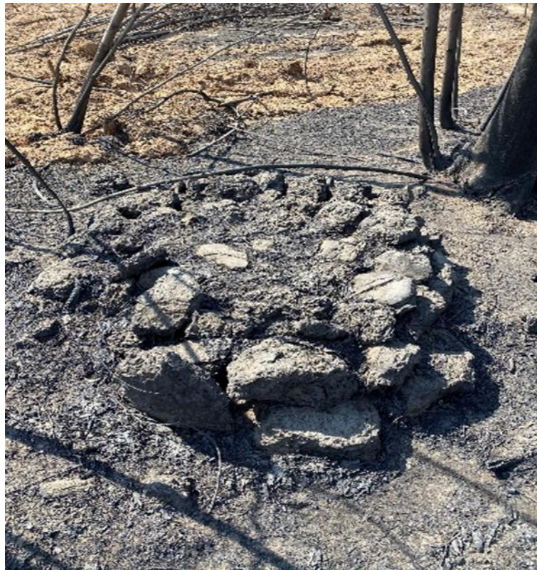
Figure 2-1: Grave EBCM-01