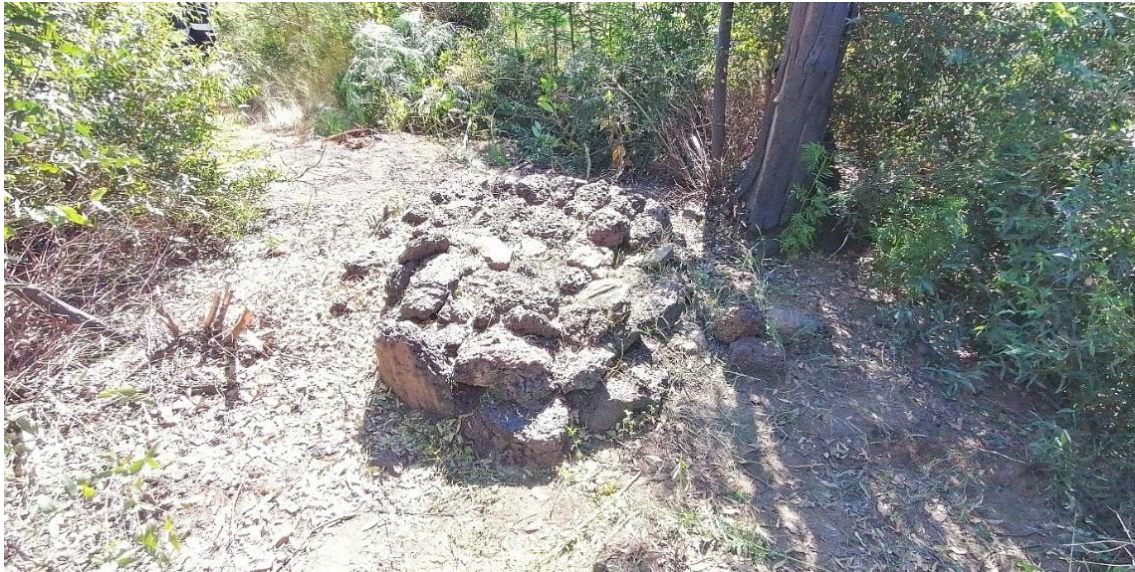
Figure 2-2: Detail of Surface Dressing