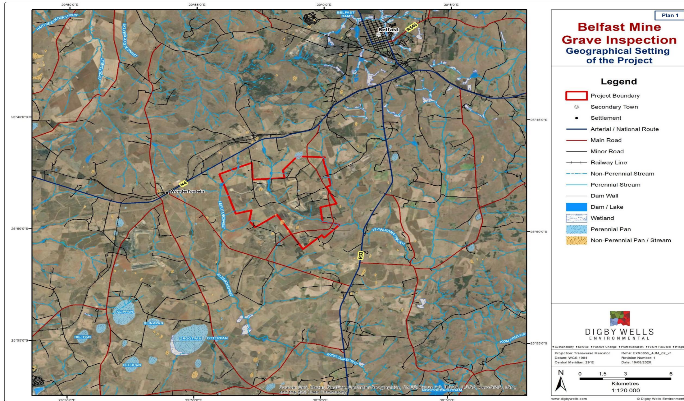
Plan 1: Location of Belfast mine