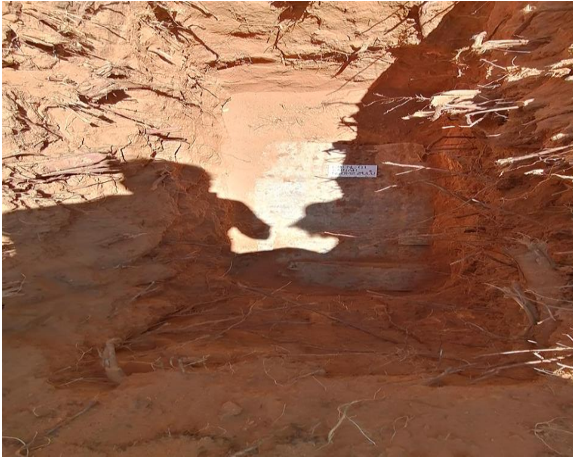
Figure 2-4: Exposed Corrugate Iron indicating Level of Remains