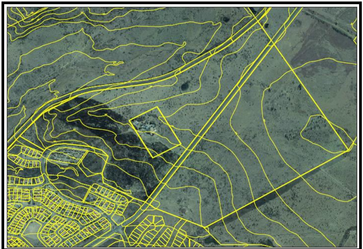
Figure 2. Map of the project area