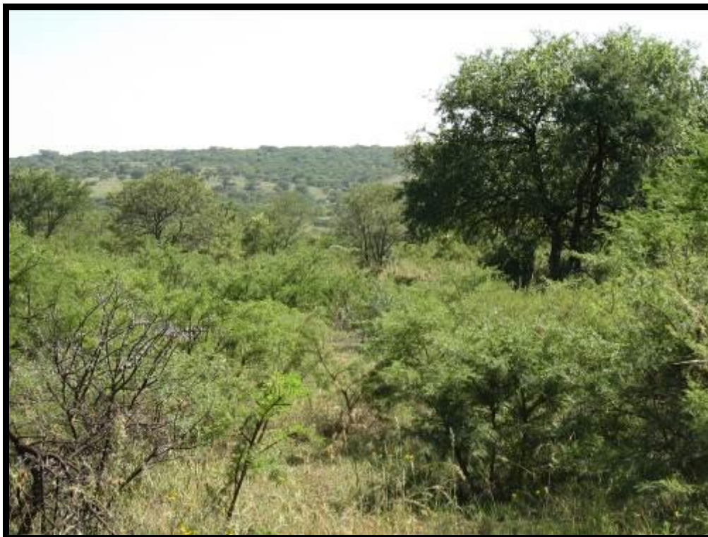
Figure 4. Photograph of the study area. No heritage sites or features occur on the footprint.