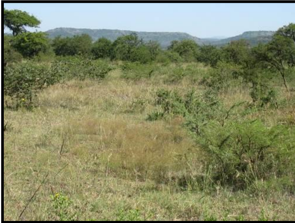
Figure 3. Photograph of the project area. Bush encroachment is evident in the foreground.