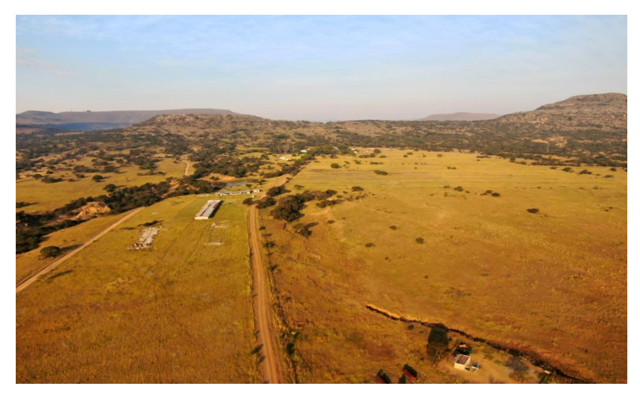
Figure 5: An overview of section of the proposed area.