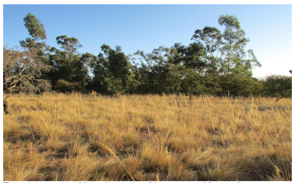
Figure 4: An overview of the northern section of the area proposed for powerline.

16 | Cultural and Archaeological Impact Study