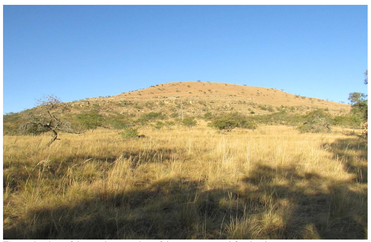
Figure 2: View of the southern section of the area proposed for development.

15 | Cultural and Archaeological Impact Study