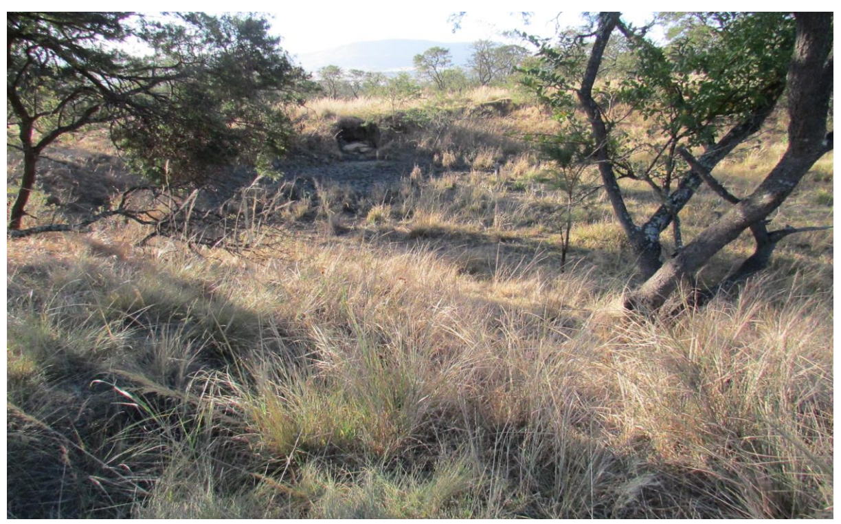
Figure 3: View of section of the north-eastern section of the area proposed for powerline.