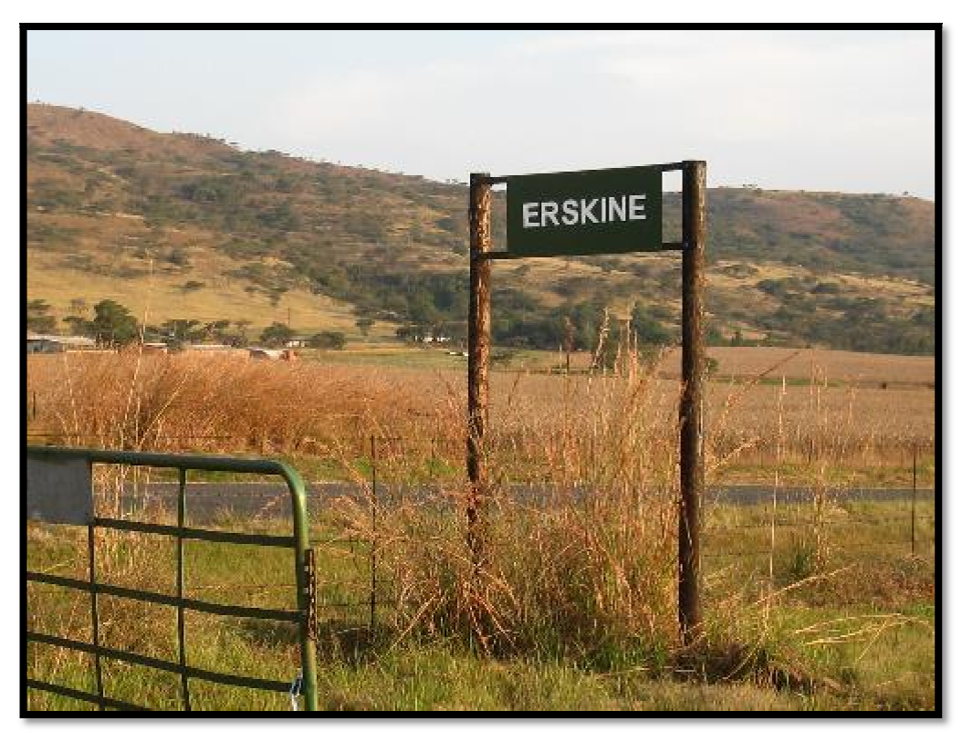
Figure 3. Entrance gate to Erskine Farm near Winterton.