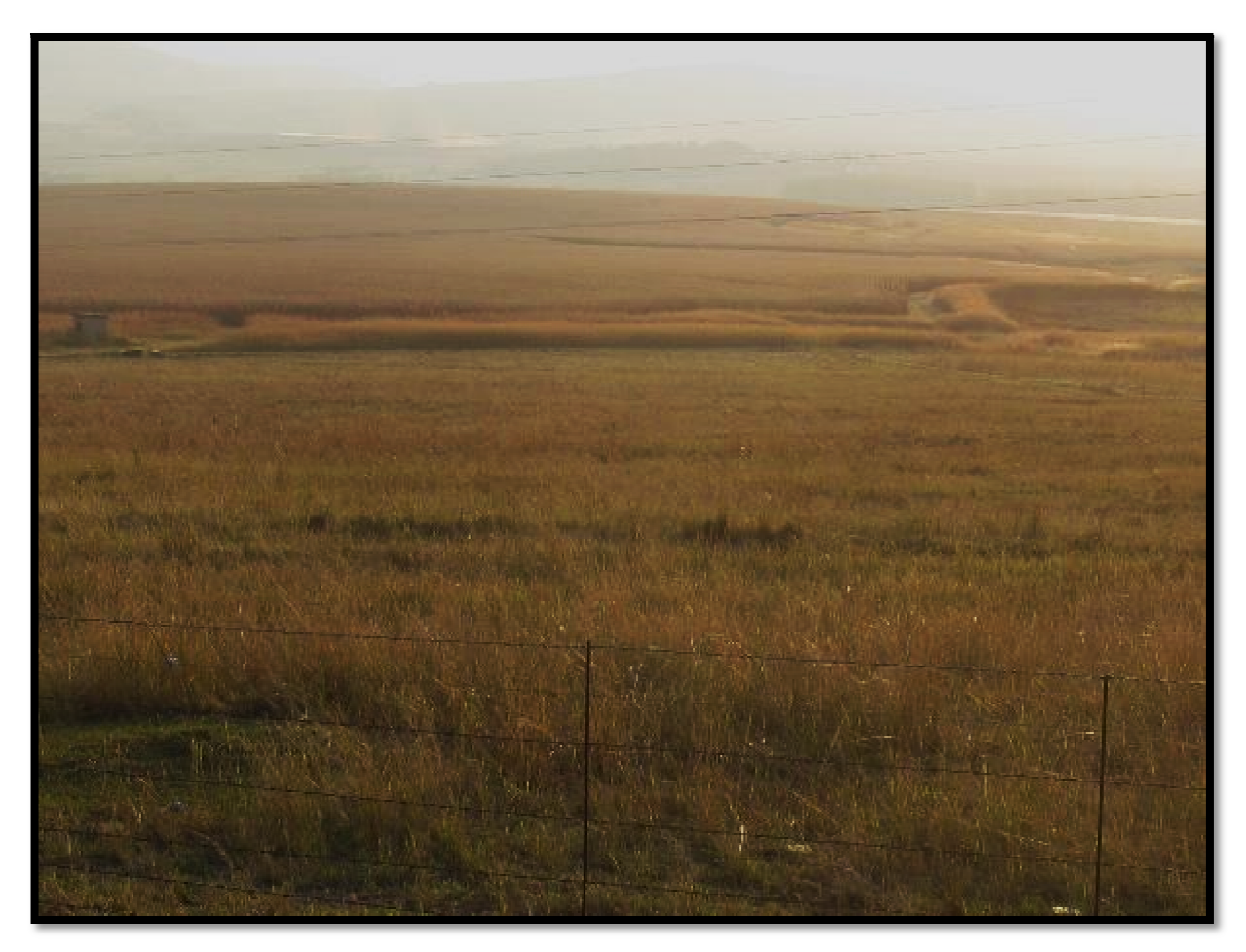
Figure 5. View over Erskine Farm.