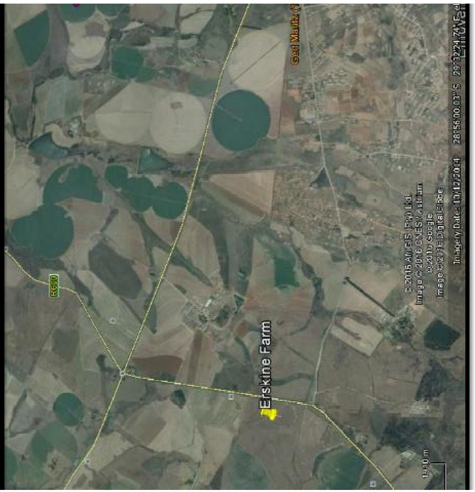
Figure 1. Google aerial photograph showing the locality of Erskine Farm near Winterton. The old farm of Voortrekker leader Gerrit Maritz is situated approximately 6km to the east of the footprint.