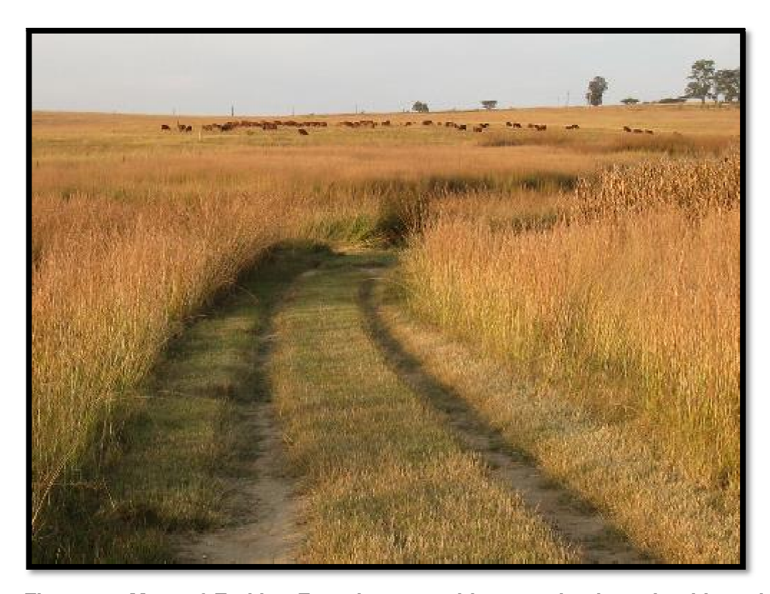
Figure 4. Most of Erskine Farm is covered by grasslands and cultivated maize fields.