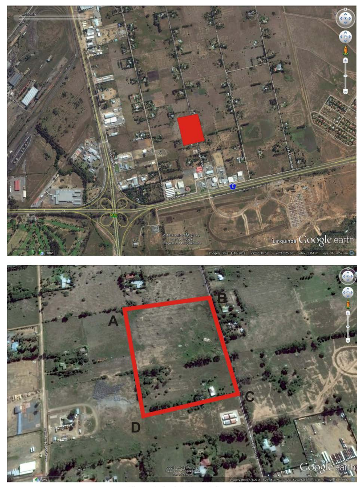
Figure 2. Aerial view of the study area.