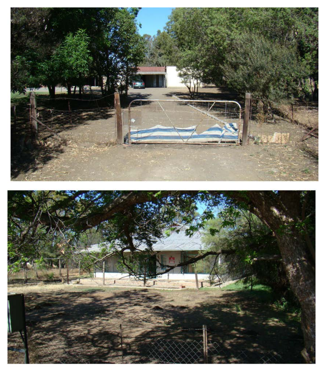
Figure 4. Rresidential structure