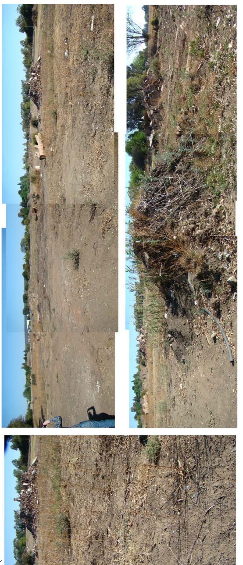
Figure 3. The condition of the terrain is largely disturbed.